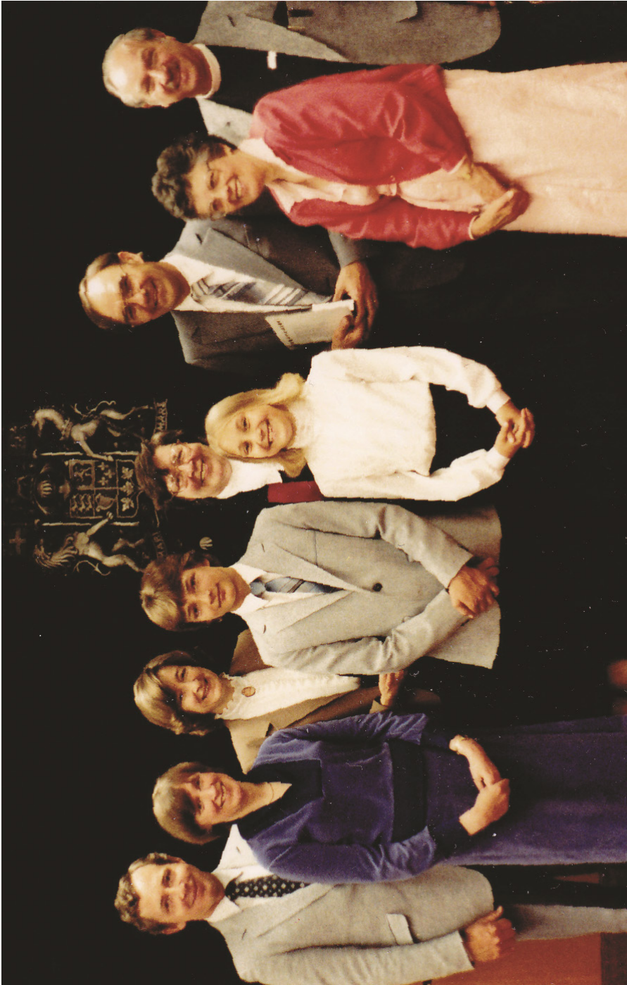
Figure 1.16: The Kloppers family and friends at the occasion of having become Canadian citizens, 1984