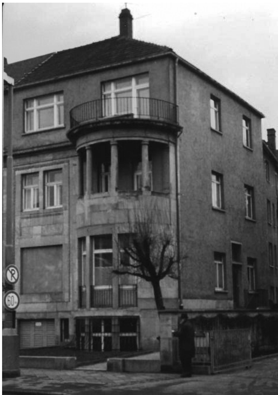
Figure 1.11: The Musicological Institute of the Goethe University, 1961