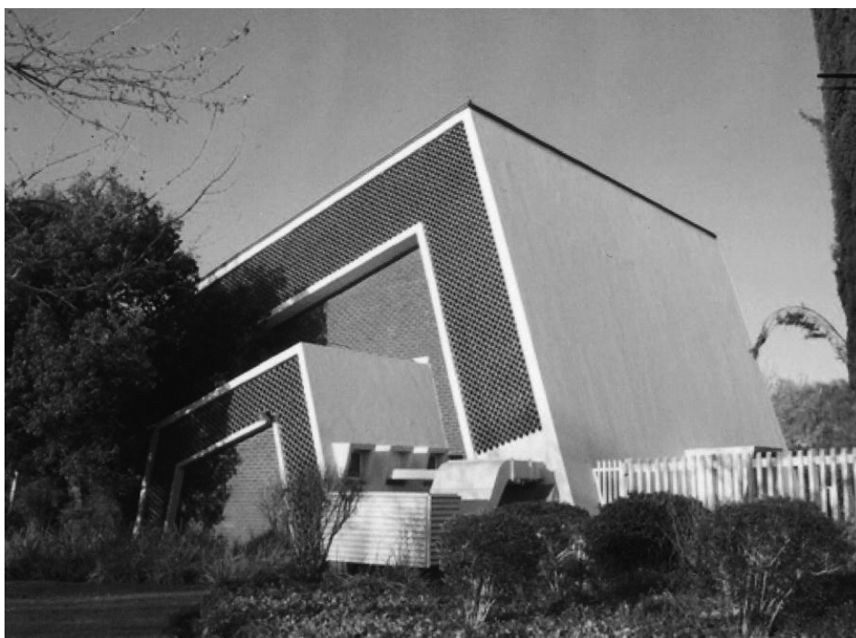
Figure 1.5: The Potchefstroom Conservatory during the 1960s 14