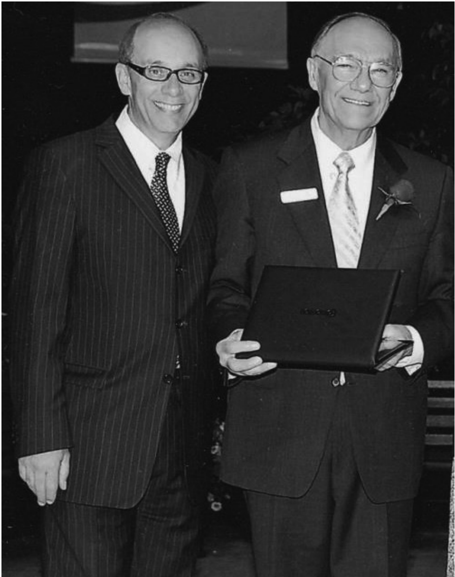
Figure 1.17: Kloppers with Edmonton mayor Stephen Mandel, at his induction into the Cultural Hall of Fame, 2008

While initially their emigration to Canada was traumatic for the Kloppers family, they found a rich and fulfilling life in Edmonton where, as a family