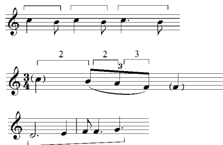
Example 4.9: Main Motives of the Concerto for Organ, Strings and Timpani