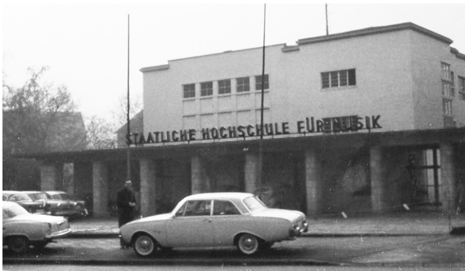
Figure 1.8: The Staatliche Hochschule für Musik, Frankfurt am Main

Knowledge thus gained laid the foundation for Kloppers' academic Bach studies, discussed in more detail later in this chapter, as well as in Chapter 2. Importantly, these were conceptualised at a time when performance practice traditions of Early and Baroque music became primary research foci in Europe, and were to influence performance practices for decades to come.