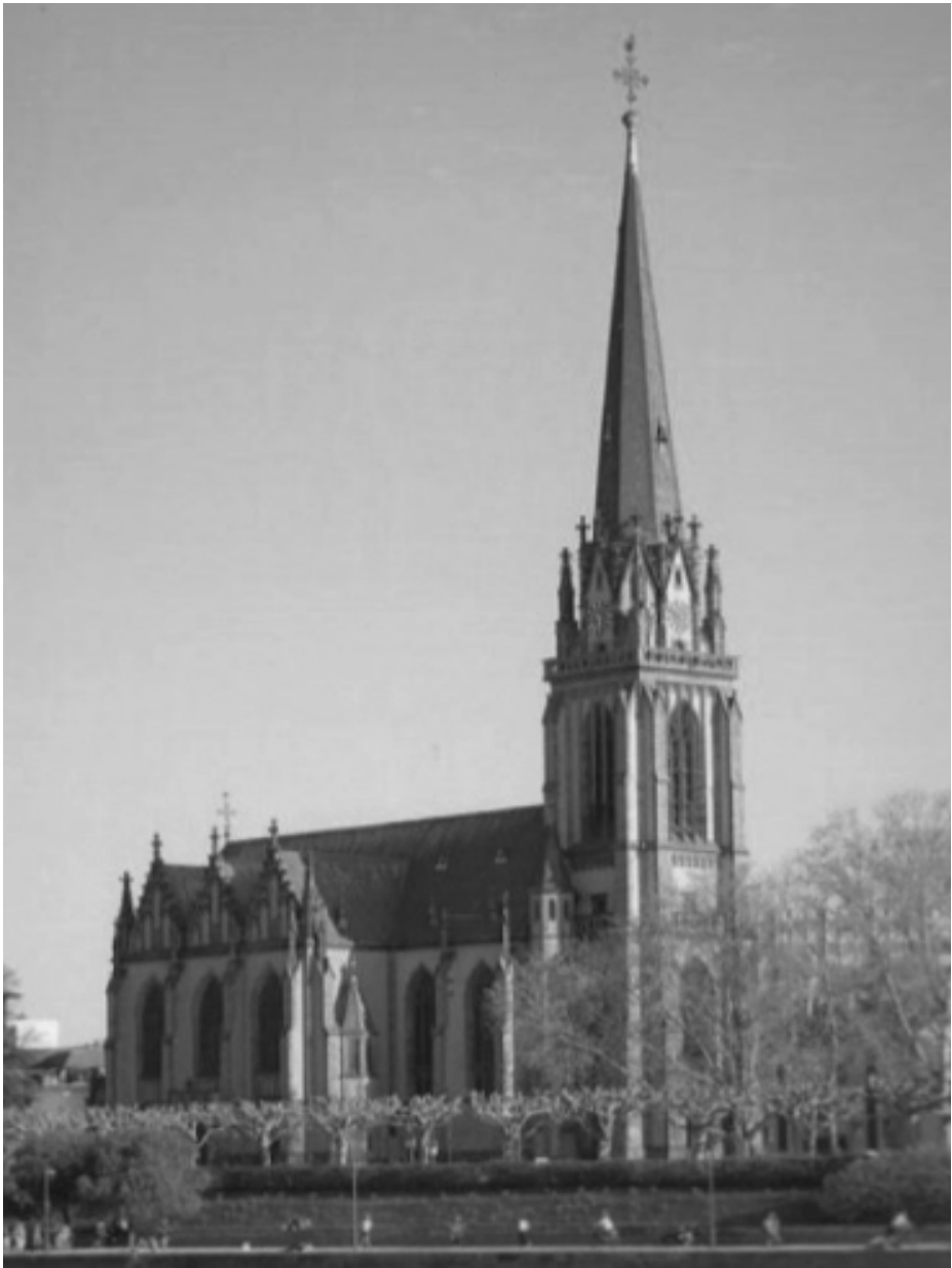
Figure 1.9: Dreikönigskirche, Frankfurt am Main 22