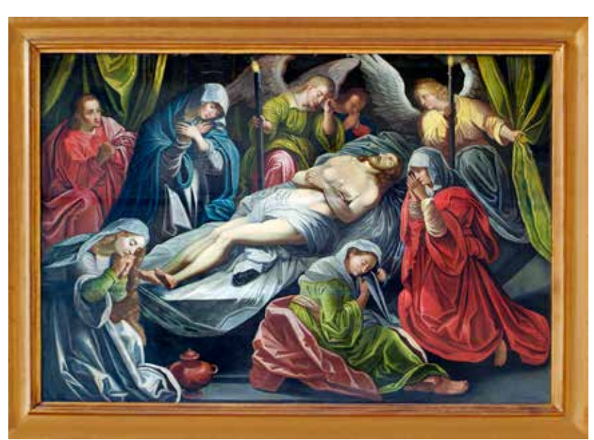
Figure E.1 The Lamentation of Christ

The thought that variation in gender could happen was reinforced by biological theories. Sex, like everything else in the human body, was determined by the proportion of the humours. This is why Aristotle regarded woman as a failed man: during gestation fire and heat had developed insufficiently, which caused her to be cold and humid. In medieval thought, this had consequences for capacities and morals: women were supposed to be less suited to intellectual labour and more inclined to sin. Medieval natural scientists and theologians acknowledged that the actual division of the humours was different for each individual. Thus, sex was not seen in terms of a stark contrast between men on one side and women on the other. Depending on the balance of heat and cold, individual men or women could be closer or further away from the opposite sex, with the hermaphrodite in the middle of the scale, viewed alternately as a magical or a monstrous being. The humours could be manipulated: an ascetic lifestyle was supposed to increase the proportion of fire and therefore made both men and