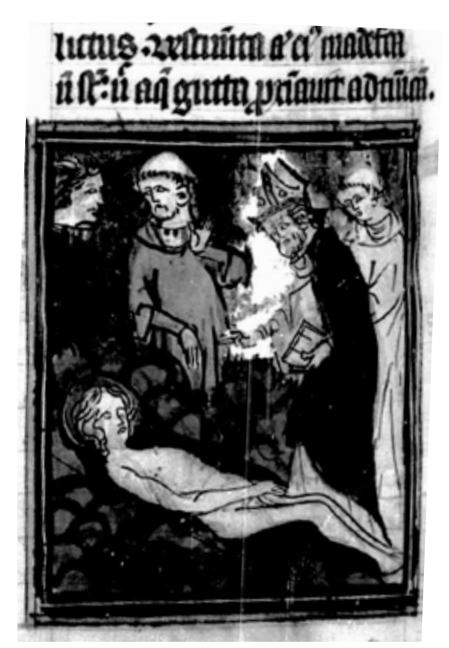
Munich, Bayerische Staatsbibliothek München, MS Clm 10177, fol. 373v.

point, the saint's gender identity is reinscribed by their father and monastic community, their genderqueer identity is ignored, and they are celebrated as female. This therefore leads to the erasure, or at least minimization, of the saint's non-normative gender identity and expression.