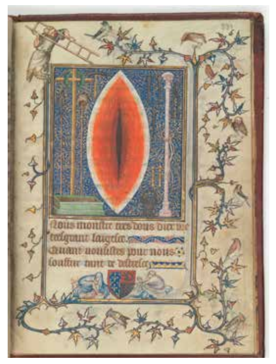
Figure 5.2 Psalter and Prayer Book of Bonne of Luxembourg

New York, Metropolitan Museum of Art, The Cloisters MS. 69.86, fol. 331r. CC0 1.0 Universal