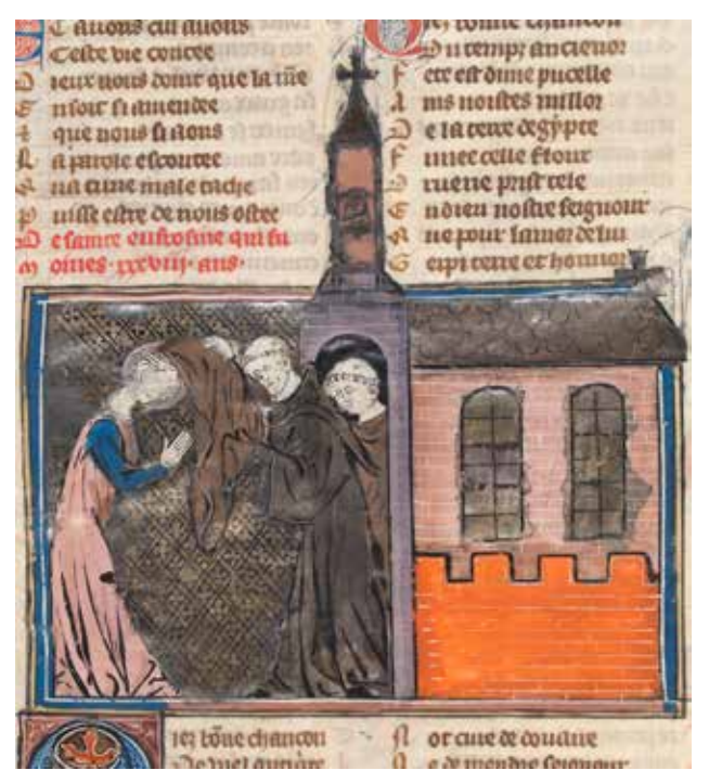
The Hague, Koninklijke Bibliotheek, MS 71 A 24, fol. 61v.

occurred before the paint had fully dried.<sup>49</sup> A lack of facial hair, which was a common visual signifier of eunuch identity, is used by the Fauvel Master here to distinguish the saint from the other monks, and it also serves to highlight their genderqueer identity.<sup>50</sup> Although one could argue that the lack of facial hair was used by the artist to present the saint as female, an examination of the right register of this miniature suggests that this is not the case. In the right register, the saint is depicted with long hair without the tonsure which serves, as will be discussed later, to illustrate the monks' discovery of the saint's assigned sex.<sup>51</sup> Considering that the Fauvel Master