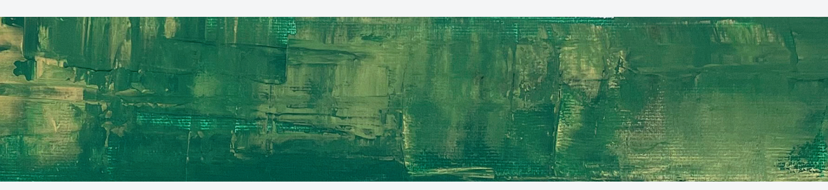
PERSPECTIVES ON MEDIA, ACADEMIA AND SOCIO-POLITICAL SCAPES FROM EUROPE AND CANADA