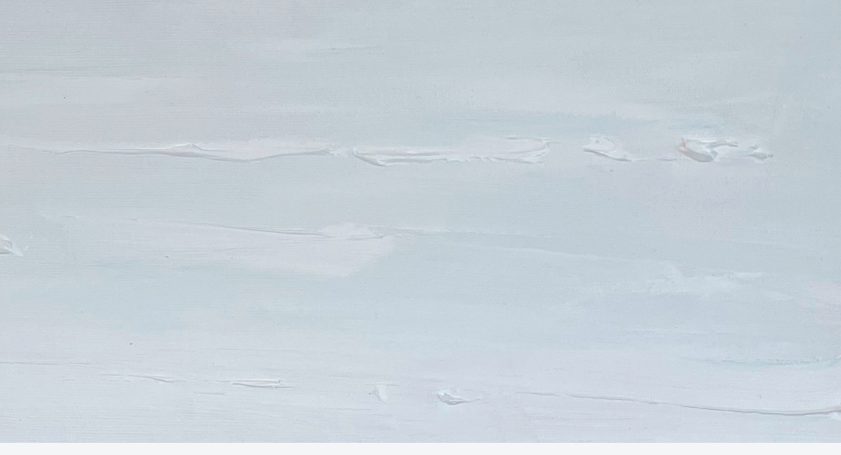
ISLAMOPHOBIA AS A FORM OF RADICALISATION