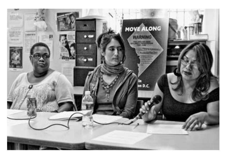
Figure 1.1. The Alliance for a Safe and Diverse D.C. holds a press conference to announce the report "Move Along" on policing of prostitution in Washington, D.C. Spring 2008.