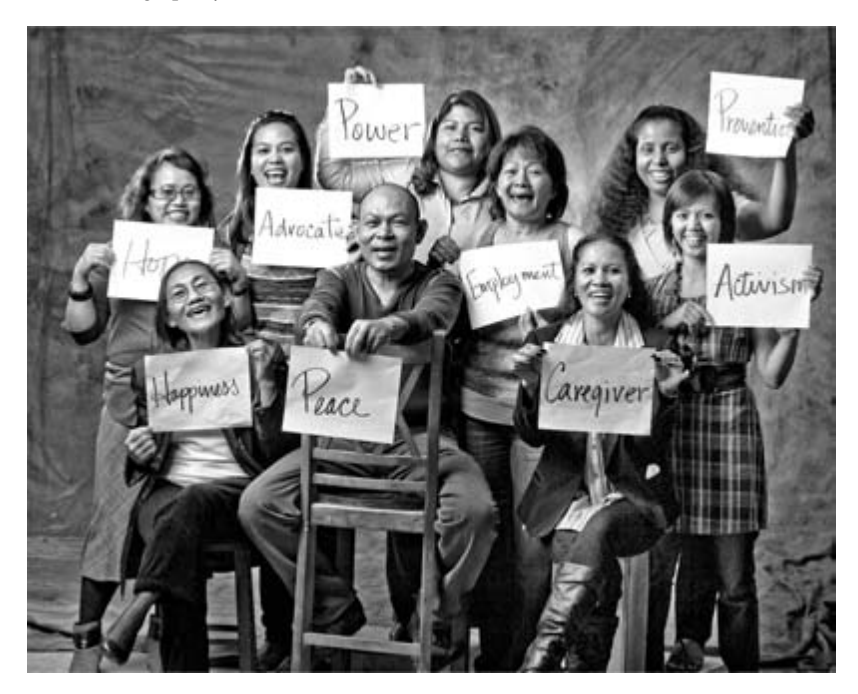
Figure C.2. Members of the Survivor Caucus of Cast (Coalition to Abolish Slavery and Trafficking) with words that hold special meaning to them, 2011.