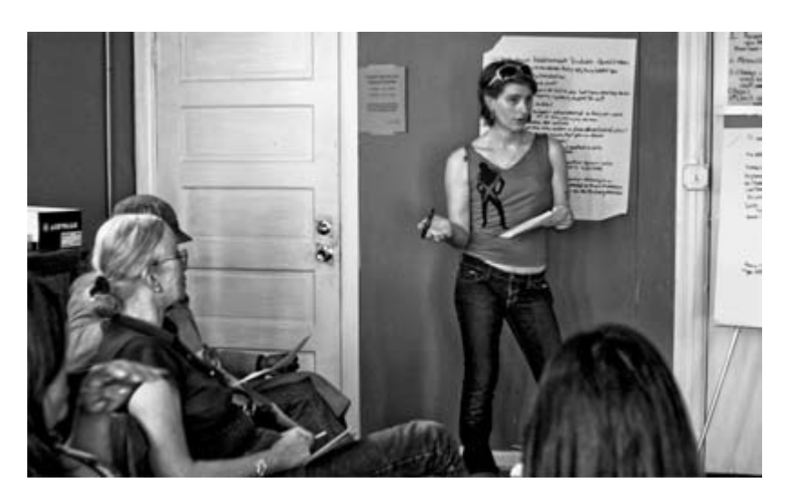
Figure C.1. Alliance for a Safe and Diverse D.C. presents initial findings from its research on policing of prostitution to community members for insight, spring 2008.