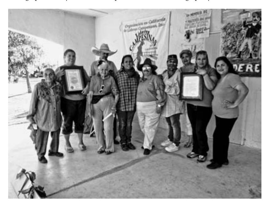
Figure 1.7. A community fights together. Lideres Campesinas. April 2012.