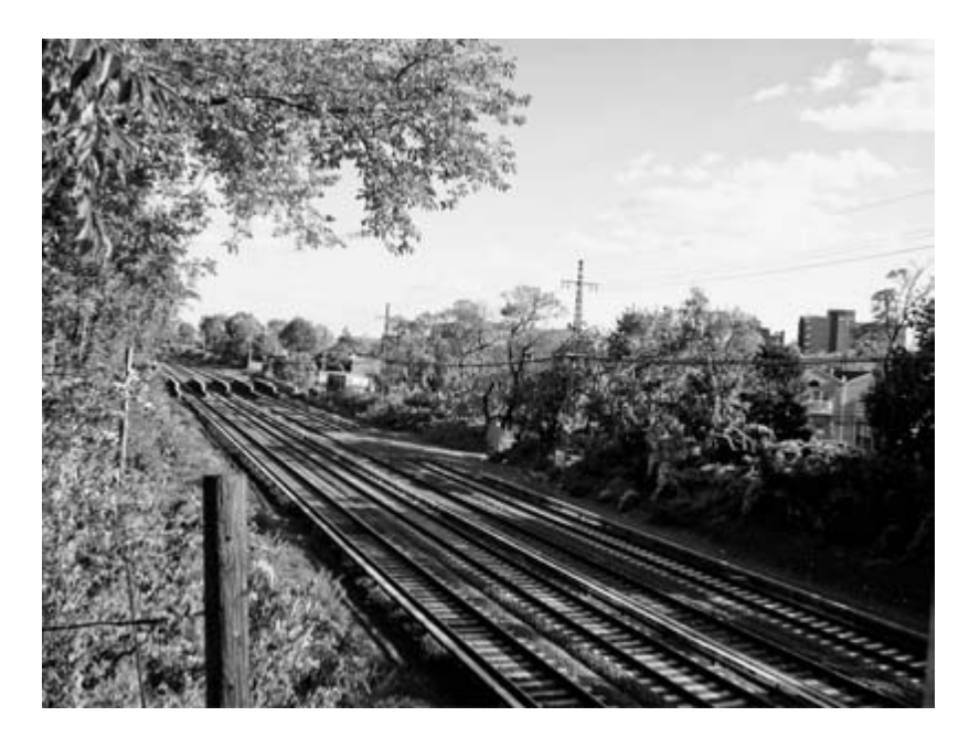
Figure I.2. Train tracks near Carmen's house.

to cut it. "I want a new look. I want to feel like I did when I wore a wig as Cleopatra last year for Halloween. I want a fresh start."