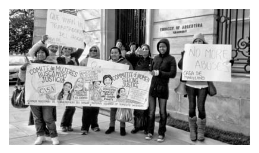
Figure 1.8. Domestic worker organizers from CASA de Maryland protest outside the Embassy of Argentina in Washington, D.C., December 11, 2012.

arrivals they have had to refine their outreach methods. As organizers in Oxnard explain: "Flyers don't work because not everyone can read. Radio doesn't work, since not everyone has a radio, especially new arrivals. So now we go house to house and work in Mixtec, Triqui, and Zapotec [languages]." They also conduct outreach and rights workshops in the fields late at night, between midnight and dawn. These organizers worry, however, that with so much abuse they cannot possibly "fight every battle." "We don't want to do outreach, raise expectations, and then destroy our credibility. We don't have enough attorneys to take on all the cases out there." Overwhelmed by the number of cases of abuse, this farmworker-organizing team empowers workers to secure their own rights: "We try to impress [on them] that they have the right to earn the minimum wage and receive lunch and a break time. They have a right to water, individual cups, and clean bathrooms. We also teach where to go if you have trouble." But making demands does not always yield results. A day-laborer organizer in Virginia recounts what happened when a young man from Mexico pursued the $100 he was owed: "He called the guy a couple of times, who did nothing to pay him. He eventually stopped calling explaining, 'It's only $100.'" A farmworker-activist in California found similar frustration among workers who were "resigned to the fact that nothing will happen."