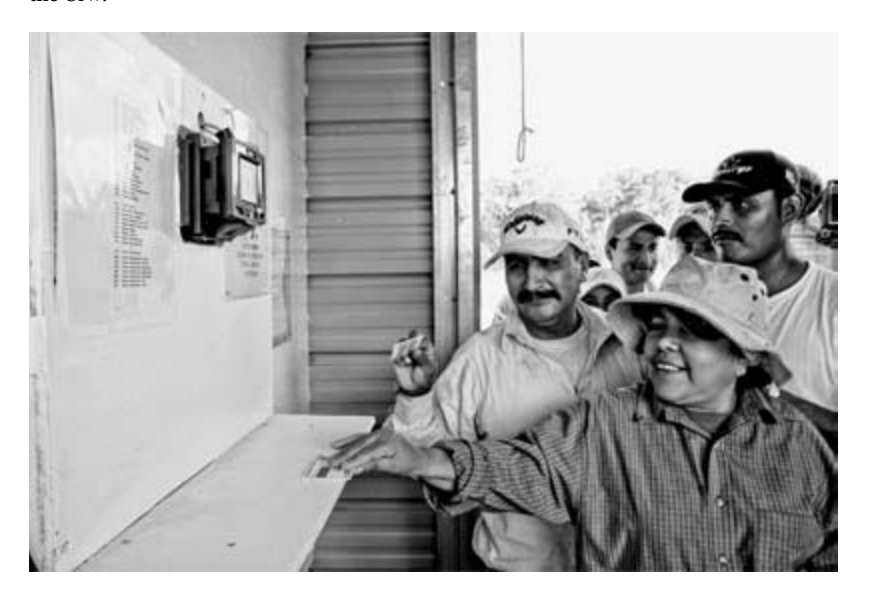
Figure 1.10. Tomato pickers "punching in" at the beginning of work on a participating farm to ensure their receipt of minimum wage, April 2011.