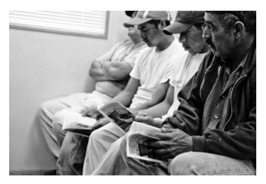
Figure 1.9. Tomato pickers receiving a "know your rights" education session facilitated by CIW farmworker staff, April 2011.