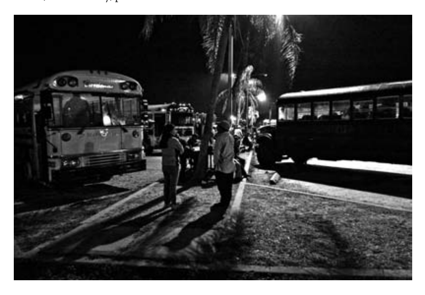
Figure 1.5. Morning "shape-up" in Florida today.