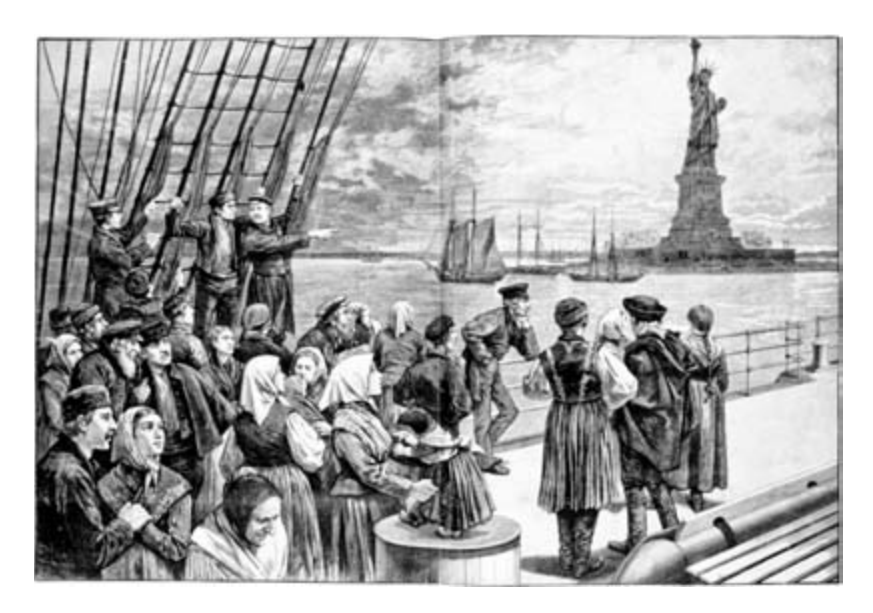
Figure 2.1. Welcome to land. "New York—Welcome to the Land of Freedom—An ocean steamer passing the Statue of Liberty: Scene on the Steerage deck." Sketch by staff artist in Frank Leslie's Illustrated Newspaper , July 2, 1887, 324–325. LC-USZC2-1225, from Library of Congress, Prints and Photographs Division, Washington, D.C.