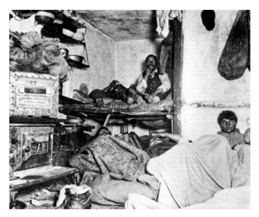
Figure 1.2. Lodgers in a crowded Bayard Street tenement, "five cents a spot." Photograph by Jacob Riis, How the Other Half Lives (New York: Dover Publications, 1971), 58. Originally published in 1890.

industrial settings. Later photographers hired by the Farm Administration during the Great Depression documented rural poverty. Whether they required dump picking, coal shoveling, construction and ironwork on beams in the sky, or farmwork without protective gear from sun and pesticides, job sites were dirty and dangerous. Workers were expendable. These photographers' iconic images depicting women, men, and children laboring under horrendous conditions helped enact legislation and ignite social movements. Commissioned by the National Child Labor Committee to document child-labor abuses, Hine's more than five thousand photographs between 1908 and 1921 helped persuade lawmakers to pass child-labor laws. Dorothea Lange's photos of migrants in California were influential in securing federal funds for housing. Later in the century, in 1960, the television broadcast by Edward R. Murrow on the plight of farmworkers in Florida, Harvest of Shame , also offered images of worker exploitation and poverty wages in the United States. In the documentary, Murrow refers to fieldwork