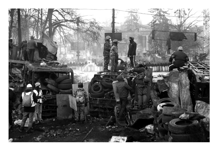
Defensive barricades at EuroMaidan.

the Russian town of Rostov-on-Don. In what appeared to be a direct response to Yanukovych's abdication of control, Russian soldiers quickly invaded the Autonomous Republic of Crimea and facilitated a military coup. New policies ushered in the dissolution of Ukrainian police and military establishments, the systematic oppression of ethnic minority Tatar communities living on the peninsula, and the reformation of the health-care system with the express purpose of disenfranchising Crimeans who use drugs. On April 2, 2014, Viktor Ivanov, then the head of the Russian Federation's Drug Control Service, publicly announced his intention to close all MAT programs in Crimea (Dunn and Bobick 2014), as MAT programs are illegal under Russian law. Ivanov characterized his desire to manage Crimeans who use drugs in eugenic terms, saying, "The 'rejuvenation' of drug addiction in recent years and the increasing number of female drug addicts [in Crimea] is causing a rise in the number of births of children with various disabilities, which is a threat to the gene pool" (Ivanov 2014). About eight hundred patients were receiving MAT in Crimea when the shutdown occurred, of which more than one hundred have since died due to overdose, suicide, and other fatal outcomes widely known to follow the abrupt cessation of treatment (Cornish et al. 2010; Davoli et al. 2007; Degenhardt et al. 2009).