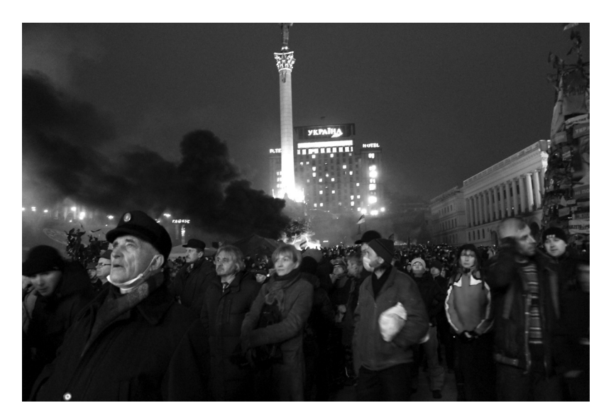
The EuroMaidan protest camp, February 20, 2014. Barricades burn to keep the state police at bay after dozens of demonstrators were killed by police violence.

of more than one hundred civilians. Lawyers, farmers, students, and even university professors were among the dead.