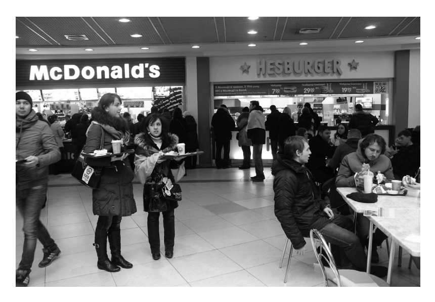
EuroMaidan demonstrators gather in the food court of the Globus shopping mall for a meal.

relied on food and supplies brought in from the outside, the vast majority of protestors stopped by the square only during weekend rallies or in the evenings after work. They could eat at home whenever they pleased. Besides that, the Globus shopping center, a luxury mall that was built underground in Kyiv's city center, remained open during the protests. One could take an escalator down from inside the barricaded square into the mall's food court and buy a pizza or a hamburger at any time. The protestors with whom I spoke, however, felt a deep appreciation for the modest soups and canapés that were served from the kitchens. These foods fostered a strong atmosphere of solidarity and mutual assistance—of collective "dividuality."