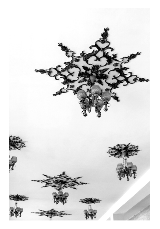
Decorative ceilings in a building now used as an HIV hospital in Kyiv.

walls and ceilings of one of its larger meeting rooms, betraying its past life as some kind of elite clubhouse or banquet hall.