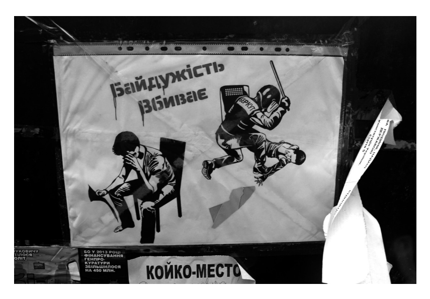
A flier posted in the EuroMaidan protest camp, which reads "Indifference kills" (Ukr: Baiduzhist' vbyvaie ).

priate "wanting." It is, in fact, considered to be a social ill in its own right. For example, when I would casually complain to my friends about various difficulties I had encountered throughout my day, they would diligently assign blame to the indifference of others. The cashier at the post office was indifferent to the fact that I needed help buying postage for my parcel. The owner of the BMW who parked across the sidewalk in front of my building was indifferent to the needs of pedestrians. The huffy responses I received from the cashier at the train station who wanted me to move out of platzkart can also be explained with an appeal to indifference—not hers, but my own. She was terribly frustrated by my lack of desire to improve my situation. She surely believed I was destructively indifferent to my own well-being.