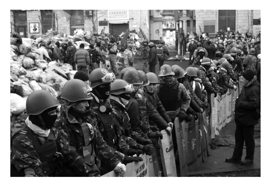
Self-defense groups man the barricades at EuroMaidan.

EuroMaidan camp: animals, zombies, prostitutes, and "addicts." Similar accusations of brainwashing, "addiction," or simply inducing a drug-addled psychological state, were hurled back at EuroMaidan protestors by opposing government actors and media outlets in both Ukraine and Russia. A favorite accusation of my own, which circulated in less-reputable social media forums, held that the massive barricades that EuroMaidan protestors had made of snow and ice were, in fact, constructed out of sandbags filled with drugs and that the water poured over them to create ice in Kyiv's subfreezing temperatures was, in fact, liter upon liter of vodka. Even the fighters on either side of the conflict, those who risked their lives over this disagreement about the future of Ukraine, could find common ground in the belief that people who use drugs were the enemy of a good society, however you define it.