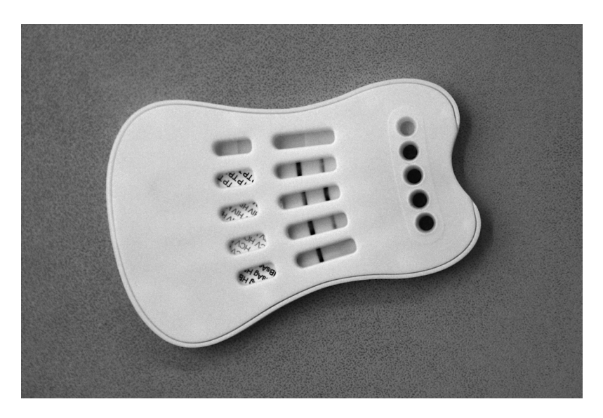
A rapid test, used by the outreach organization in L'viv, which screens for hepatitis A, hepatitis C, HIV, and syphilis.

little windows revealed positive results for HIV, hepatitis A, and hepatitis C. The syphilis test was negative. The nurse pointed to the syphilis result saying, "We didn't have many today. We rarely do. When we have positives for syphilis, almost everyone that day is positive." She went on to explain that viral infections like HIV and hepatitis were so common among program participants that a slate-full of negative results would be something of an anomaly. Syphilis, however, tended to appear largely within tight-knit social groups, as it is transmitted sexually rather than through the sharing of injection equipment. Networks of intimate social relationships often include some arrangement of sexual relationships as well. A positive syphilis test, therefore, likely indicates less about an individual's substance use or other risky behaviors than about the size and the composition of the peer groups into which those behaviors are embedded.