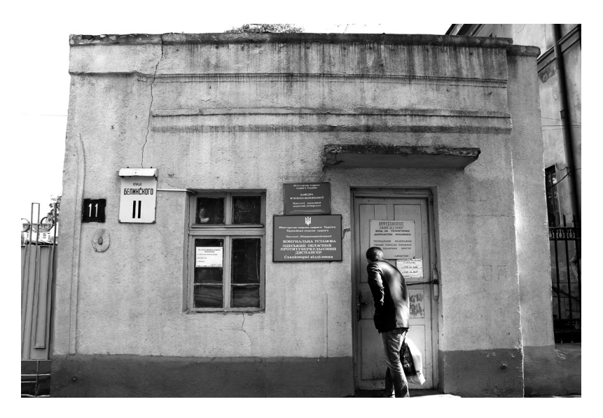
The entryway to a local hospital that provides MAT services.

strict regimen of prescription medications that stabilize their cycles of euphoria and withdrawal. Opioid agonist drugs used for MAT, specifically methadone and buprenorphine, help curb cravings for illicit opioids by binding to \mu -opioid receptors in the brain, the same receptors that all opioids, including morphine and heroin (diacetylmorphine), bind to, thereby controlling withdrawal symptoms and cravings to use (Kosten and George 2002). The logic of this therapy is not unlike that of nicotine patches designed to help cigarette smokers quit smoking. It allows individuals to closely regulate and control their intake of a class of substances for which they have developed a physical dependence and alter the social milieu in which that consumption takes place. It provides the stability many need in order to address the larger issues that led to problematic substance use in the first place.