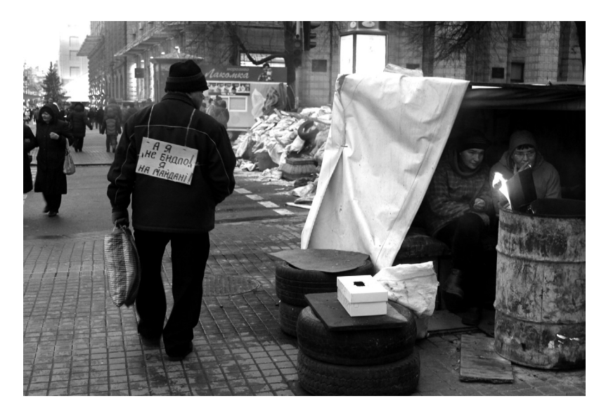
A man walks through the EuroMaidan protest camp wearing a sign that reads "Because I am not cattle, I am at the Maidan!" (Ukr: A ya ne bydlo! Ya na Maidani!).