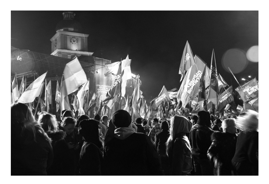
A rally organized in support of the political party of Viktor Yanukovych, the Party of Regions, November 2012.

transition of power. Again, as Ioffe succinctly observed, much was made of the language differences across Ukraine-especially the fact that the Donbas region is predominantly Russian-speaking and largely populated by people claiming Russian ethnicity—in the interest of providing a clean and pithy analysis of these new displays of political unrest. Yet economic and ideological divides are perhaps much more salient than these, as significant disparities between Ukraine's eastern and western regions have grown steadily since Ukraine's independence in 1991 (Skryzhevska, Karácsonyi, and Botsu 2014). Donbas residents, for example, have typically relied more heavily on pension payments and other state services than their western counterparts, a situation that fuels a shared nostalgia for socialist periods, which many often associate with both economic stability and, most importantly, with Russian political control (Skryzhevska, Karácsonyi, and Botsu 2014). As historian Sergei Yekelchyk has observed, "The anti-Maidan struggle was ... not against Europe per se [as EuroMaidan was, in part, a pro-European movement], but for Ukraine's identity in relation to Russia" (Yekelchyk 2014, 68).