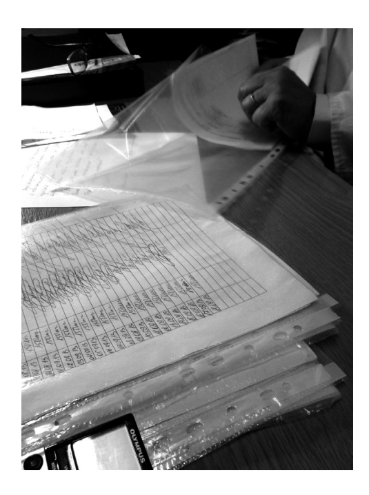
A sample of the many handwritten forms that must be maintained in hard copy at a busy MAT clinic in L'viv.

paper, never scanned, never digitized, never transferrable except in hard copy. It is incredibly difficult to do something as simple as a medical chart review-a post hoc form of medical research wherein data from an array of health records are aggregated and analyzed to study trends in patient outcomes-because it is impossible to generate databases of de-identified health information. All data are kept on physical sheets of paper with every patient's name, date of birth, and contact information printed across the top. In 2012, a colleague of mine from the United States was able to conduct a limited chart review at a regional HIV hospital in L'viv only because the head doctor volunteered to spend several of her afternoons obscuring patient identifiers on medical records with masking tape. She covered the headers of every single paper file needed and then delicately removed the masking strips when the review was complete so the records could be refiled. This effort was nothing short of extraordinary. Similarly, the records Aleksey kept, tracking every detail of his patients' behavior in the clinic, are prohibitively cumbersome to analyze en masse and contain data that are largely useless