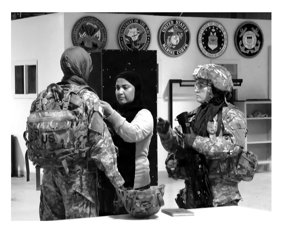
FIGURE 1. Female engagement team training, US army base.

Humanitarian rhetoric deployed in support of the FETs morphed into promotion of women's utility in combat, often on the basis of their emotional expertise. The work performed by special operative CSTs forms the basis of chapter 5. CST narratives show how even combat-intensive special operative missions further