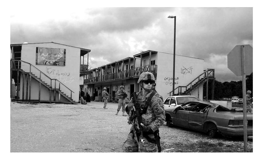
FIGURE 7. District Stability Framework training, US army base.

sets dressed with certain elements of Iraqi or Afghan culture (figure 7). This particular simulation was typical of those housed on multipurposed military bases where a portion of the base was dedicated to simulation, in contrast to the National Training Center's permanent installation of mock villages and commitment to mimesis.