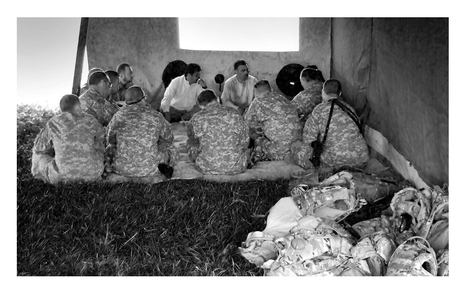
FIGURE 8. Provincial Reconstruction Team training, US army base.

Nancy, several other DSF contractors, and I sat on the edge of the circle and listened to the conversation. Members of the security force stood at posts around the tent. Another group of soldiers, who were out of play, observed the exercise while kneeling on one knee in a straight line outside of the circle.