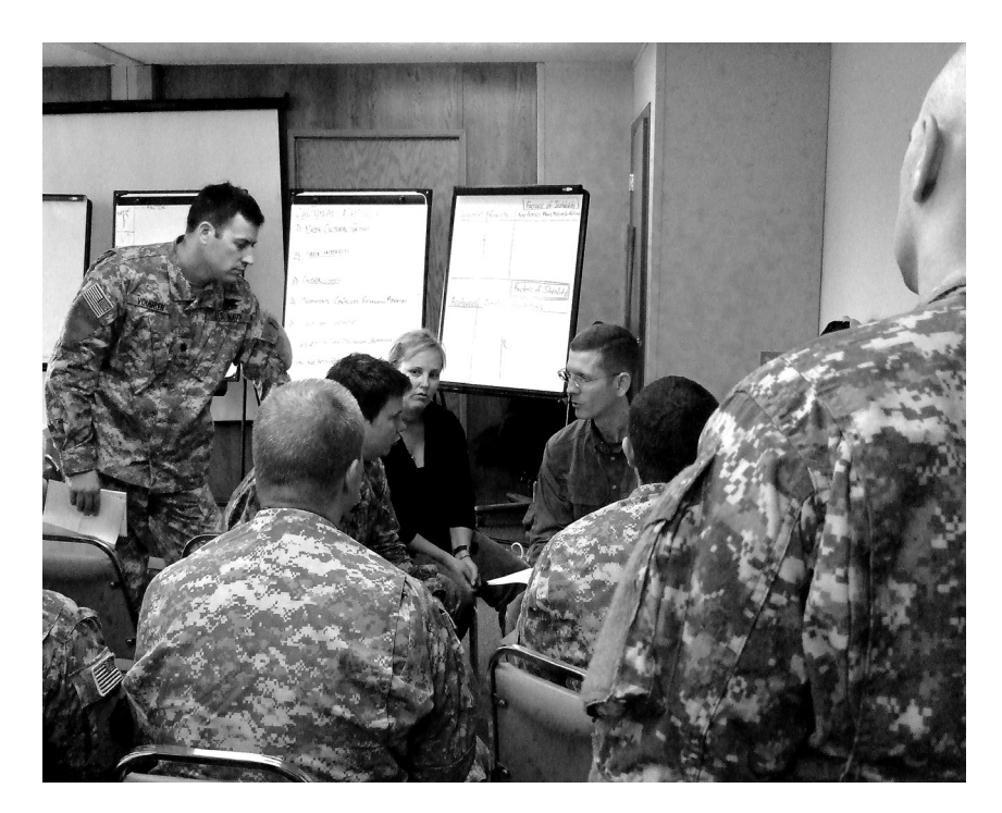
FIGURE 6. District Stability Framework training, US army base.

health care and providing education projects for local children. The idea of "helping them help themselves" reflected the racial evolutionism and nurturant parent aspect of the commander's proud parents concept covered in the counterinsurgency section of the course, before the DSF.<sup>39</sup>