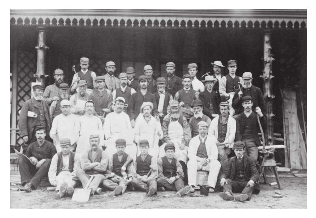
Figure 5.1 Craftsmen working on Mar Lodge, Aberdeenshire, c .1910.

Mackenzie had an established team of skilled Aberdeen craftsmen to draw on for his north-east Scotland work, who lived in bothies on-site for the duration of projects.<sup>91</sup> The Mar Lodge construction was famed for its use of local-grown wood in the building structure and for interior panelling and some of furniture, though other furniture came from Maples of London, a fashionable store. 92 The stone came from the Duke of Fife's quarry at Braemar and the house design incorporated a 'beautiful verandah of rustic woodwork'. It was planned from the outset to include electric lighting and the projected costs were between £15,000 and £20,000.93 A photograph survives of the men who worked on Mar Lodge, formally seated together as the building neared completion. It reveals pride in craft and community, showing 35 individuals, with their trades and professions indicated by clothing and tools, posed in front of the house. The men seated on the ground at the front are plumbers, with one of them holding an impressive U-bend pipe and another displaying the soles of his hobnailed boots. A man on the far left holds tinsmith scissors. A suited young man with watch chain on the right is probably the clerk. An older man on the middle left with rolled plans under his arm is the builder overseeing the works. Men dressed in white are painters or plasterers. The second-to-back row has the carpenters, with their saws