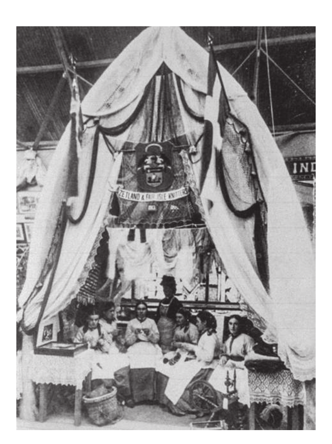
Figure 6.1 Shetland and Fair Isle knitters at the 'Jaw Bone' stand. Edinburgh International Exhibition, 1886, Women's Industries Section.

included Indian craftsmen engaged in handwork, which drew extensive newspaper comment and popular interest.<sup>55</sup> But before the first-time exhibition of Indian craftsmen in Glasgow in 1888, the Edinburgh 1886 exhibition had displayed the eye-catching 'Jaw Bone' stand in the Women's Industries section comprising a group of six women presented as a community of knitters from mainland Shetland and nearby Fair Isle. The women were there to raise awareness of their skills and sell hand-knitted goods made on the islands. The unusual shape of the stand, which is illustrated in contemporary photographs, reflected its construction from whale jawbones, signalling the role of whaling as another important Shetland industry. Shetland flags were displayed on either side of the Shetland coat-of-arms with its distinctive longboat motif and a horizontal banner reading 'Zetland and Fair Isle Knitters'. The display incorporated a spinning wheel, a woven kishie (basket) perhaps to hold skeins of wool and tables on either side of the stand draped with knitted fine-lace squares. A large shawl was one of many items pinned and draped above the knitters. Some of photographs of the exhibit included an older standing woman, Barbara Muir, who chaperoned the young knitters. She was the sister of