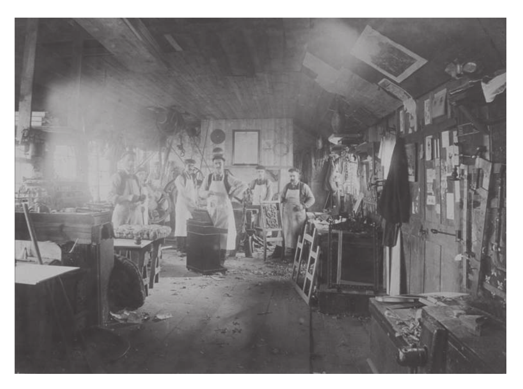
Figure 3.5 Danny Thompson's cabinetmaking workshop. Tain, c .1890.

death in 1906. He took many photographs of local scenes and people including 'characters of the town', mostly elderly men and tradesmen in their places of work and servants connected with some of the great houses nearby. He also published a series of colour-tinted photographic postcards for tourists showing notable buildings and street scenes. <sup>67</sup> He erected a special glasshouse to the rear of his shop for his studio portrait business. As a thriving town in a prosperous north-east farming district, Tain provided a constant flow of customers.