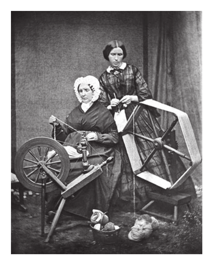
Figure 7.1 Mrs and Miss Ross. 'Household Industry in Tain Previous to 1850'. Tain, c .1865.

It was not just the actual practice of textile craftwork that garnered meaning, but also the equipment that held symbolic value. A ladies'