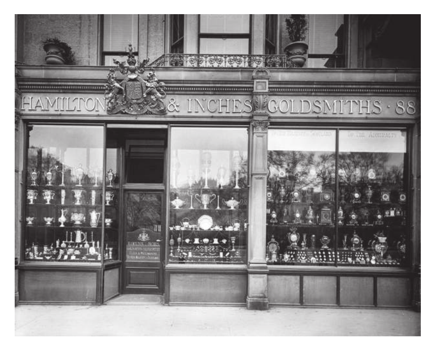
Figure 1.1 Hamilton & Inches, goldsmiths and silversmiths. George Street, Edinburgh, c .1895.

due to newer building materials and easier access for fire engines. 'Early yesterday morning a fire broke out in a back lane in Rose Street, in the tenement occupied as workshops by Mr Sommerville, painter, and Mr Hislop, dyer. The engines were soon on the spot and the fire was got out without doing much damage.'<sup>33</sup>