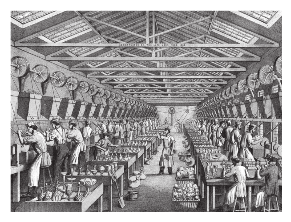
Figure 2.2 Cutting and engraving shop. Holyrood Flint Glass Co., Edinburgh, c .1860.

Firms like this, or those in the pottery industry, not only employed craftworkers within their own factories, they maintained close connections with smaller satellite firms acting as subcontractors. Much of the engraving work undertaken from mid century for the Holyrood company was done by workshops in the nearby Abbeyhill area of Edinburgh, which were mainly staffed by Bohemian glass engravers with specialist skills. The latter were especially associated with design innovation in engraving motifs and are credited with the fern pattern that came to exemplify the finest of Scottish engraved glass wares from the 1850s to 1880s.<sup>63</sup>