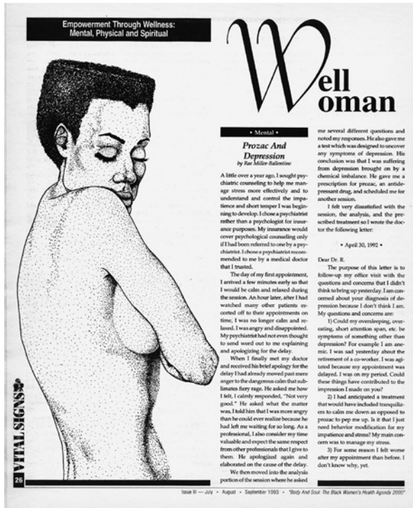
FIGURE 3.1 Example of a “Well Woman” page from Vital Signs .

contains in its second half chapters on emotional health, self-help, spiritual health, self-love, relationships and sex, domestic violence, incest and child abuse, HIV/AIDS, and workplace and environmental health hazards. These latter chapters in more and less explicit ways address both mental/emotional and spiritual health.