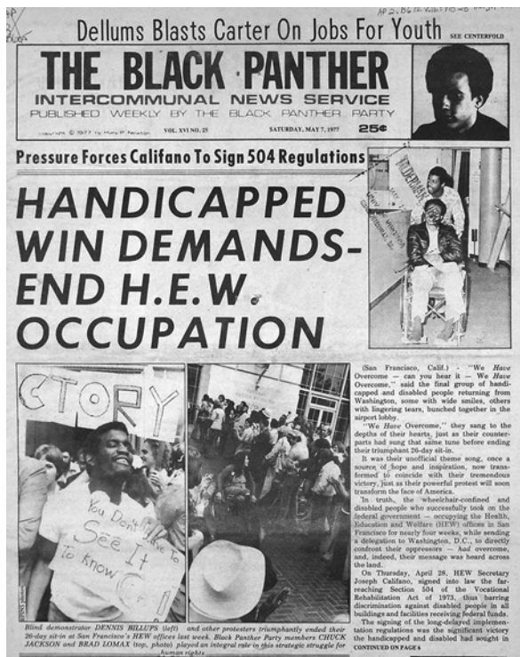
FIGURE 1.1 Cover of the Black Panther on May 7, 1977.

publication between 1967 and 1980 and thus provides a launching point for my analysis of Black disability politics within the BPP.