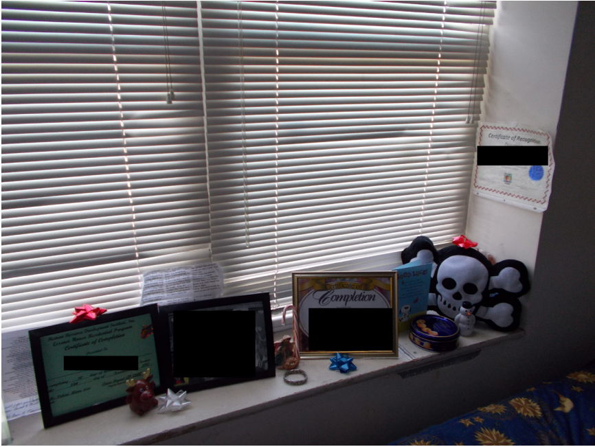
FIGURE 9. Certificates.

incarcerated nine times, used a photograph for our PEI to share evidence of her personal transformation process (figure 9). 73 The photograph showed a number of personally meaningful items she kept on the windowsill next to her bed at Growing Stronger, including framed certificates of completion for a drug treatment program, self-improvement class, and nutrition program; memorabilia from a large AA convening; a figurine of Mary holding baby Jesus; and a “spiritual warfare prayer” a drug treatment counselor had given to her. The objects were a physical manifestation of the 12-Step logic.