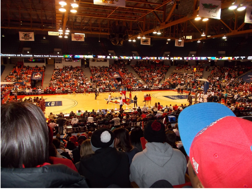
FIGURE 22. “Having fun being kids” (Photo credit: Moon).

She suggested a personal commitment to change was not enough; systemic change also was needed.