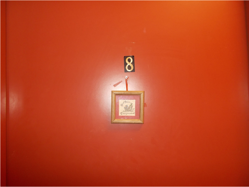
FIGURE 18. The Lioness's door.