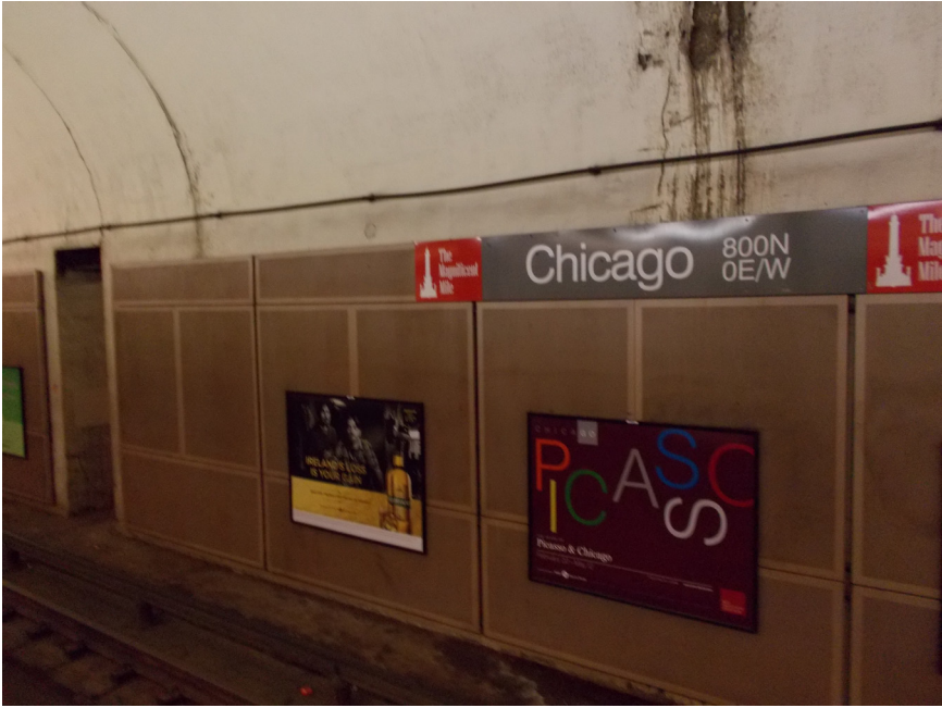
FIGURE 15. Two-hour commute to work each way.