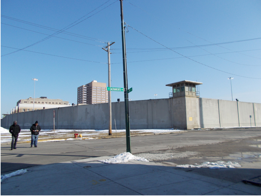
FIGURE 2. A spooky place.

ground, and then you come up through that back . . . Ooh! That's a spooky place . . . It just has an atmosphere like somebody dead. And it makes you think . . . if you're gonna be here for a while.