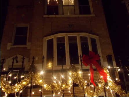
FIGURE 6. Starting Again exterior.