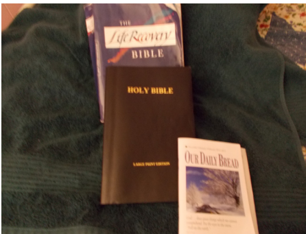
FIGURE 5. Religious books.

During our PEI, Tinybig, the woman whose photographs of an intersection near Cook County Jail open chapter 2, shared two photographs that symbolized the moral and spiritual underpinnings of the 12-Step logic. 52 We had been discussing some of the differences between 12-Step programs, such as AA versus NA. Tinybig concluded, “When it all boils down to it, the basic things about any A [i.e., Anonymous program] stems from the 12-Step program and the literature that goes along with it, because when you break it down it all reverts back to the Bible.” She then flipped through her photographs to find two she had in mind: one of a 12-Step meeting directory (figure 4) and one of religious books, specifically The Life Recovery Bible , the Holy Bible, and an “Our Daily Bread” booklet (figure 5). Placing the photographs side-by-side, she explained: