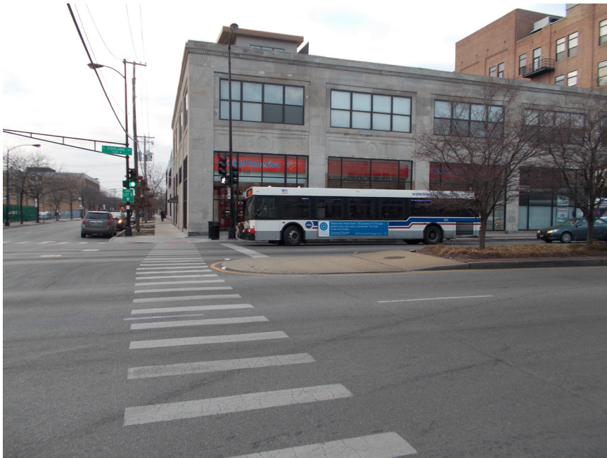
FIGURE 3. Bus ride to work.

what Moon referred to as mental trauma, that persisted even after “you make it back out.” The mask was still on, and Moon needed time and support to heal from the trauma of incarceration. 55