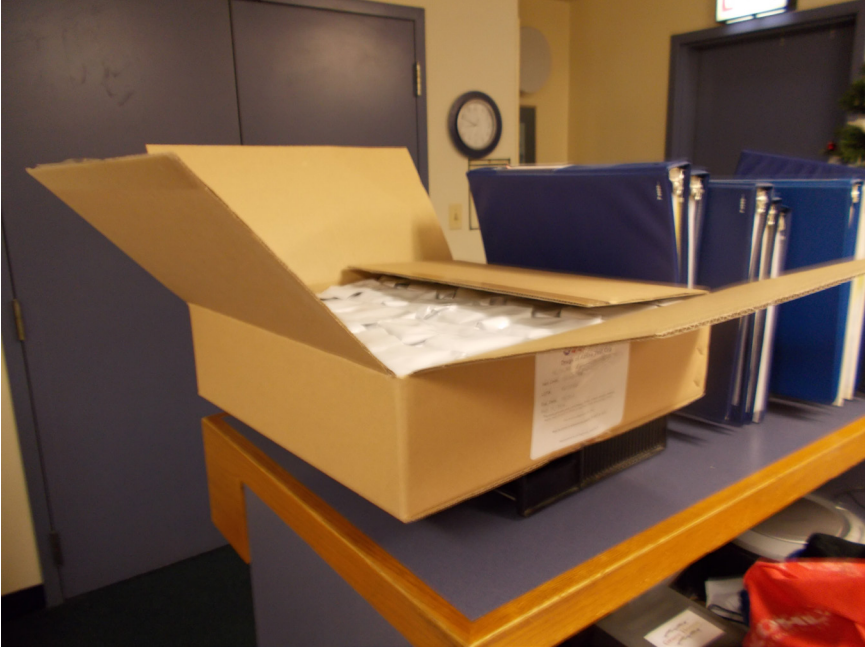
FIGURE 8. Drop cups at the recovery home.