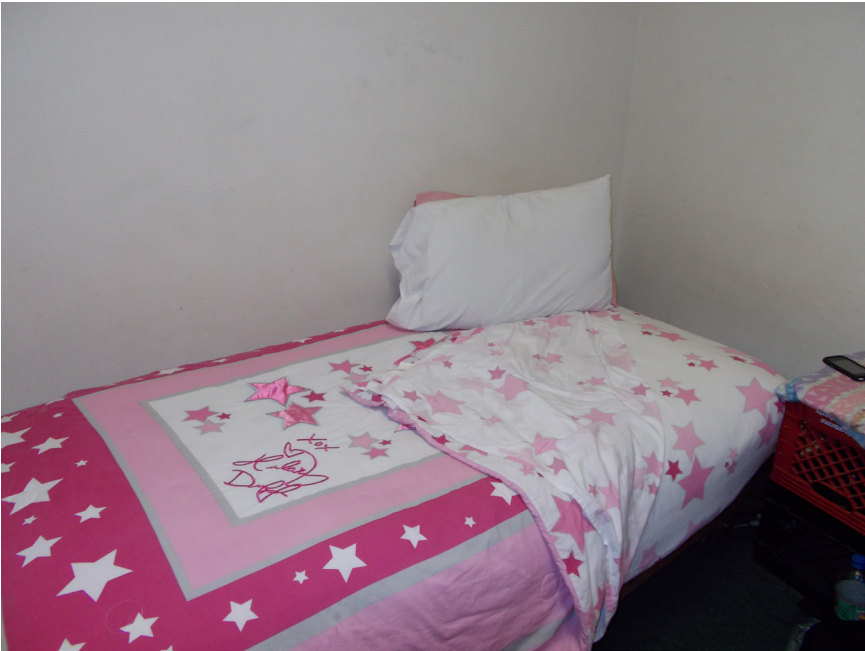
FIGURE 19. "I like my bed nicely made".