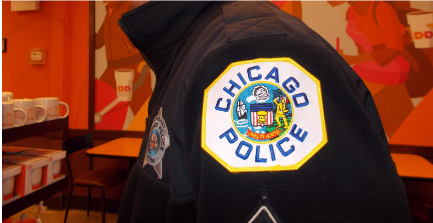
FIGURE 11. Chicago police.

and gendered identity. Her changed appearance reflected her commitment to the deep internal moral and spiritual identity work the rehabilitated woman controlling image demanded.