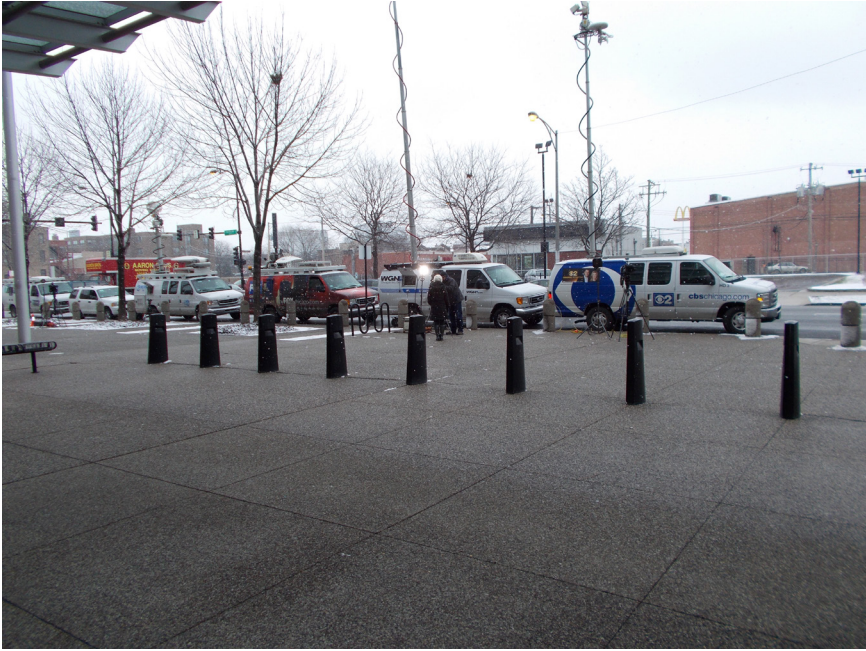
FIGURE 23. Chicago's 500th homicide of the year.

the year. Tinybig took the photograph because "it's interesting how some features or events show up on the news and some don't . . . Like a lot of times in the Black community . . . or even [the] Hispanic community, it may not come across the news where somebody died of an overdose, of a bad heroin purchase. But in the suburbs, it may." Tinybig explained this uneven news coverage reflected the way society devalued the lives of people of color. If she had died while on the streets, she said, "it may not be broadcast, but because it might be a political figure's daughter, a judge's daughter, an attorney's daughter, it's all over the news." Similar to Olivia's analysis, Tinybig recognized certain lives mattered more than others and how this social reality played out in the criminal legal system.