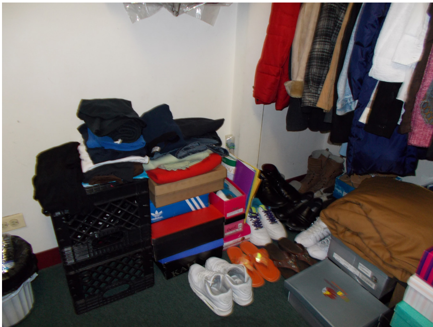
FIGURE 17. “Trying to live like a person’s supposed to live”.