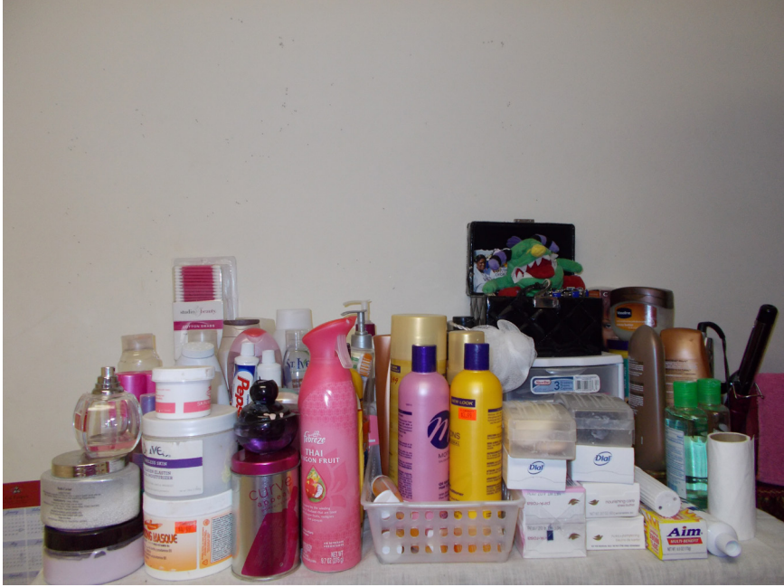
FIGURE 12. Personal hygiene items (Photo credit: the Lioness).

Taking control of one's appearance was a way for women to communicate personal transformation and to accomplish femininity. The Lioness, a 49-year-old African American woman, also took pride in her new appearance, sharing a photograph of her personal hygiene items to illustrate how important it was that she took care of herself (figure 12). The photograph showed how the Lioness was different from the woman she used to be, when she would stay out overnight getting high at unfamiliar places and would be without any personal hygiene items in the morning. She recalled a specific incident when she had stolen soap, toothpaste, and deodorant from a store. The man working behind the counter confronted her outside. She explained: