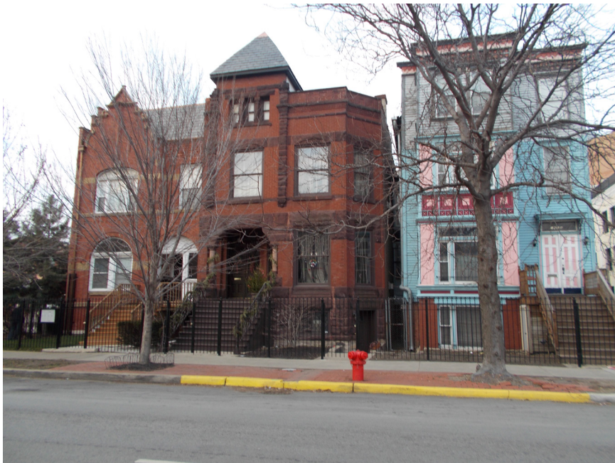
FIGURE 20. “I can’t wait to get my own place”.

home to their mom’s house, you know, bring their friend over, “This my mom!” You know what I’m sayin’? So that’s a beautiful thing. I can’t wait for that, to cook for them.