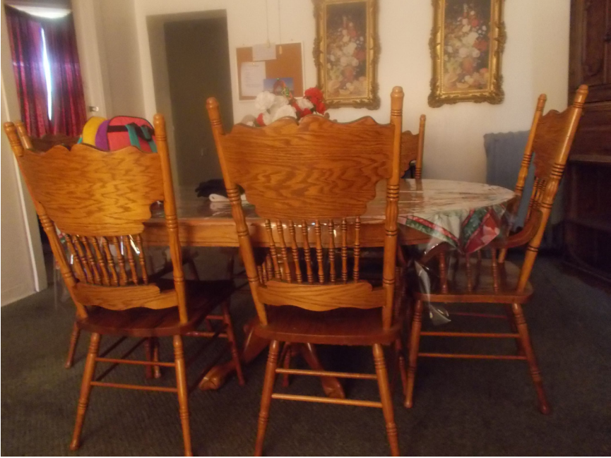
FIGURE 16. “One day I’ll be at my own table with my family”.

point out the issues and resolve ‘em. . . Just one day I’m a have the same house. I’m a be at the same house with my [children] at my table.