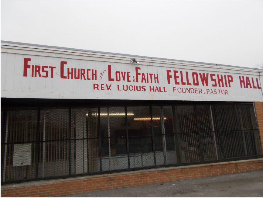
FIGURE 13. “My first job”.