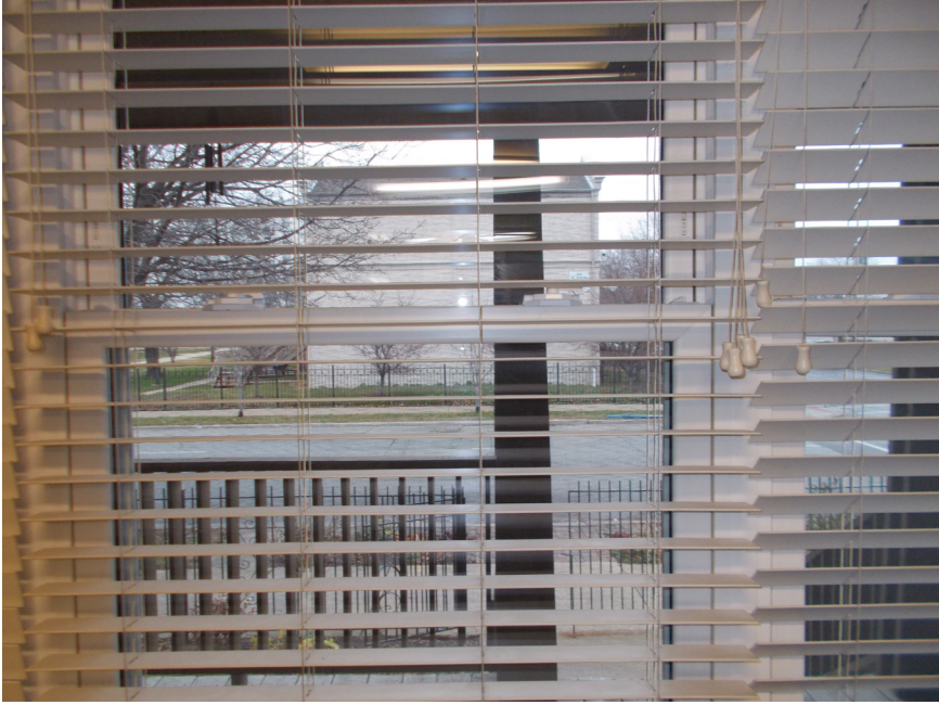
FIGURE 21. Ella's window (Photo credit: Ella).

Looking out that window so many days, so close but yet so far away. Well, not today. Because I'm finally looking and seeing from the other way. Appreciate and celebrating just being free. The window that I used to look from and see was when I was in the penitentiary. Now that I'm free, it's really made a big difference for me. I thought that I appreciated the gift of life, right? Nope. Wrong. I appreciated being able to smell the flowers, the grass, and looking at the trees. Being able to open up a window or a door or going to the store. In the penitentiary, it's called commissary. And it's only done once a week. That's if you have money and you fill out a commissary sheet. Today I can truly say that I'm grateful for whatever comes my way. If it's a bad or a good day, it's ok, because I'm out here living and not locked up in a way.