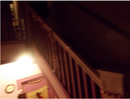
FIGURE 7. Climbing the ladder.

having the conscience that I have now, I would do it . . . If I could smoke weed without worrying about getting dropped out of nowhere, I probably would do it. You know, but I'm more grown up now." Her final comment here was instructive: New Life clarified she was stronger today. She had grown up and had a different conscience. She felt confident she could handle the freedom today, but on the night she had contemplated leaving, she would not have been able. As the pseudonym she chose for this project suggests, she was a new person, one who was moral, spiritual, law-abiding, and sober.