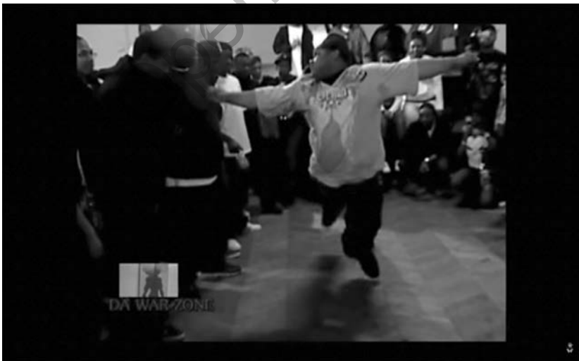
Figure 4 Dancer at Da War Zone battle.

These dual possibilities point back to my earlier arguments on the status of black hood dance. While Naomi Bragin's conceptualization of black hood dance as social thought was useful as a starting point, her conceptualization of this type of black performance has its limits. Exposing the uncritical 'celebration discourse,' which seeks to elevate black hood dance as a simple affirmation of black life 'under conditions of disappearance and death' without ever attending to the realities of 'everyday police terror,' Bragin argues such styles exemplify the way in which black performance reconstitutes the vastness of the crime that was racial slavery without ever transforming it. 63 Black hood dance, according to Bragin, operating under