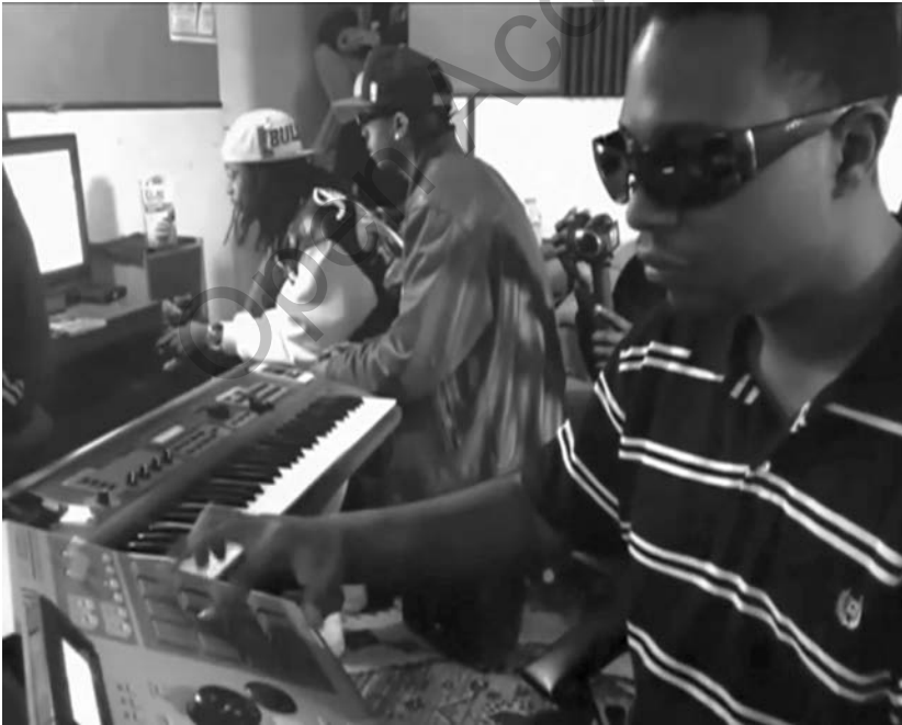
Figure 2 DJ Rashad's fingers 'dance' on the pads of an Akai MPC 2000XL as he produces a track.

The Footwork battle circle is formed within what is externally deemed to be restricted terrain. Such external constraints are the function of racial pressures that are manifested through the state and civil society's lethal political, economic, and geographic governance. These forces combine to externally designate the city's South and West sides as ghettos, and therefore render them, from an external position, as pathological. As Drake and Cayton show us, duress has never been the defining internal feature of Chicago's South side, and this certainly applies to Footwork. Operating inside the multi-dimensional function of the cordon sanitaire, the battle circle becomes the site of production for what we could call a series of