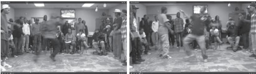
Figure 1 Dancers from Havoc (left) and Below Zero (right) compete at Battle Groundz.

Dancers make up their own routines on the floor, with their shuffling feet following the lower frequencies and their bodies popping to the claps. A good footwork