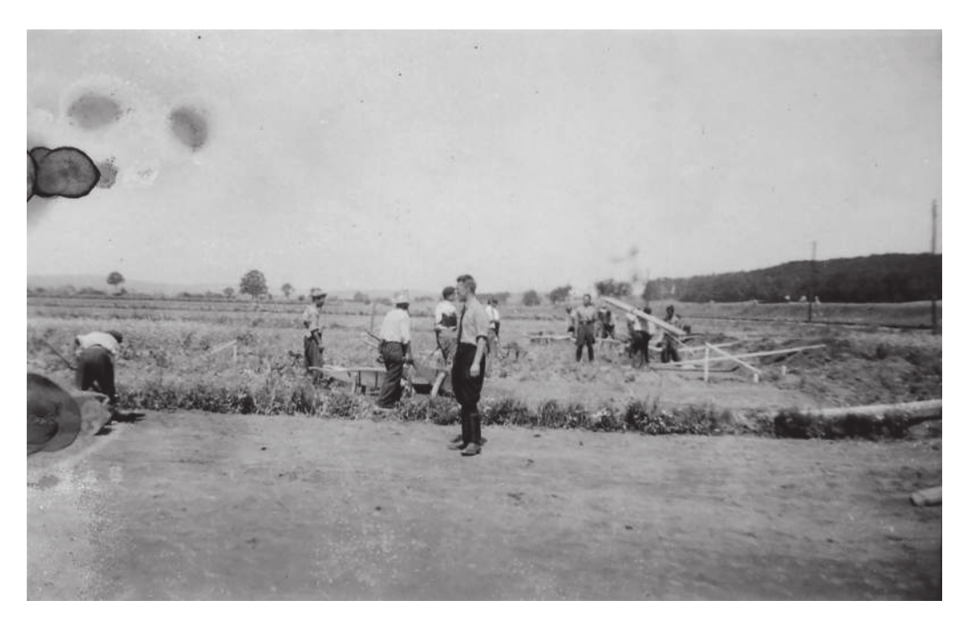
1.3. "Gypsies" at forced labor in Oberwart, Austria.