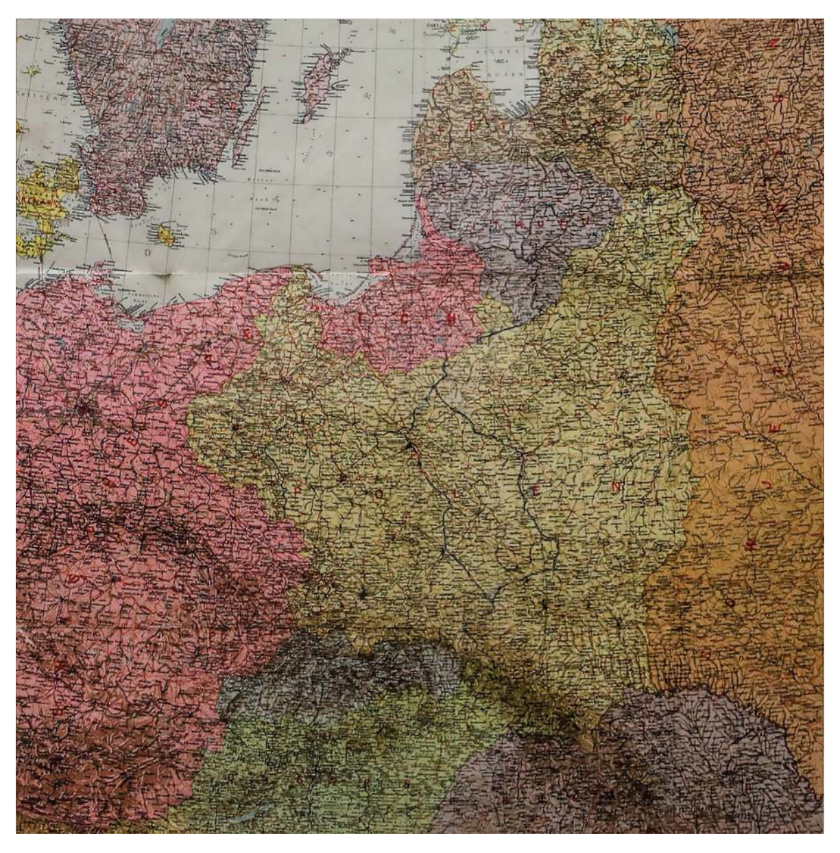
I.2. Map of western Germany, Poland, and western USSR in the 1930s. Source: Der Deutsche Osten und Polen, Maßstab 1:2000000 (Bielefeld: Verlag von Velhagen & Klafing, 1939).

that has traditionally been given to time and history on the one hand, and to social relations and society on the other." <sup>15</sup>