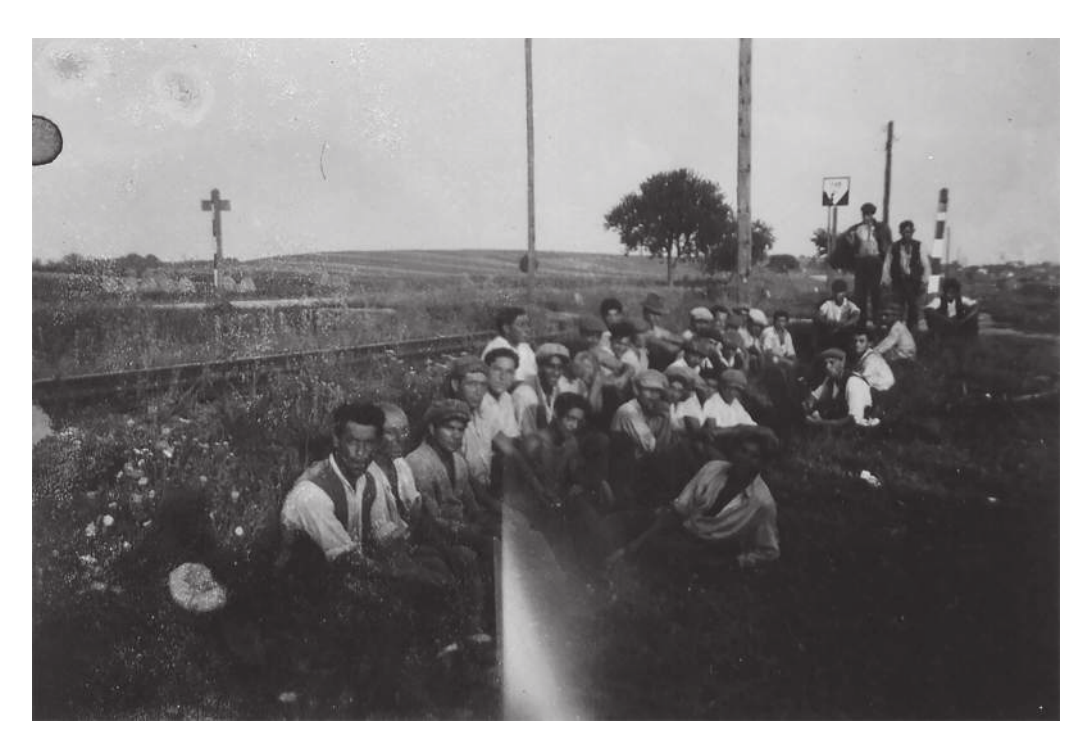
1.1. "Gypsies" at forced labor in Oberwart, Austria.