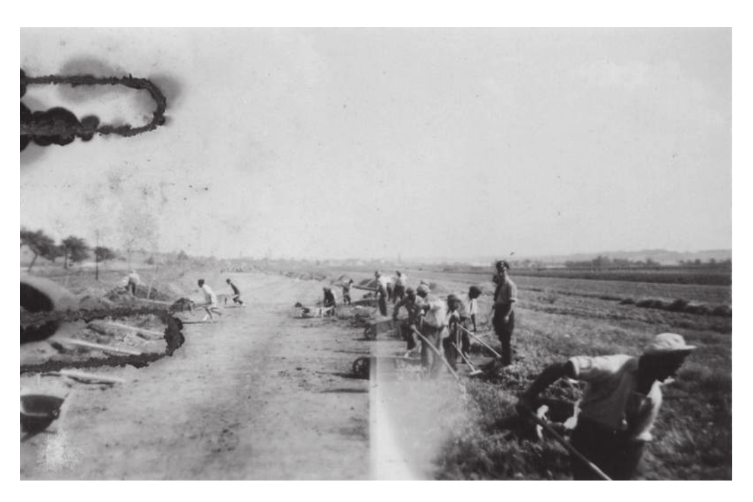
1.4. "Gypsies" at forced labor in Oberwart, Austria.