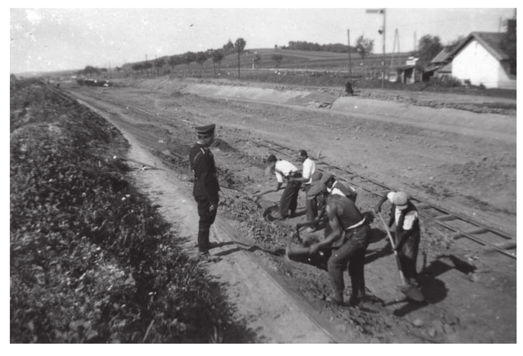
1.2. "Gypsies" at forced labor in Oberwart, Austria.