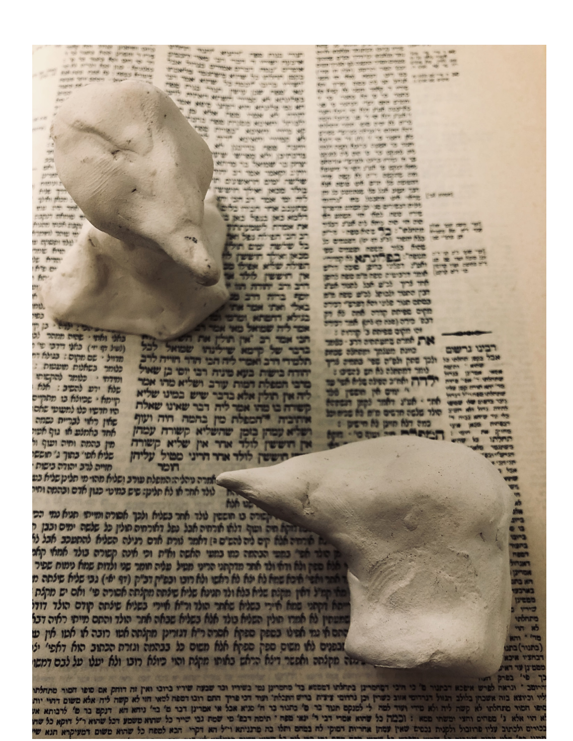
FIGURE 4. Rafael Rachel Neis, Birds Born of Humans. Mixed media, photograph, 7.5 in. × 10 in., 2020.