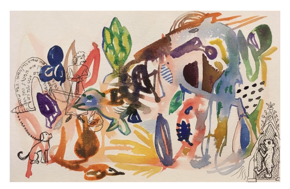
FIGURE 6. Rafael Rachel Neis, Canine Metathesis (Scribal Errors series). Mixed media on paper, 5.5 in. \times 5.5 in., 2018.

gendered and political ways in which knowers and known were entangled. Faced with the tenuous character of reproduction and even humanness, Babylonian scribes subsumed this knowledge within a generalized legibility and susceptibility of all phenomena to point to meaning beyond themselves, with the scribes as expert interpreters. For the rabbis, species variation is just one of the many things that falls under the assumed aegis of their expertise, along with all the other stuff that comes out of bodies: flesh, bone, semen, blood, and other liquids.