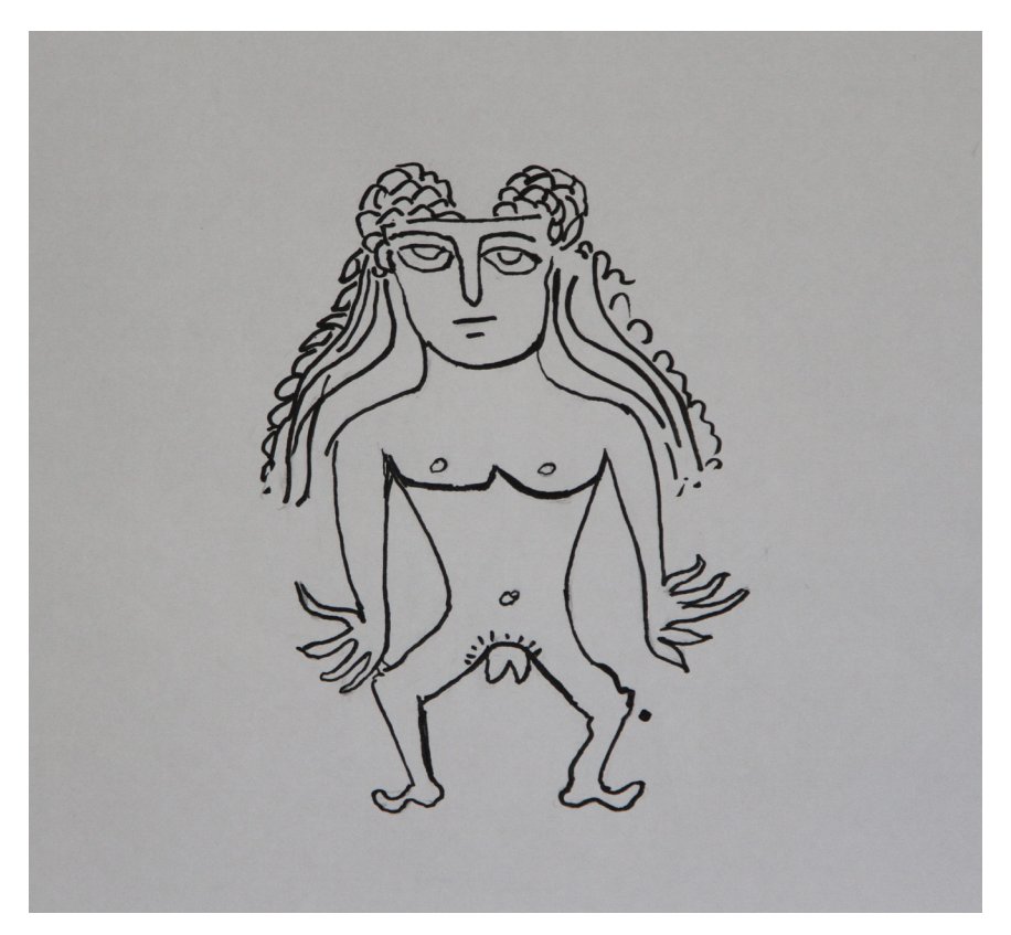
FIGURE 13. Rafael Rachel Neis, Lilith . Rendering of image in the interior of "Incantation Bowl Representing the Demon Lilith," Musée des Explorations du Monde, Cannes.

genders (men, women, "eunuchs," divinities) from Sasanian coinage, seals, and silverwork.<sup>150</sup> Wide, squared shoulders top a torso that narrows to the hips. An uneven line extends all the way from one edge of the chest to the other, dipping upward in the center. Extending from the left of the torso, this line forms a square base, as if following the pectoral muscle. On the right, the line forms a gentle curve, as if outlining the base of the breast tissue. Atop this are two small circles, indicating nipples; below, the navel is outlined. The demon stands in a powerful frontal pose, long arms by their sides, hands open with flared elongated fingers.<sup>151</sup> Their torso looms large, joining their smaller hips and their shorter, solidly planted legs that turn outward and bend in a slight squat. The feet are bare, with high arches. Between the legs are prominent, protuberant genitalia (vulva or perhaps testicles or a double phallus); above is a semicircular row of small lines depicting pubic hair (not vagina dentata, as Bohak suggests).<sup>152</sup> From a perspective that does not assume cisness as transhistorical and normative, this being's sexgender