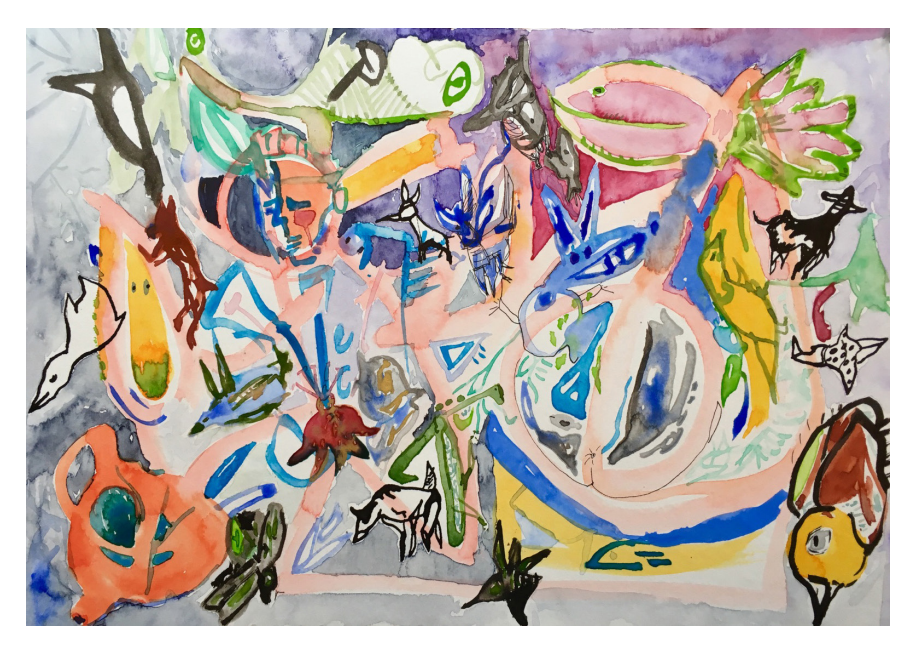
FIGURE 5. Rafael Rachel Neis, Becoming Flora, Becoming Fauna . Mixed media on paper, 9 \text{ in.} \times 12 \text{ in.} , 2018.

nonhuman (and likely even not assimilable as any species) and nonkin, their body does not even register as a corpse.