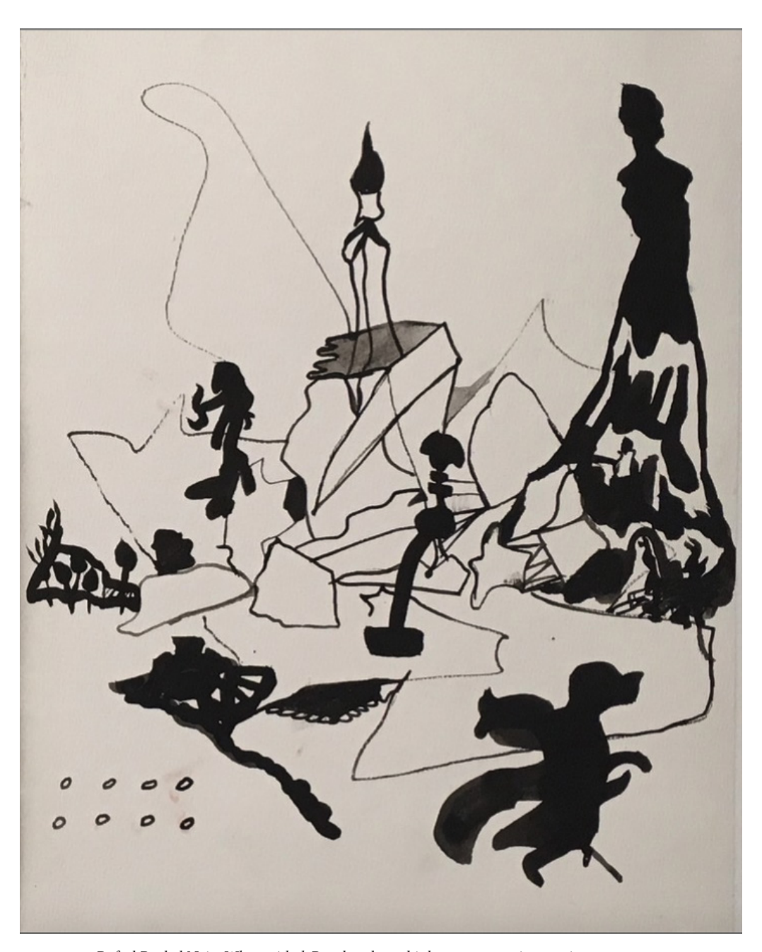
FIGURE 2. Rafael Rachel Neis, Wherewithal . Pen, brush, and ink on paper, 12 in. \times 16 in., 2004.