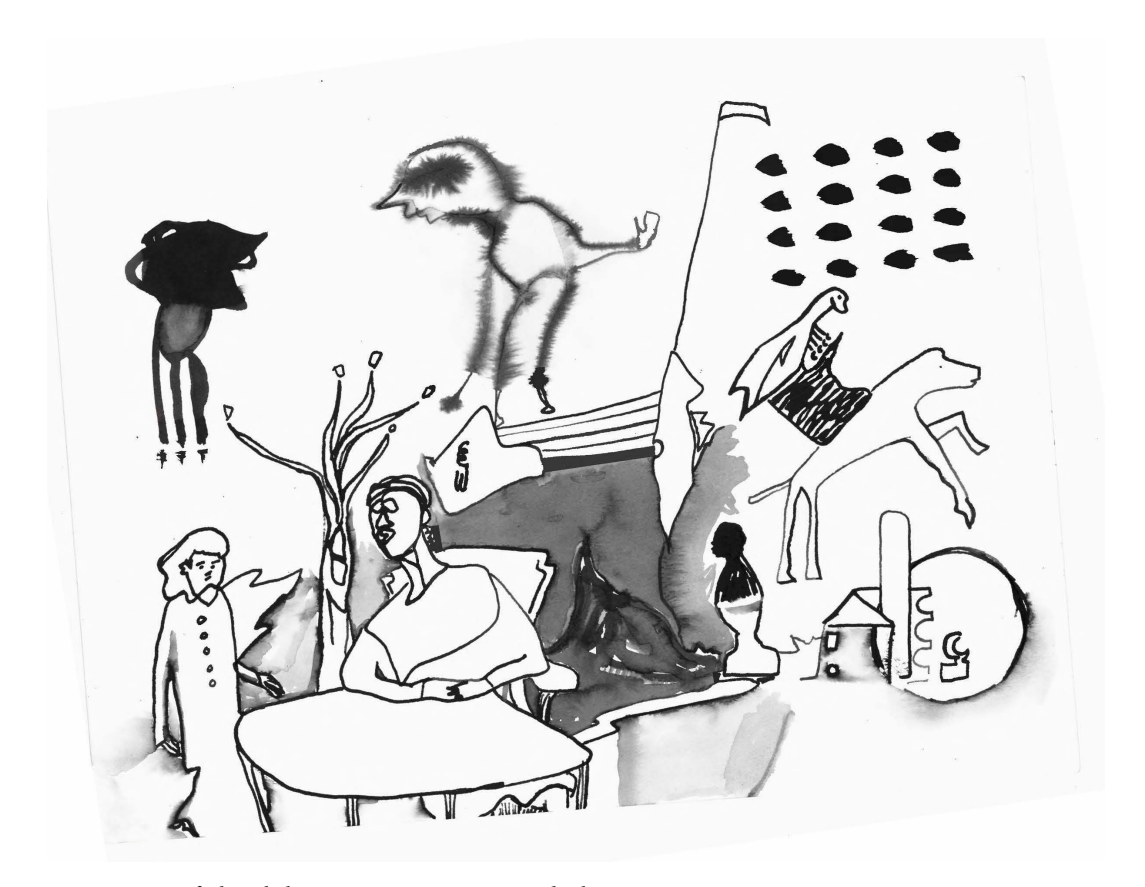
FIGURE 15. Rafael Rachel Neis, Perseverations . Pen and ink on paper, 9.5 in. \times 12.5 in., 2010.