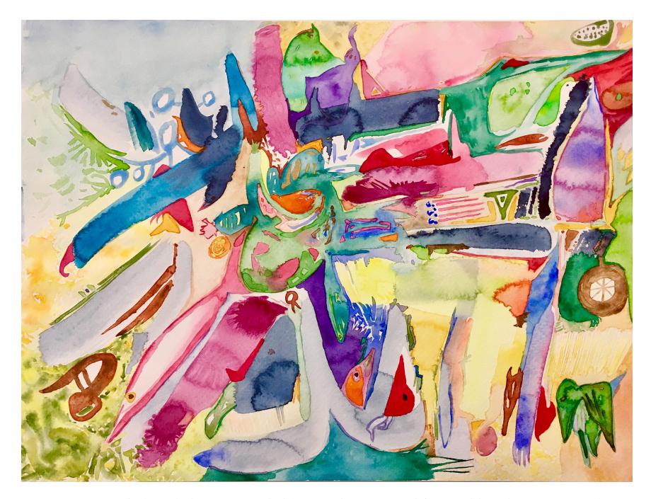
FIGURE 10. Rafael Rachel Neis, Untitled (or, Modest Proposal for World Making) . Watercolor and on paper, 9.5^{\circ} × 12.5^{\circ} . 2019.

It bears reiterating that the expanded generation principle powerfully forecloses the possibility that creatures like the siren are offspring of cross-species unions. They are not hybrids. Rather, and in accordance with the territoriality theory, they are each a sui generis likeness, or double, without any genealogical or reproductive relation to the earth-settled human. With humanlike creatures in particular—the siren and the field human—we encounter the troubling thought that humans, despite their vaunted legibility and singularity as images of God, are not so unique after all. We now turn to how this kind of doubling concords with our earlier observations about Kilayim's flattened zoological map and lack of heavens or deity.