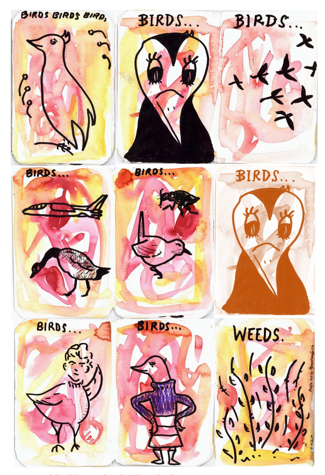
FIGURE 8. Rafael Rachel Neis, Birds, Birds, Birds. Mixed media, 2020.