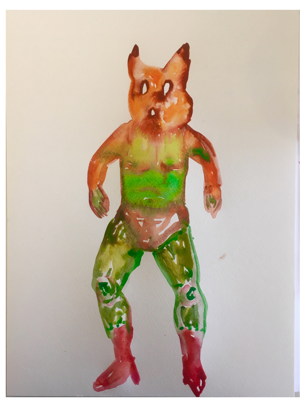
FIGURE 3. Rafael Rachel Neis, Personage . Watercolor on paper, 8.5 in. \times 12.6 in., 2019.