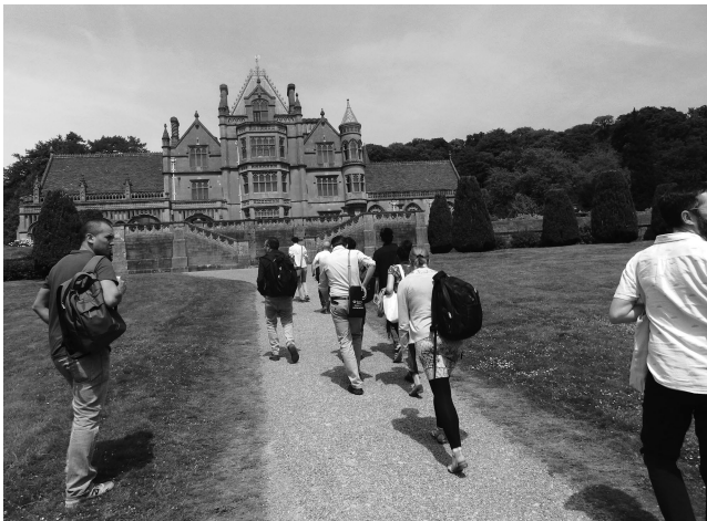
Figure 0.1 A snapshot of the research visit that preceded the public event on 23 June 2018 (photo by the author taken by courtesy of NT-Tyntesfield).

Conversations around ways of thinking about the British Isles vis-à-vis the global Hispanic world continued through our online platform