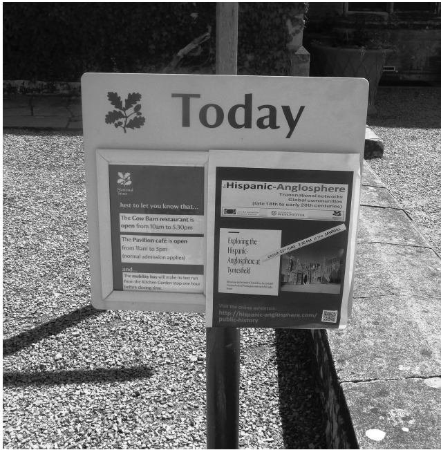
Figure 0.2 A poster announcing the launch of the online exhibition ‘Exploring the Hispanic-Anglosphere’.