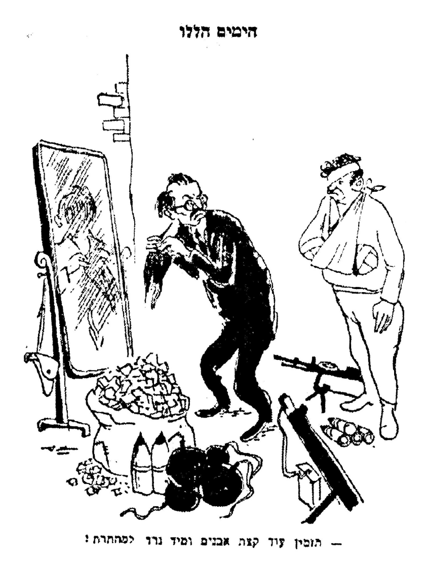
Figure 8.7: "Order another few stones and we shall immediately go underground!" In the caricature the image of Menachem Begin, the leader of the right-wing Herut movement, appears alongside weapons and a pile of stones. This caricature signifies criticism of Begin for the violent mass rally, which his movement held opposite the Israeli parliament on January 7, 1952. Ha'aretz , January 11, 1952. (Courtesy of the Ha'aretz daily and the heirs of the caricaturist Joseph M. Bass: Yona Shpigelman, Yael Hean, and Rephael Bass).