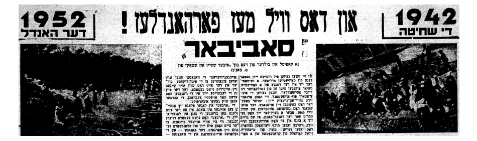
Figure 10.5: "On this [matter] they want to conduct negotiations! Sobibor: 1942 – the slaughter; 1952 – The deal." Letzte Nayes , March 28, 1952.

Figure 10.4: "The disgraceful negotiations between the government's representatives and the Nazi murderers have begun." Kol Ha-Am , March 21, 1952.