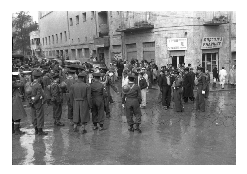
Figure 8.14:

The preparations of the Israel Police for the mass rally of the Herut movement in Jerusalem on January 7, 1952