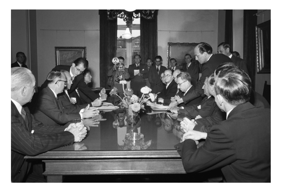
Figure 10.15: Israel's Foreign Minister Moshe Sharett (seated centre right) and West German's Chancellor Konrad Adenauer (seated centre left) sign the Reparations Agreement. September 10, 1952.