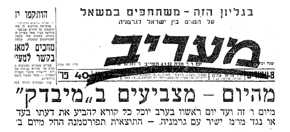
Figure 8.10: Main headline: "Starting from today – participating in the 'referendum'." Subtitle: "From this Friday and until Sunday evening, every reader will be able to express his opinion in favor of or against direct negotiations with Germany. The results will be published starting from Monday." Ma'ariv , January 4, 1952.