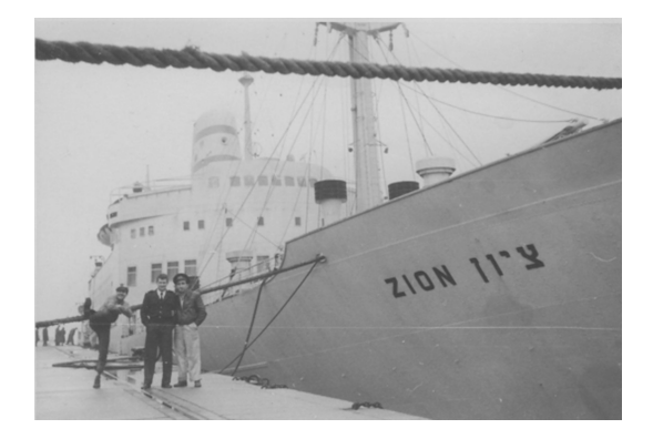
Figure 12.2: "S.S. Zion" – a cargo and passenger ship weighing 7,000 tons, launched in July 1955. Purchased for Zim, the Israeli national shipping company. (Courtesy of the Zim archive).

Figure 12.1: "M.S. Palmach" – a cargo ship weighing 2,200 tons, launched in December 1956. Purchased for a private Israeli shipping company. (Courtesy of the Zim archive).