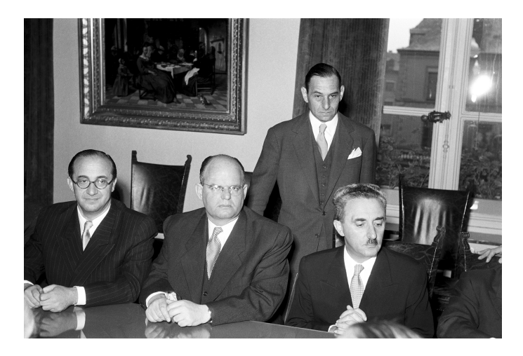
Figure 10.14: Israel's Foreign Minister Moshe Sharett (right), with the heads of the Israeli delegation to Wassenaar, Felix Shinnar (left) and Giora Josephthal (2nd from left), during the signing of the Reparations Agreement. September 10, 1952.