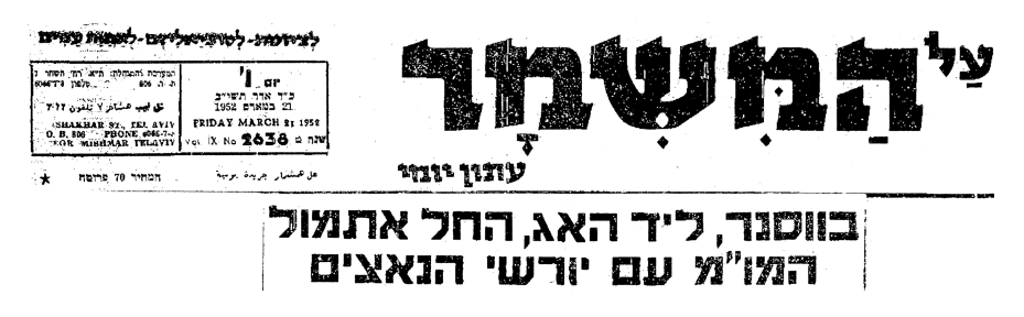
Figure 10.2: "In Wassenaar, near The Hague, negotiations began yesterday with the heirs of the Nazis." Al Ha-Mishmar , March 21, 1952.

Figure 10.1: "Citizens of Tel Aviv-Yaffo, come in your thousands to a protest rally against the negotiations with the Nazis." Kol Ha-Am , March 16, 1952.