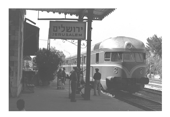
Figure 12.3: A railcar, purchased for Israel Railways. Entered service in early 1956.

Figure 12.2: "S.S. Zion" – a cargo and passenger ship weighing 7,000 tons, launched in July 1955. Purchased for Zim, the Israeli national shipping company.