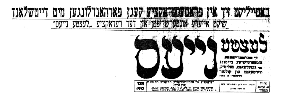
Figure 8.11: "Participate in the protest activities against negotiations with Germany – send your signatures to the newspaper's editorial office." Letzte Nayes , November 4, 1951. (Courtesy of the Moshe Sharett Israel Labor Party Archive – Berl Katznelson Foundation).

Figure 8.10: Main headline: "Starting from today – participating in the 'referendum'." Subtitle: "From this Friday and until Sunday evening, every reader will be able to express his opinion in favor of or against direct negotiations with Germany. The results will be published starting from Monday." Ma'ariv , January 4, 1952. (Courtesy of the Ma'ariv daily).