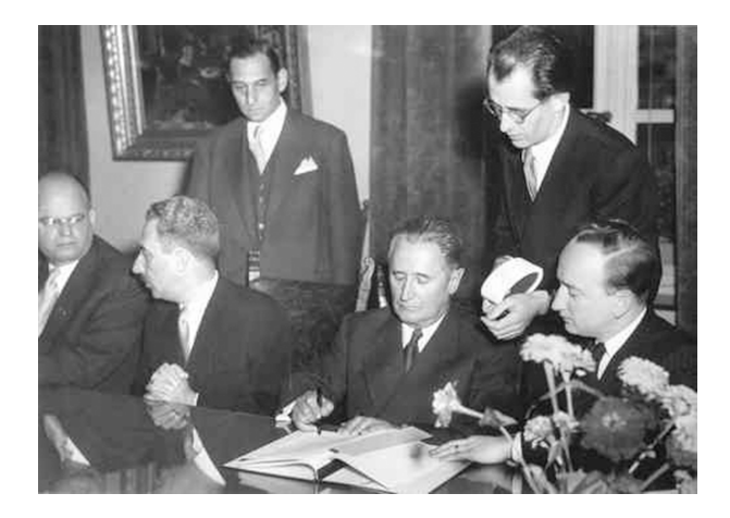
Figure 10.16: President of the Claims Conference Nachum Goldmann sign protocols 1 and 2. September 10, 1952.