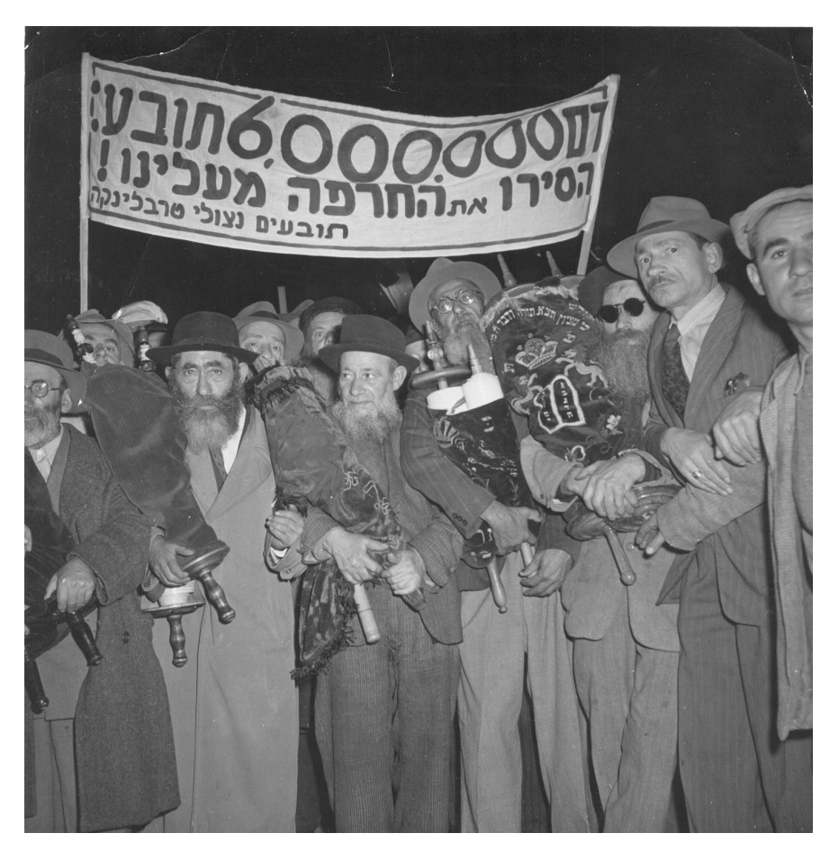
Figure 10.11: A demonstration of the Herut movement. Probably on January 7 or March 25, 1952.