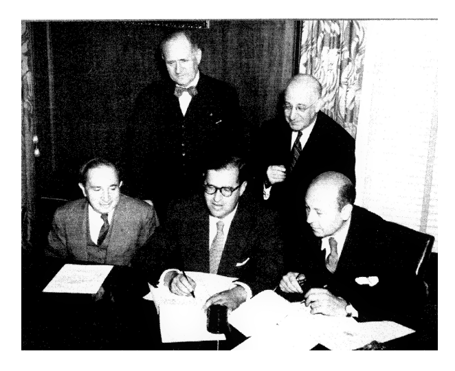
Figure 10.17: Israel's ambassador to the United States Abba Eban, together with representatives of the Claims Conference, sign the agreement for the distribution of the reparations' funds between the State of Israel and the Claims Conference. September 10, 1952. (From the book: 70 years of the Claims Conference, 1951–2021 ).

Figure 10.16: President of the Claims Conference Nachum Goldmann sign protocols 1 and 2. September 10, 1952. (Courtesy of the Moshe Sharett Heritage Society).