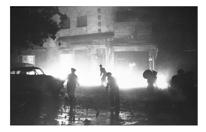
Figure 8.18:.