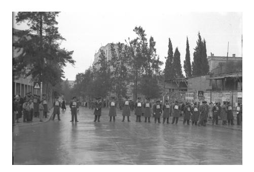
Figure 8.16: (Courtesy of the Meitar Collection, Pritzker Family National Photography Collection, National Library of Israel).

Figure 8.15: (Courtesy of the Meitar Collection, Pritzker Family National Photography Collection, National Library of Israel).