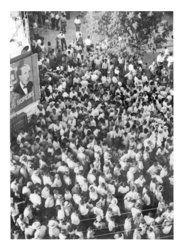
Figure 10.9: A demonstration of the Herut movement. Tel Aviv, April 19, 1952.