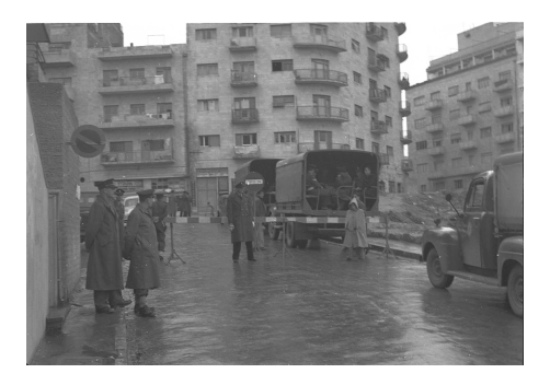
Figure 8.15: (Courtesy of the Meitar Collection, Pritzker Family National Photography Collection, National Library of Israel).

Figure 8.14: (Courtesy of the Meitar Collection, Pritzker Family National Photography Collection, National Library of Israel).