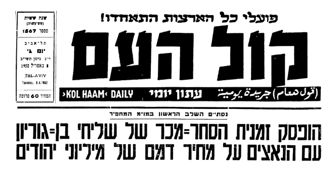
Figure 10.7: "The wheeling and dealing of Ben-Gurion's envoys with the Nazis over the price of the blood of millions of Jews has been temporarily halted." Kol Ha-Am , April 8, 1952.

Figure 10.6: Main headline: "The Israeli delegation at Wassenar is seeking an honorable way out." Subtitle: "The Germans obtained their goal: Recognition by the Jews, and now they refuse to commit [to paying reparations] and try to prolong the negotiations until they fade away." Herut , April 7, 1952.