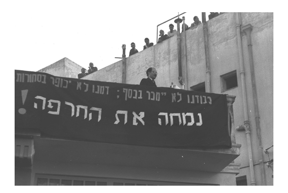
Figure 10.10: A demonstration of the Herut movement. Tel Aviv, March 25, 1952.

Figure 10.9: A demonstration of the Herut movement. Tel Aviv, April 19, 1952.