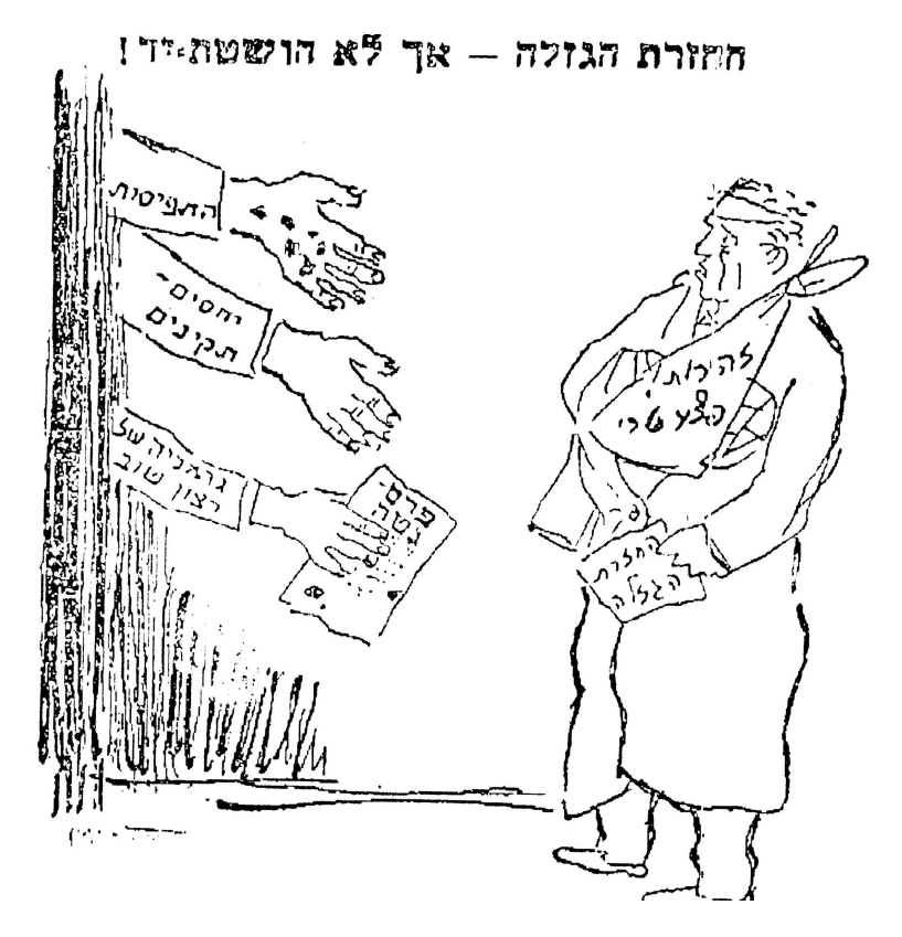
Figure 8.5: "Returning the plundered property – but not extending a hand!" In the caricature an image personifying the State of Israel is seen demanding reparations from Germany. German hands are extended towards it offering, among other things, "normal relations." According to the caption (and as Ben Gurion's government claimed the whole time), Israel will not agree to reconciliation. Davar , January 4, 1952.