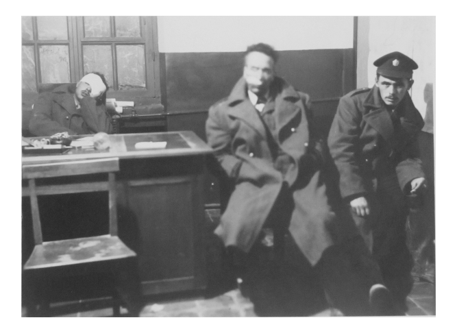
Figure 8.20: Police officers who were injured during the January 7th demonstration resting at the district police headquarters in Jerusalem. (Courtesy of the Israel Police Heritage Center).

Figure 8.19: Protest placards, which were seized by the police during the January 7th demonstration. The caricature on the drawn placard depicts West Germany's Chancellor Adenauer, with Hitler's image in the background, handing over reparations' payments to Israel's Prime Minister Ben Gurion. The German money is dripping with the blood of the Jewish Holocaust victims. Beneath this placard another protest sign appears with the following sentence written on it: "The bankrupt Mapai government – seeks to be saved with the shameful reparations". The third protest sign is a cloth cutting in the shape of a yellow patch. Below the badge the following caption appears: "Remember what Amalek did unto thee". (Courtesy of the Israel Police Heritage Center).