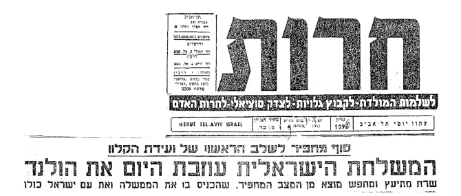
Figure 10.8: Main headline: "Shameful end to the first stage of the disgrace conference – the Israeli delegation leaves the Netherlands today." Subtitle: "Sharett consults and seeks a way out of the disgraceful situation into which he put the government and the entire people of Israel." Herut , April 9, 1952..

Figure 10.7: "The wheeling and dealing of Ben-Gurion's envoys with the Nazis over the price of the blood of millions of Jews has been temporarily halted." Kol Ha-Am , April 8, 1952..