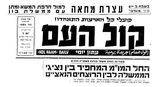
Figure 10.4: "The disgraceful negotiations between the government's representatives and the Nazi murderers have begun." Kol Ha-Am , March 21, 1952.