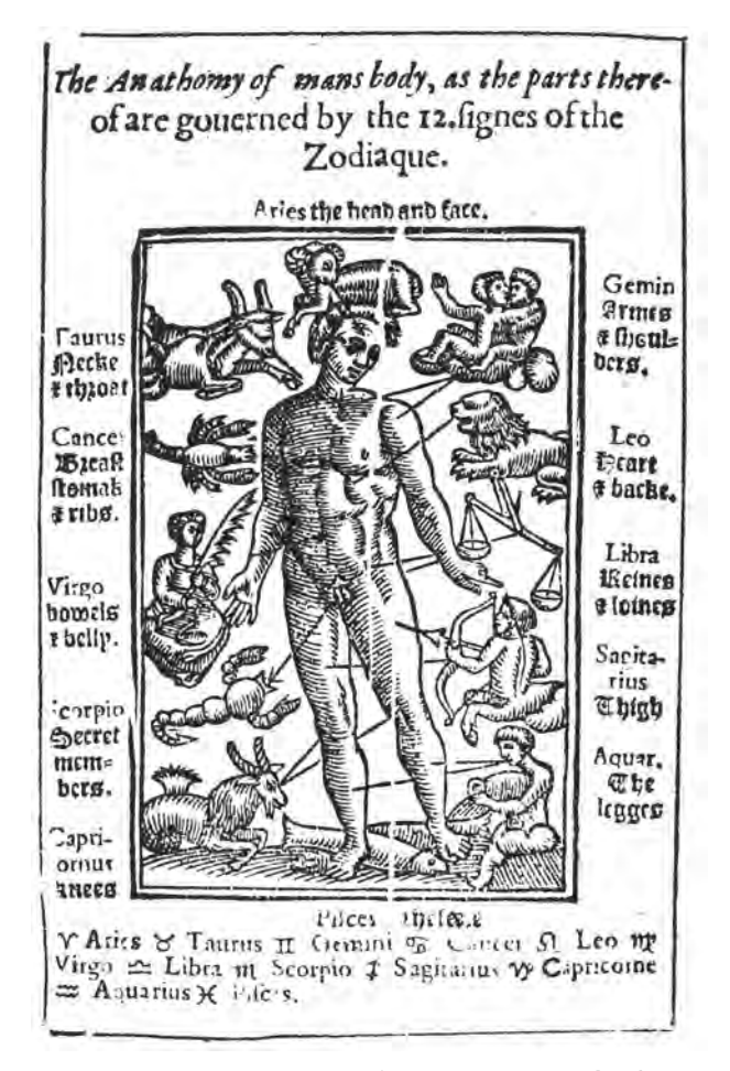
The zodiacal man, from Richard Allestree's Prognostication for this Present Year of Grace 1623 .

tupping your white ewe" (1.1.88–89), Iago has already initiated a network of allusions to the transformation of men into beasts (1.1.116; 2.3.256, 284, 297), horses (1.1.111–13), baboons (1.3.316), asses (1.3.400; 2.1.304), goats (3.3.184, 409; 4.1.259), toads (3.3.274), dogs (3.3.368; 5.1.62; 5.2.362), monkeys (3.3.409; 4.1.259), and wolves (3.3.410) that intersects with the zoologically transgressive nature of the centaur. The Sagittar/y also participates in yet another ominous complex of images, the most notable elements of which are the figuration of Iago's scheme against Othello as a "monstrous birth" (1.3.402), his warning that jeal-