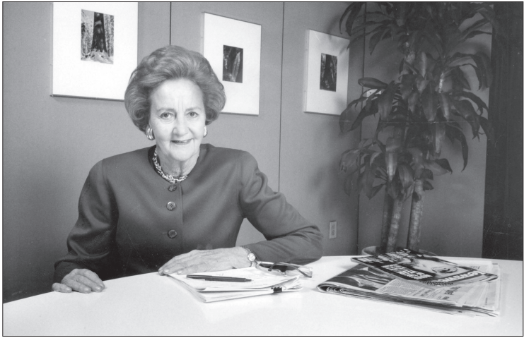
Figure 11. Katharine Graham sits at her desk as chairman of the board of the Washington Post Company, ca. 1980s