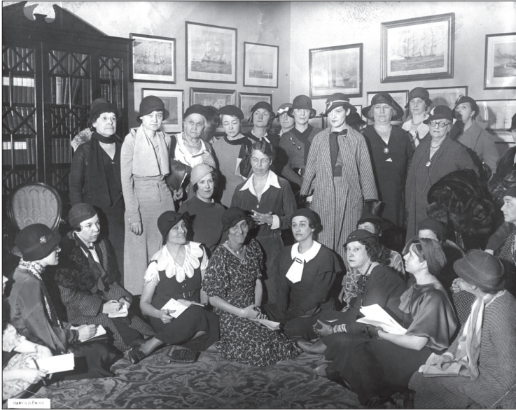
Figure 2. Eleanor Roosevelt holds one of the first of her 348 White House press conferences for women reporters only in the Monroe Room on March 13, 1933, with some of the press girls, as they were called, sitting at her feet FRANKLIN D. ROOSEVELT LIBRARY