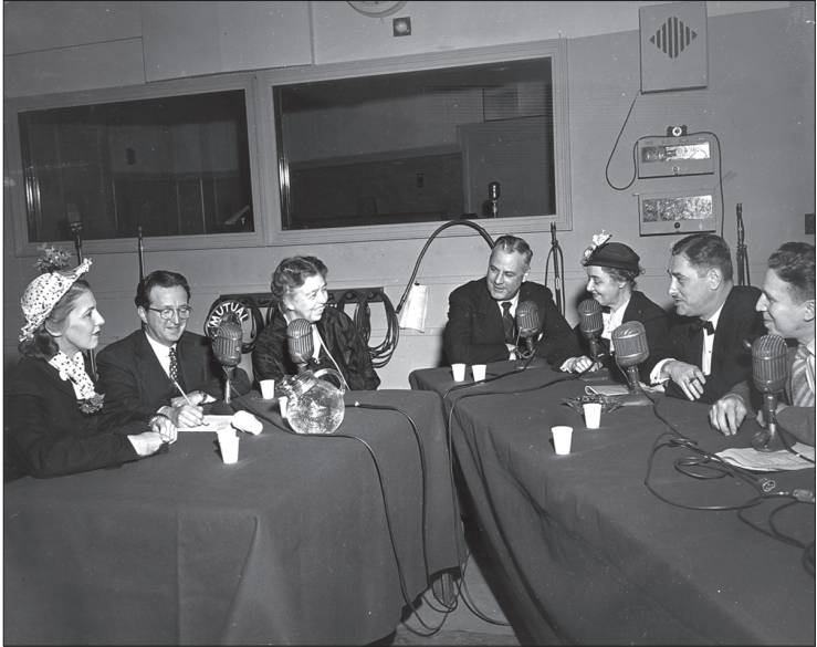
Figure 5. Martha Rountree ( far left), one of the founders of Meet the Press, returns to the radio program along with cofounder Lawrence Spivak ( second from left) on April 8, 1949, to interview Eleanor Roosevelt ( third from left)