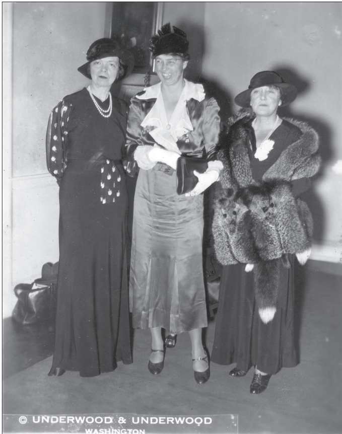
Figure 1. First Lady Eleanor Roosevelt ( center ), with Eleanor “Cissy” Patterson, editor and publisher of the Washington Herald ( left ), and popular author Mary Roberts Rinehart, opening a relief drive for victims of the Depression in 1933 in Washington