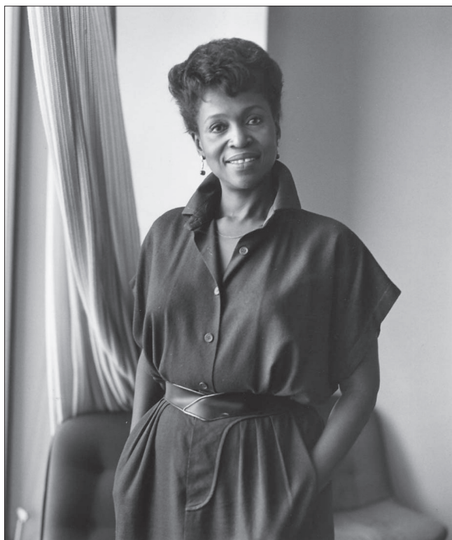
Figure 16. Dorothy Gilliam, the first African American woman reporter and columnist for the Washington Post , is portrayed by a Post photographer, ca. 2000