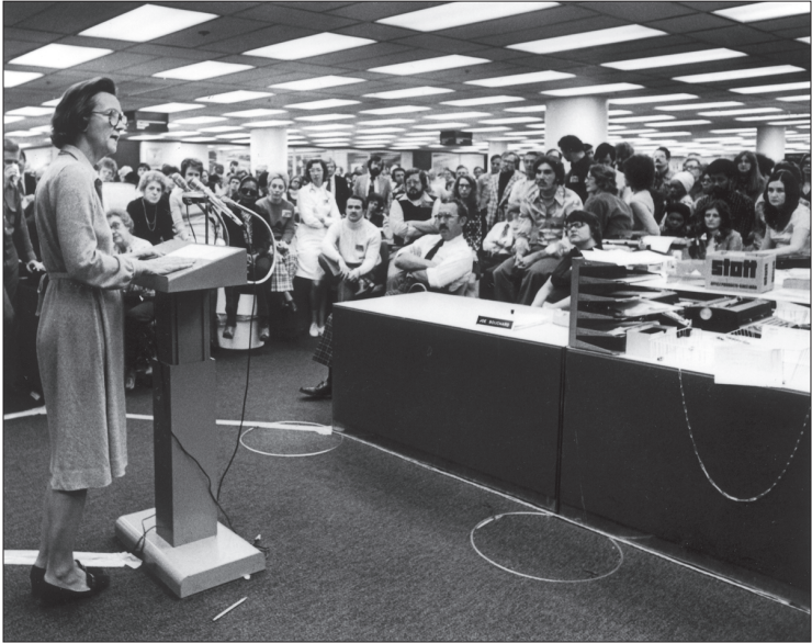
Figure 7. Katharine Graham addresses the staff in the Washington Post newsroom during the 1975 strike by union pressmen, which she is credited with breaking