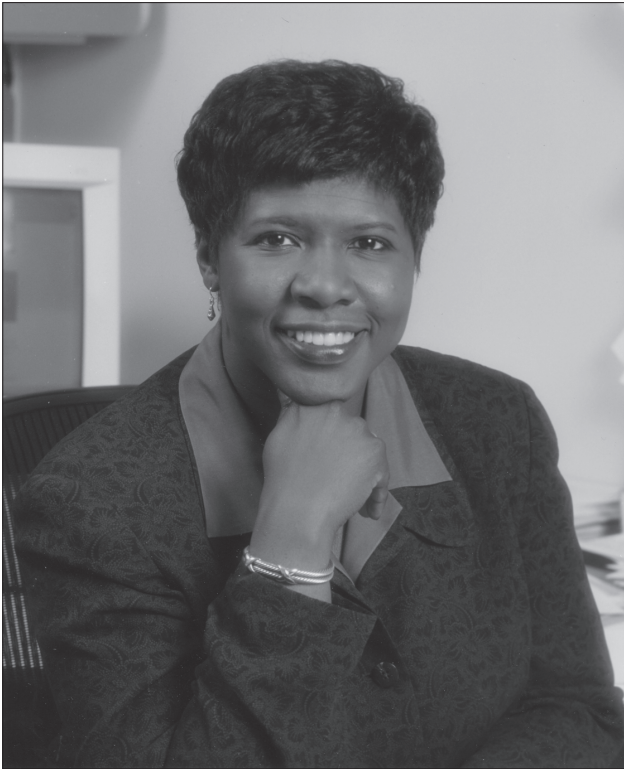
Figure 17. Gwen Ifill, current moderator and managing editor of PBS's Washington Week in Review