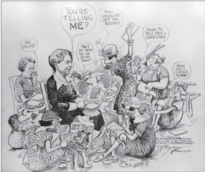
Figure 3. “You’re Telling Me,” a cartoon drawn by Clifford K. Berryman and printed March 19, 1934, in the Washington Star , presents a male view of Eleanor Roosevelt’s press conferences