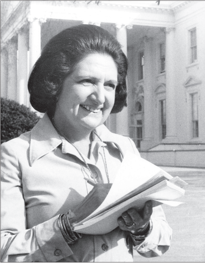
Figure 6. Helen Thomas of United Press International stands outside the White House taking notes, ca. 1970s