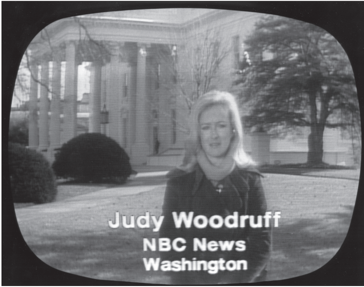
Figure 8. Judy Woodruff in November 1977 as an NBC news correspondent in Washington