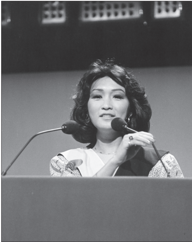
Figure 12. One of the first successful Asian American women in television broadcasting, Connie Chung started her network broadcasting career in 1971 as a CBS reporter in Washington. She is shown here in 1985, when she anchored NBC's early morning news program.