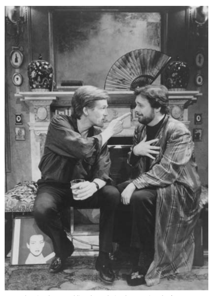
Stephen (Anthony Heald) and Mendy (Nathan Lane) in the first act of Manhattan Theatre Club's 1989 production of The Lisbon Traviata by Terrence McNally.