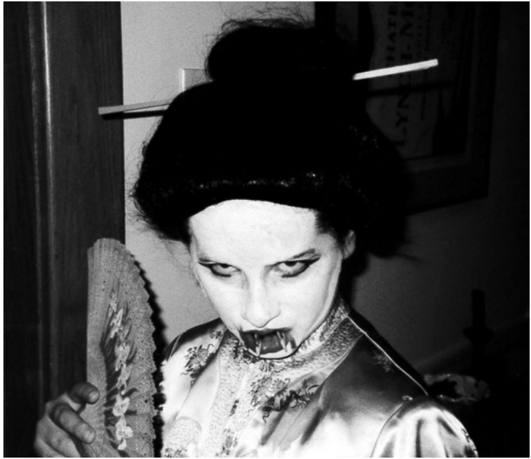
Vampire geisha, Halloween, 1999