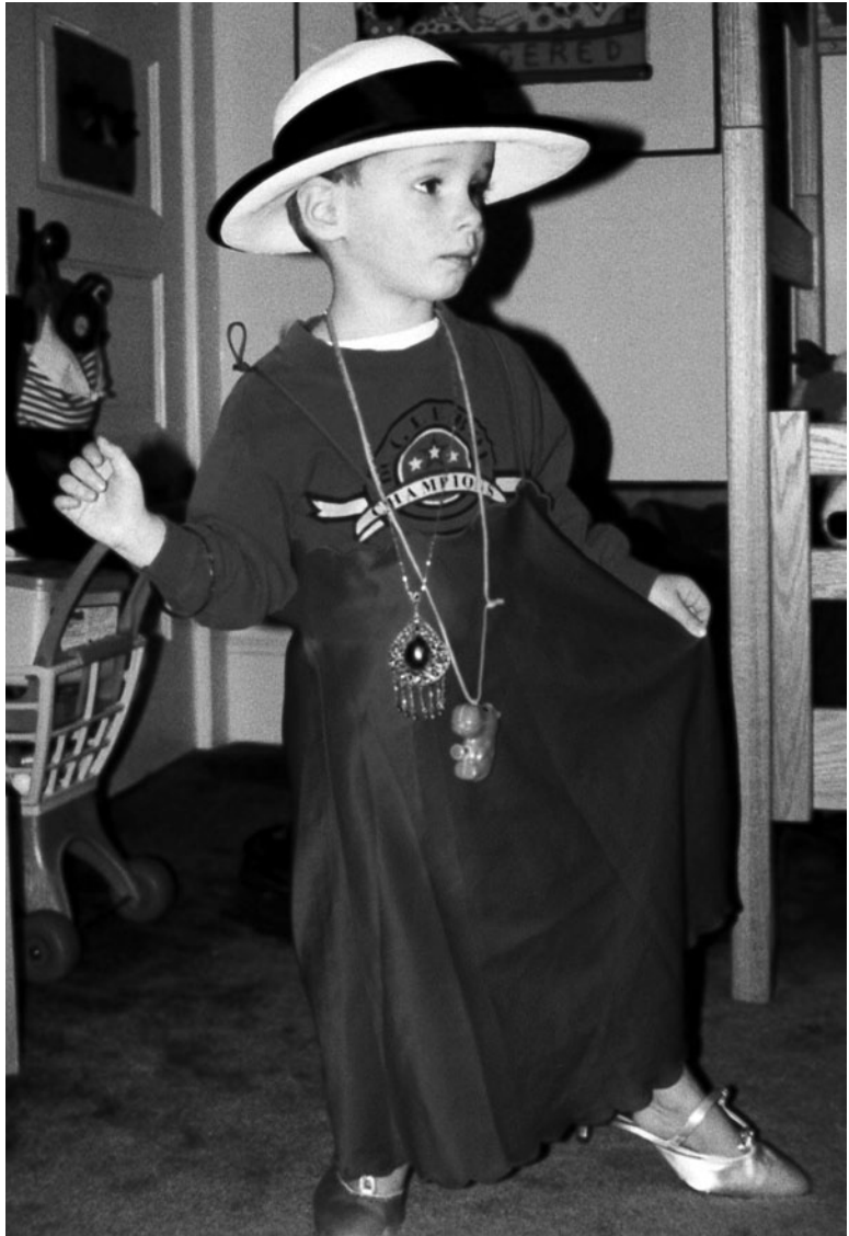
Striking a pose, 1994