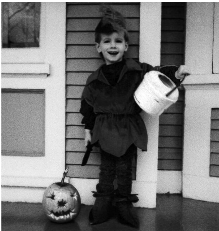
Before the Halloween block party, 1992