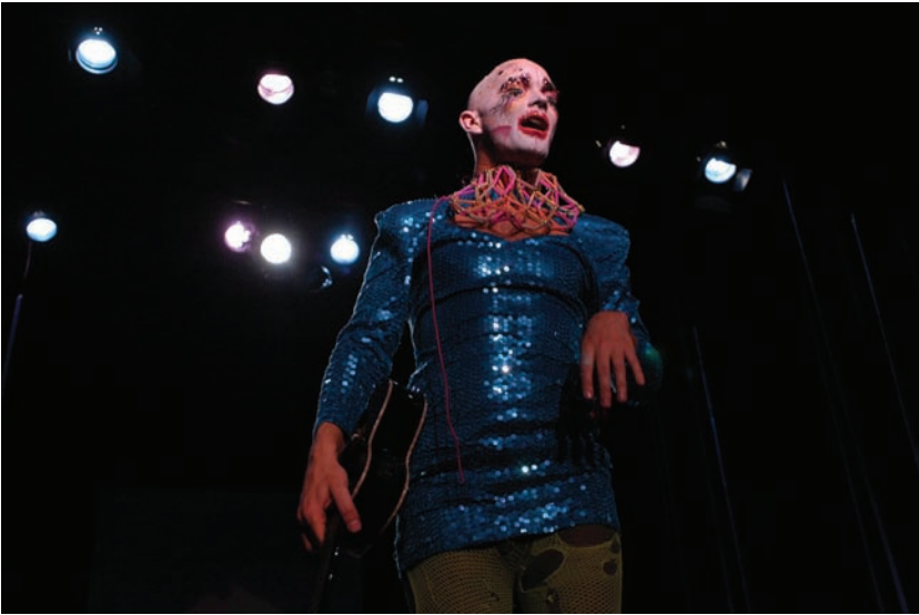
Figure 6: Taylor Mac in The Be(a)st of Taylor Mac (2008).

texts. It was the unique style of this Ridiculous aesthetic that inspired Mac to learn more about the playwrights and actors who originally introduced the genre. Mac generates his provocative approach to the Ridiculous genre by employing it as a tool for political satire and radical commentary. This chapter traces the queer genealogy between Ludlam and Mac as well as Mac's performative career through his development of a signature character, a "Pierrot figure for the modern age." 7 It attempts to unpack the tension between having one's own style while being part of a legacy, as well as the tension between the Ridiculous "style" and its political claims. Mac was initially drawn singularly to the aesthetic strategies and conventions of the Ludlamesque but extended his approach to the Ridiculous sensibility into a broader context that attempts to address all Americans in the paradigmatic search for national identity in the post-9/11 era.