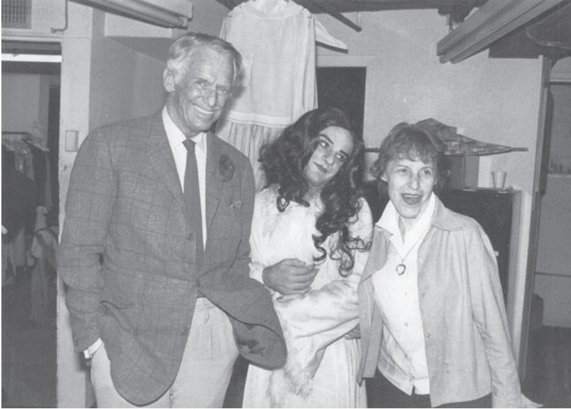
Figure 1: Charles Ludlam after a performance of Camille with Douglas Fairbanks Jr. and Lotte Lenya (c. 1976).

I longed to become a part of what I realized was a secret, elusive, and exclusive club—the Ridiculous tradition. I was even more surprised to find that so little scholarly work was available on Ludlam and his plays, but also understood how his work could be difficult to access and understand. Thus, my relationship with Ludlam required a certain queer approach to move through time critically, necessitating queer methods to figure out how my present might be linked to Ludlam's past.