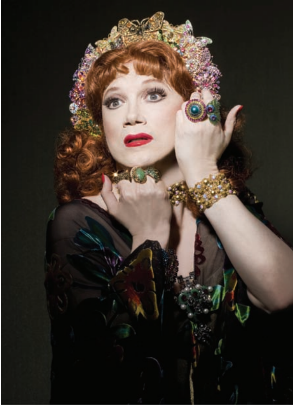
Figure 4: Charles Busch as Judith of Bethulia in the play of the same name (2012).

plays and films, including Die Mommie, Die! and The Tale of the Allergist's Wife , representative of the playwright's tendency to switch between plays loosely inspired either by old Hollywood glamor or by urban Jewish-American nostalgia.