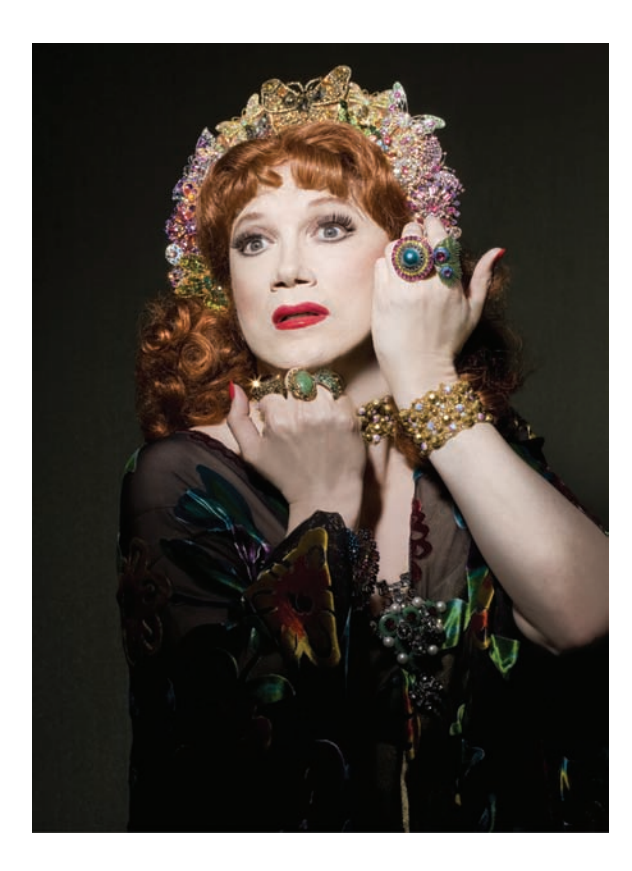
Figure 4: Charles Busch as Judith of Bethulia in the play of the same name (2012).

plays and films, including Die Mommie , Die! and The Tale of the Aller-gist's Wife , representative of the playwright's tendency to switch between plays loosely inspired either by old Hollywood glamor or by urban Jewish-American nostalgia.