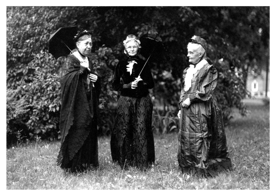
Figure 2. Alumnae at the LLS Centennial Jubilee, 1935.

past debating women so that generations of women—young, aging, and dead—occupied the same space, at least momentarily. It cultivates a feminist heritage for current students and sustains the alumnae who assembled to celebrate the club. The specific details of their experiences may differ, yet there is something familiar about the tales of the historical women who have struggled to reach the podium that can serve as an inventional resource. <sup>137</sup> Generations of Oberlin alumnae cherished their membership and made a concerted effort to safeguard the memory and ensure the longevity of the hallowed club.