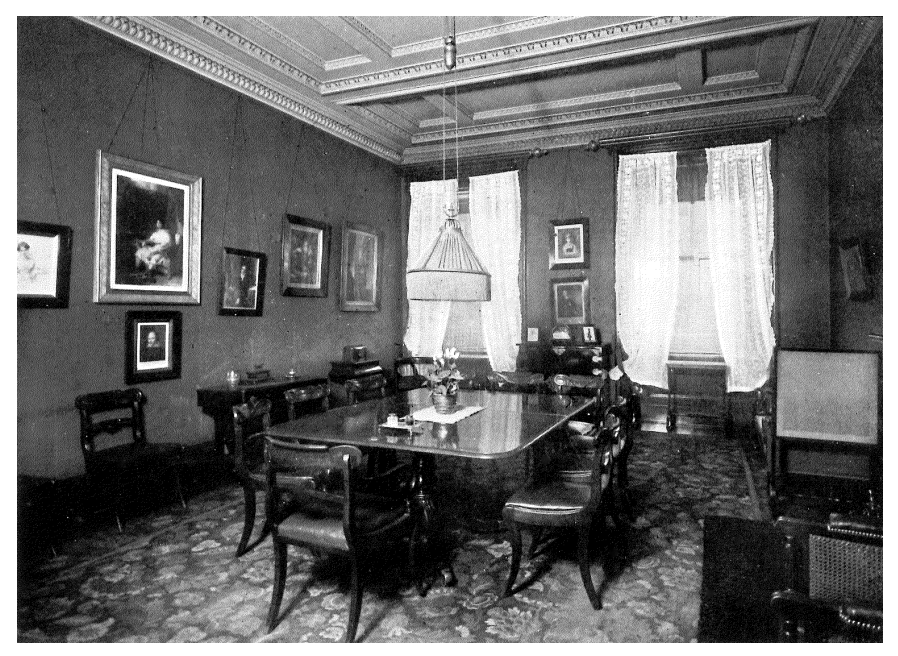
Figure 4. The Ladies' Edinburgh Debating Society's meeting place from 1871 to 1935.

a pedagogically oriented civic space—what they referred to as a "training school for women to fit them for public speaking of a high standard of excellence."<sup>52</sup> To do this in a home may have provided a sense of comfort, but it did not quell their lively and sometimes heated exchanges as they mulled over the rapidly changing cultural norms of their time.