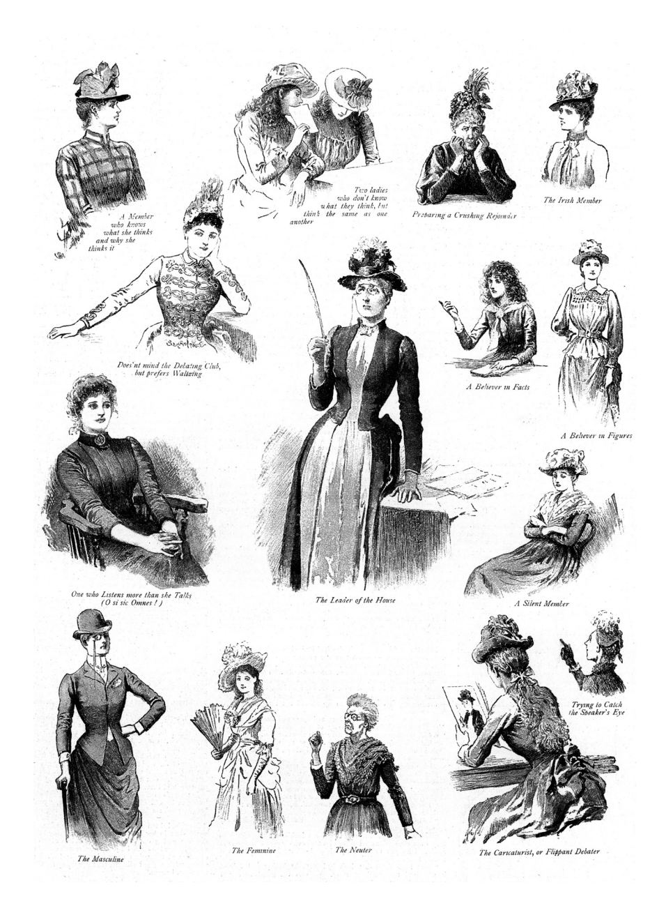
Figure 3. "Notes at a Ladies Debating Society," The Graphic , 1888.