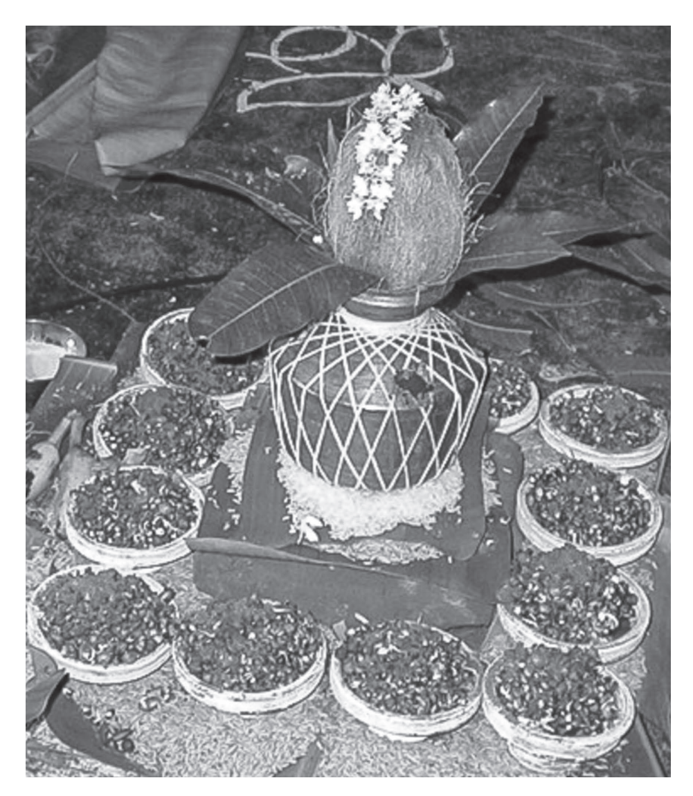
Figure 2.2 Śivakumbha prepared for a d\bar{k}s\bar{a} (initiation) in Cuddalore, India.