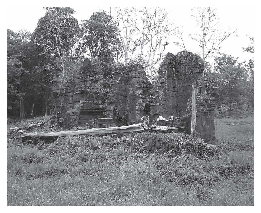
Figure 2.4 Prasat towers \sigma , \rho , \pi , and \tau in Preah Khan of Kompong Svay. View from the northeast.

the inscription is not 'unfinished' but that the contestation of the rights of the temple was the reason for erasing the lower part of this inscription (Pottier 2000, 23). Once again, it appears necessary for the epigraphist to study the medium before translating the text. Another famous example of this practice are the lists of dignitaries subordinate to Sūryavarman I in which several crossed-out names and passages clearly condemned to oblivion officials who failed to faithfully respect their oath ( cf. K. 292; 1011 CE; IC III, 205 ).