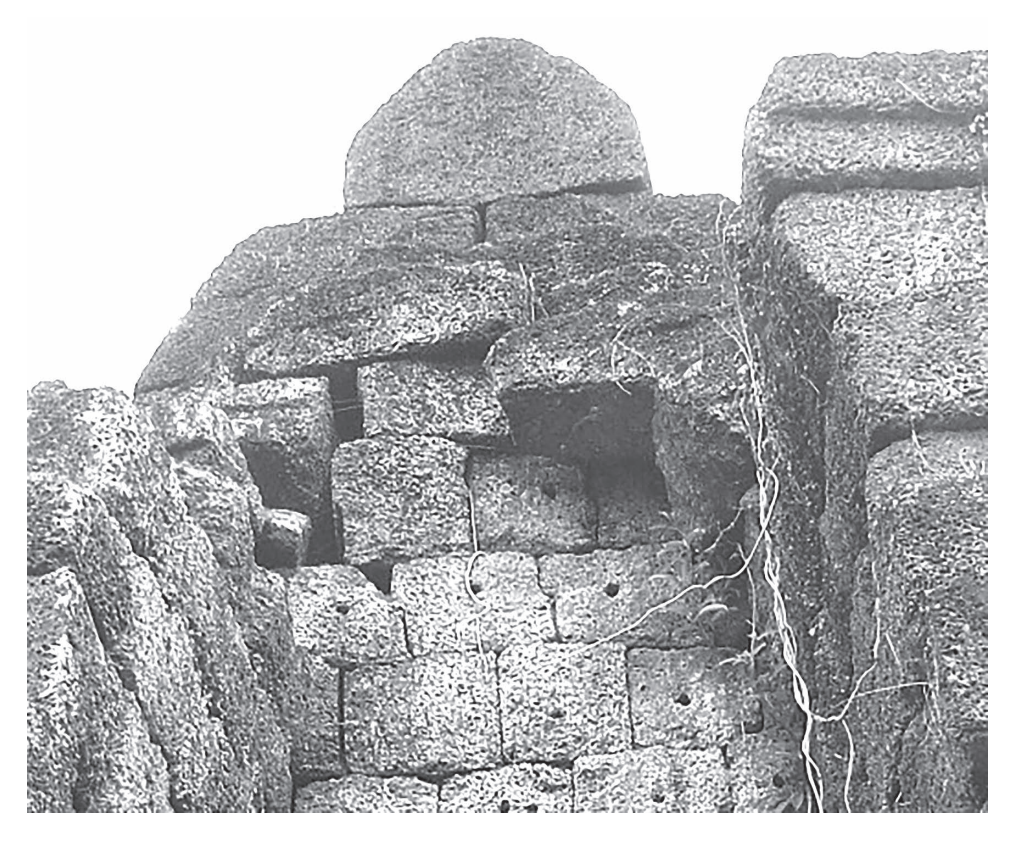
Figure 2.6 Detail of vertical 'bayonet-cut' joints in the corbelled vault from prasat tower \rho in Preah Khan of Kompong Svay.