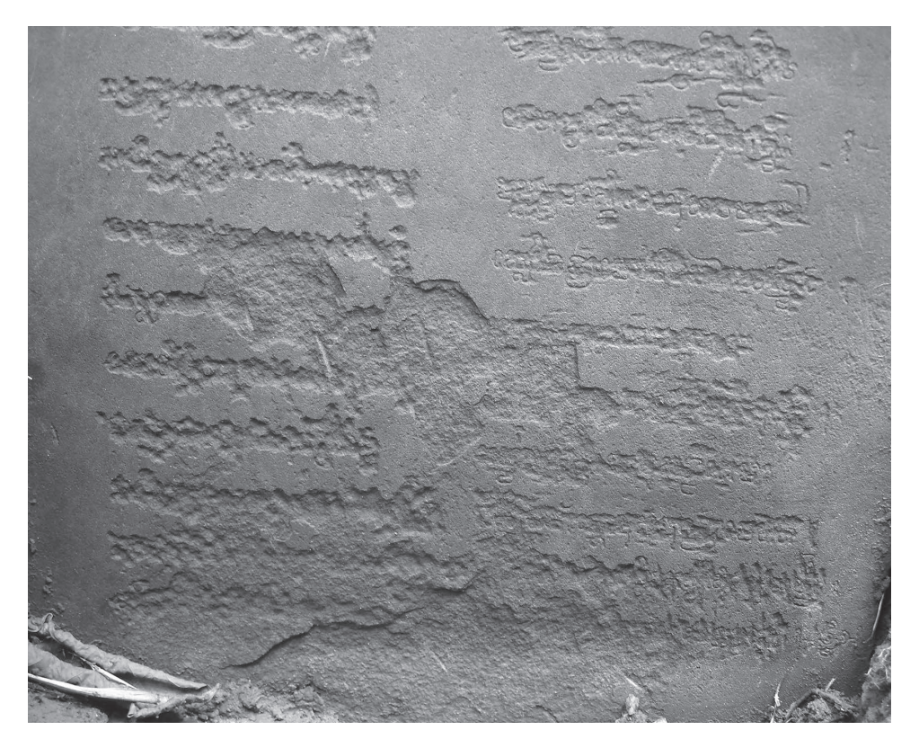
Figure 2.5 K. 1335, detail of the lower part of the southern door jamb.

evidence leads us to assume that Jayavīravarman, or one of his subordinates, dominated the Preah Khan of Kompong Svay area.