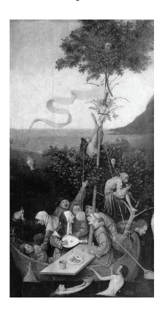
Fig. 1. Detail from Hieronymus Bosch, Ship of Fools (1490–1500)