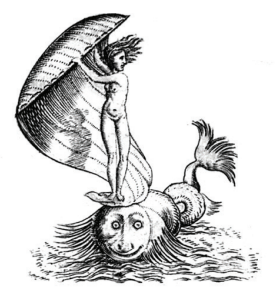
HIC SVNT MONSTRA