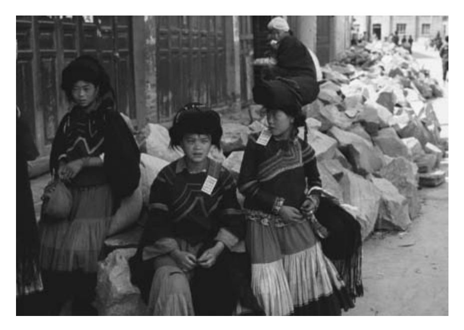
FIG. 10. Workers in a private enterprise, Yuexi County FIG. 11. A rural Nuosu entrepreneur with his staff, Xide County