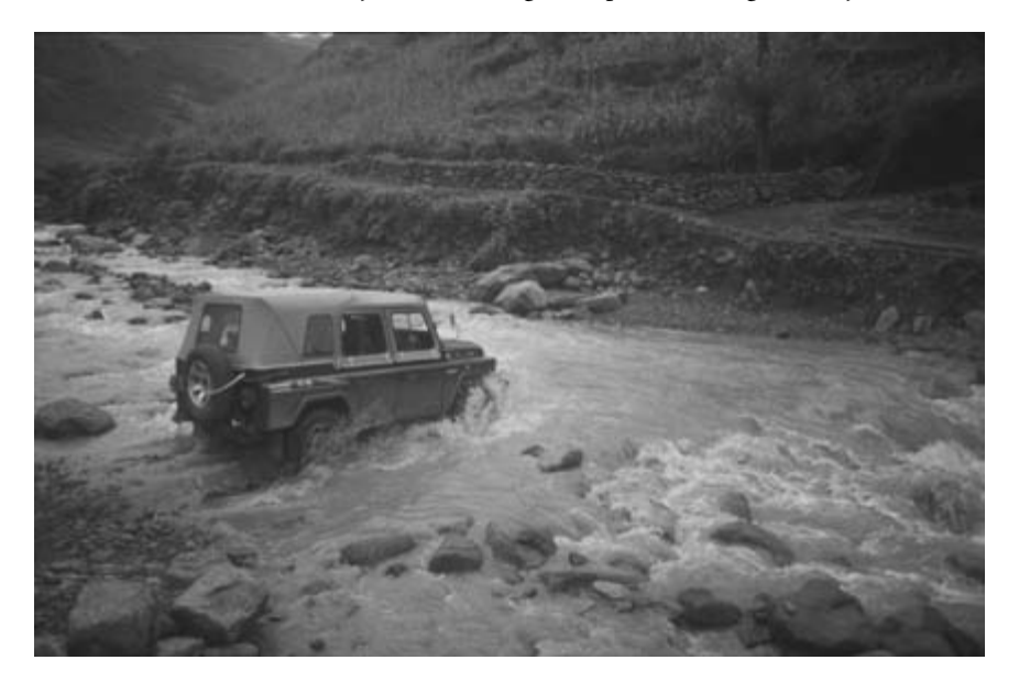
FIG. 1. On the way to visit a village entrepreneur, Meigu County

How can this impoverished county with an average annual income of US$50 per person afford such an inefficient administration? On the streets, Yi men squat together in groups and abandon themselves to alcohol. Cloaked in