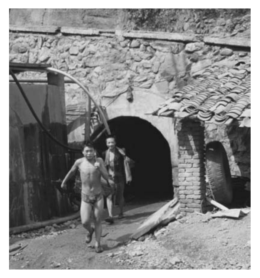
FIG. 4. Workers leaving a private lead mine, Ganluo County

level of education compared to Yi in other county towns because Ganluo has had a school system since before the founding of the People's Republic. Thus, it was surprising to find that the percentage of companies owned by Yi entrepreneurs was smaller than the percentage of Yi within the population; although Yi made up 65 percent of the population, only 22 percent of the entrepreneurs were Yi.