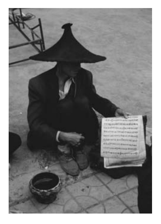
FIG. 3. A bimo telling fortunes on the streets of Puge County