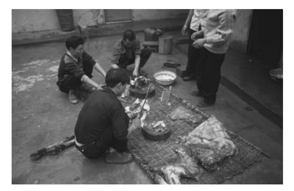
FIG. 14. Preparing tuotuorou for the research group at the home of a Nuosu entrepreneur, Meigu County

regarding prosperity, wealth, property, and luxury. They are also role models for behaviors and values concerning competition, economic freedoms, innovation, and market behavior, and they promote new structures as well, such as organizations representing their interests, local level public income structures, and the labor market.