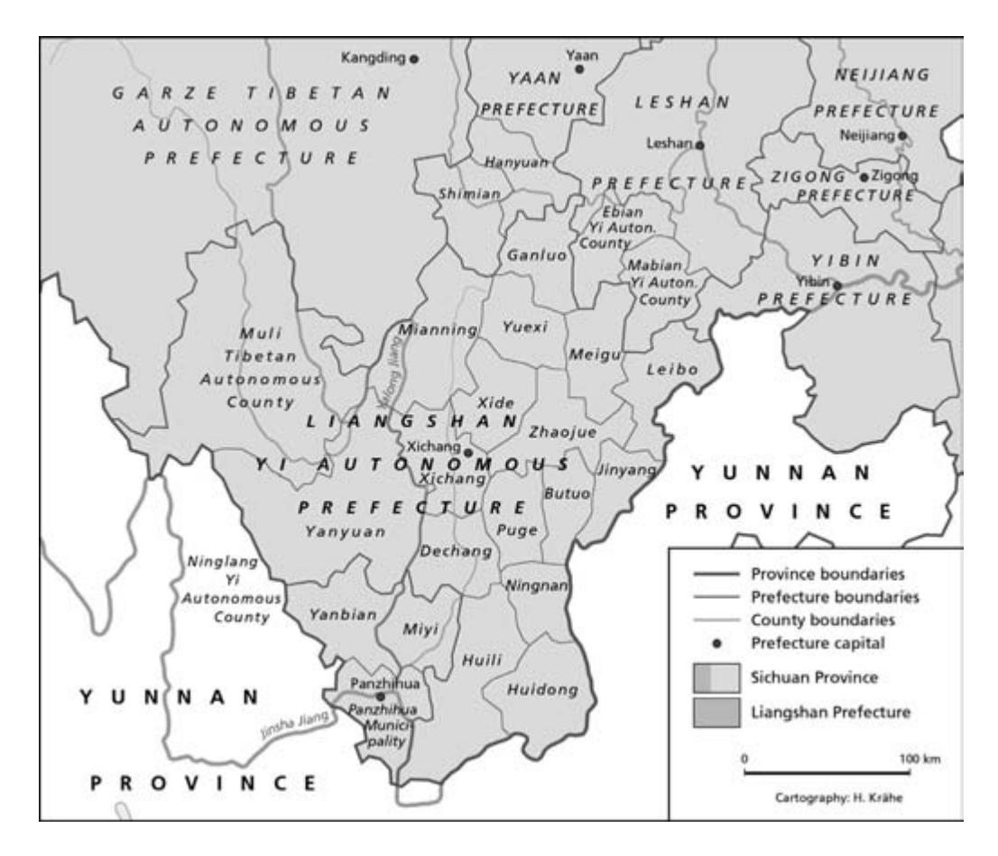
MAP 3. Liangshan Yi Autonomous Prefecture

ple, in salt). Clothing was manufactured on a household basis for family use only. A division of labor between agriculture, craft, and trade was largely absent,<sup>2</sup> and the trading system that had formed in the peripheral areas of Liangshan was limited to trade in everyday goods (Wang Luping 1992). However, there did exist a division of labor by class. As a rule, Black Nuosu (Nuoho) did not participate in cultivation; this was the task of Quho and the lower castes. While livestock rearing was also the domain of the lower castes, breeding livestock was Nuoho's work. But, as argued above—and this point needs to be emphasized—Quho were not slaves by any standard.