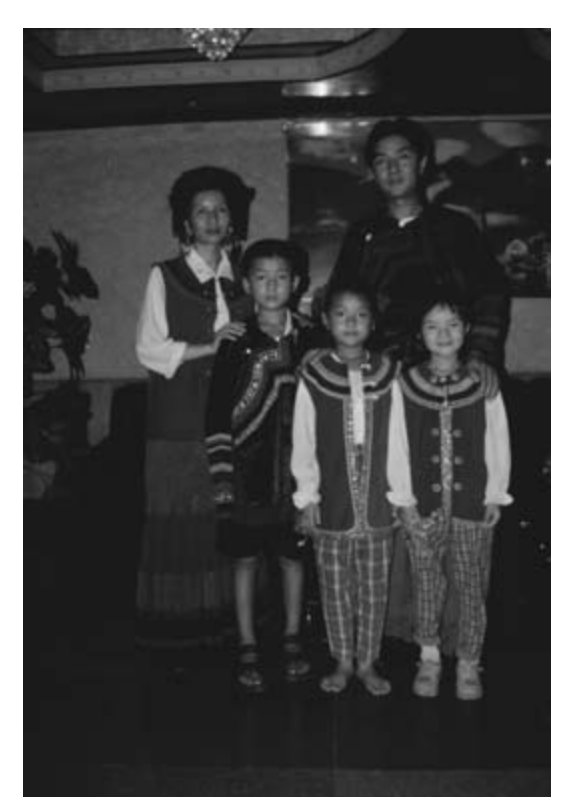
FIG. 12. An entrepreneur and his family, Ganluo County