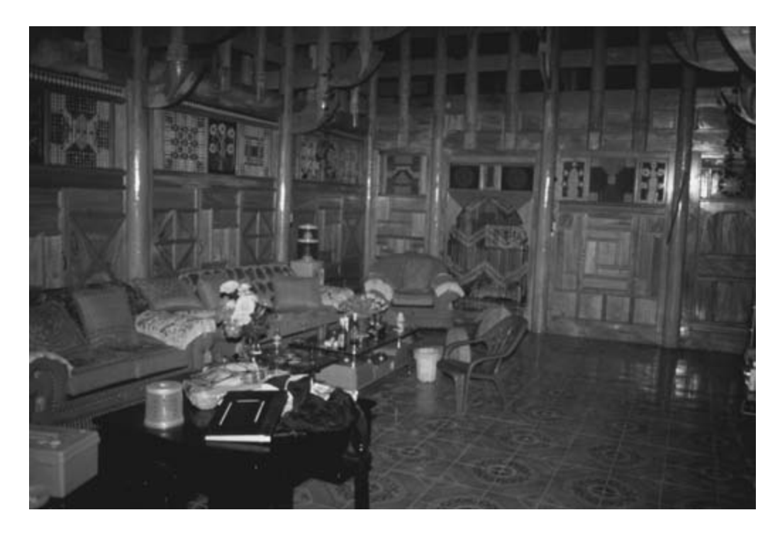
FIG. 13. An entrepreneur's "traditional" house, Meigu County