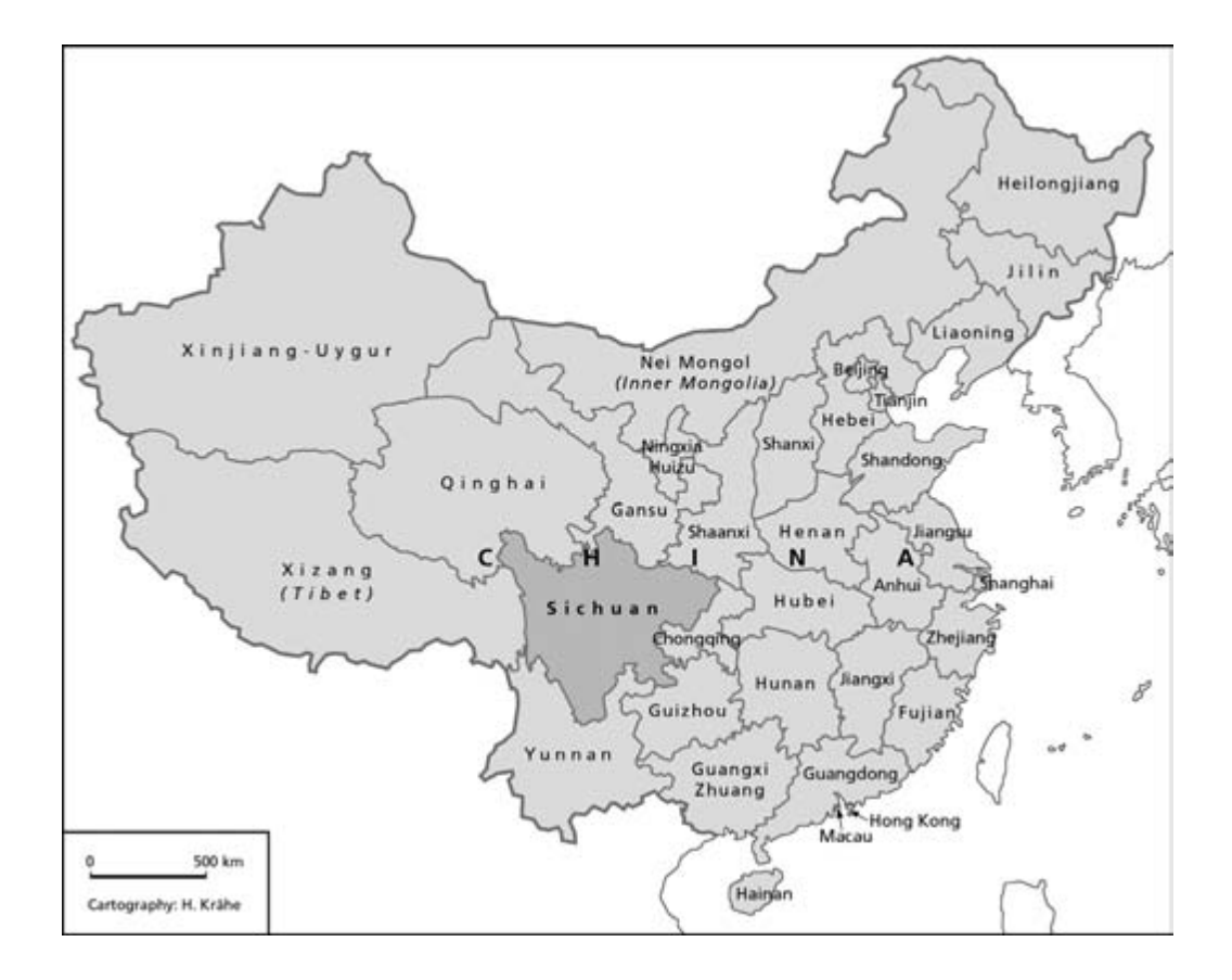
MAP 1. China