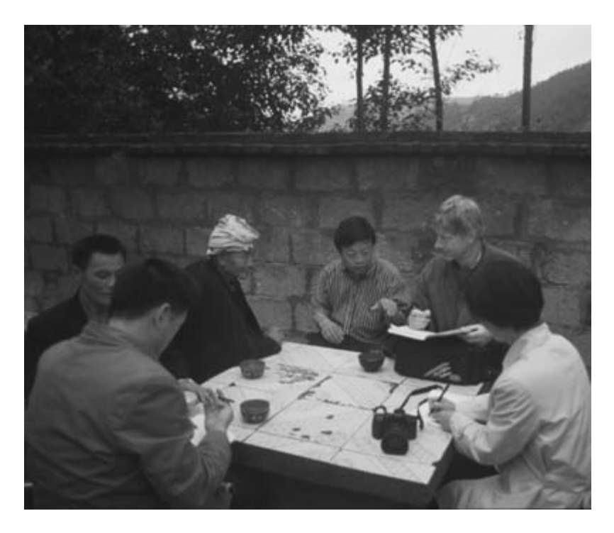
FIG. 2. The research team interviewing a Nuosu entrepreneur (third from left), Meigu County

Xichang, and was sponsored by the German Volkswagen Foundation. Field research was conducted in 10 of the 16 counties that make up Liangshan Prefecture. Our research team visited Ganluo and Mianning in 1999, Zhaojue and Yanyuan in 2000, Leibo, Meigu, Butuo, and Puge in 2001, and Xide and Jinyang in 2002. The empirical part of this research was carried out using a combination of qualitative and quantitative research methods that provide different types of information and are appropriate to particular aspects of the research. For example, politically sensitive questions, such as those related to ethnicity or ethnic identity, could not be posed in questionnaires. Altogether, 138 private entrepreneurs were interviewed using a questionnaire and qualitative interview techniques, for which a series of semi-standardized, open-ended questions was prepared. In each county, 8 to 10 local county, township, and village officials were interviewed, and statistical data and written material were obtained from Party and government documents and publications.