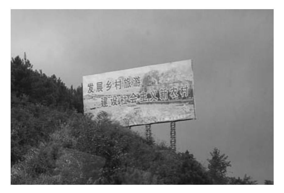
FIGURE 1.1. A billboard in Guizhou promotes rural tourism development and building the New Socialist Countryside (2006).

to integrate the region's participation in the New Socialist Countryside policies with the development of rural tourism. Attracting tourists to the area was not a new idea.<sup>2</sup> Billboards lining highways and roads in rural Guizhou before 2006 also advertised particular regions, with the dual goal of attracting both tourists and investors (figure I.2). Therefore, while the promotion of rural tourism development in 2006 was not entirely new to the area, the deliberate, heavily publicized incorporation of tourism into larger programs for building a New Socialist Countryside gave rural tourism an even brighter patina of doing something not only for the rural communities involved but also for the nation as a whole.