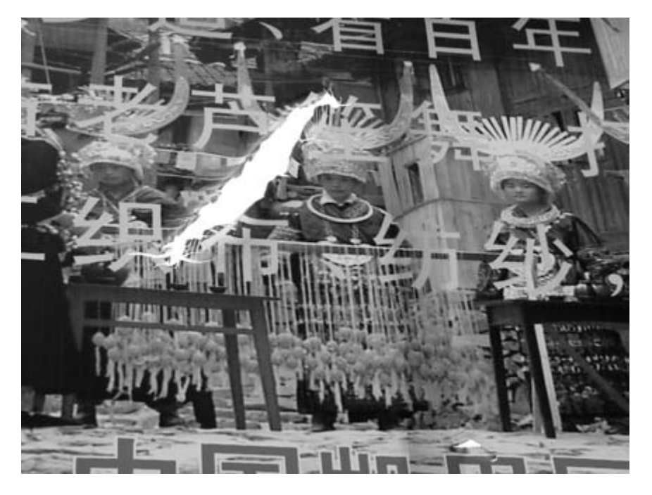
FIGURE 5.1. A poster advertising the 2006 International Lusheng Festival in Upper Jidao was slashed and damaged (2006).

was only later, in 2007, that Teacher Pan eventually told me about the letter written by the Jidao village Party Secretary to the provincial government, which had effectively halted the original plans to build a hotel in Upper Jidao and signaled the ongoing tensions between the two communities.