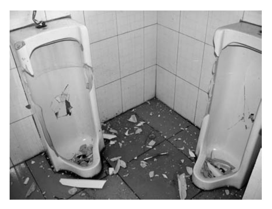
FIGURE 5.2. Urinals in the public toilet at viewpoint number 1, in Ping'an, were smashed as a retaliatory act against changes proposed by the management company (2007).

site seemed deliberate: the toilets at the two village viewpoints had been built and paid for by the management company, but viewpoint number 1 was much less visited than viewpoint number 2 (where the more wellknown view of Seven Stars with Moon could be seen), so the damage would have a lesser impact on tourists.<sup>4</sup> Inside the toilet facilities at viewpoint 1, the countertops, urinals, and tile floors were broken, apparently hit with a blunt, heavy object. I asked a number of individuals in Ping'an about this incident. Everyone remained silent about the perpetrators, but most concluded that it had happened because the company had taken down the shops along the path. One feeling going around the village, a shopkeeper told me, was that if the government or company wasn't happy with the way things were changing in Ping'an, they should just get out and let the villagers go back to selling the tickets and taking care of the business themselves as they had done in the past. It was clearer than ever before that the line had been drawn in Ping'an, and that the ongoing tit for tat