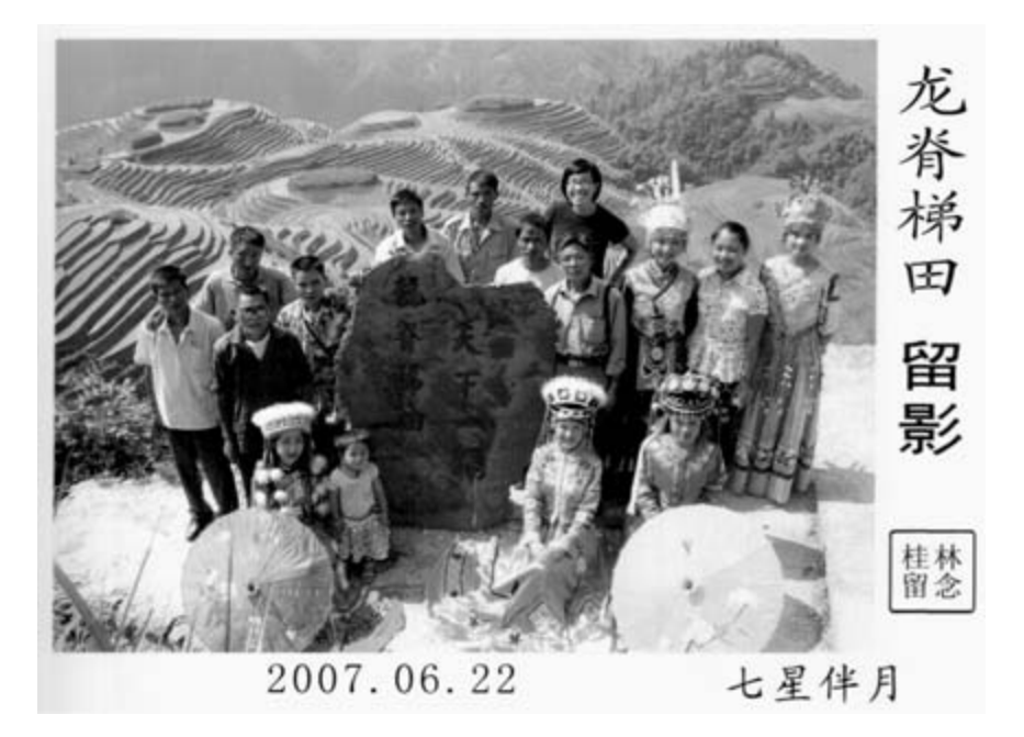
FIGURE C.1. During their visit to Ping'an, members of the Upper Jidao Tourism Association pose for a souvenir photo with the models and the author (2007). The Chinese text on the right reads, "Longji Terraced Fields Souvenir Photo," and in the box, "Guilin Souvenir." At the bottom it reads, "Seven Stars with Moon."

said. I agreed after negotiating on the price. The women lined up in a row and began explaining how the Yao valued long hair on women, cutting it only once as a woman approaches marriage (around eighteen, these women said) and often keeping it covered until marriage. I wondered how interesting this was to the group from Upper Jidao, where women also typically kept long hair and would also wind it up into a topknot for special occasions (though, of course, the types and styles of head coverings, as well as the techniques for securing the hair, were different). But a show was a show, and the Yao women's performance was punctuated by the Upper Jidao group, as individual men posed for pictures behind the Yao women (figure C.2).