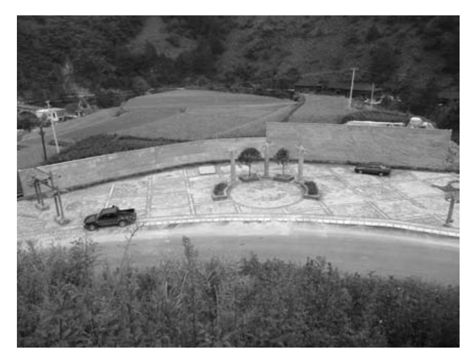
FIGURE 5.6. A new decorative parking lot for Jidao was completed as a part of the 2008 highway project along the Bala River. This lot was located at the roadside entrance to both Upper Jidao and Lower Jidao, and the wooden gates displayed the name of the village ("Jidao" on the smaller, right side, and "Jidao Miao Village" on the larger, left gate). The carved stone wall features a mural of Xijiang, Jidao, and other villages promoted as tourism destinations in the Bala River area. In the carving, wooden houses are tucked in among tall trees and steep hillsides (2010).

tion on their own performance ground in their village to compete with Upper Jidao.