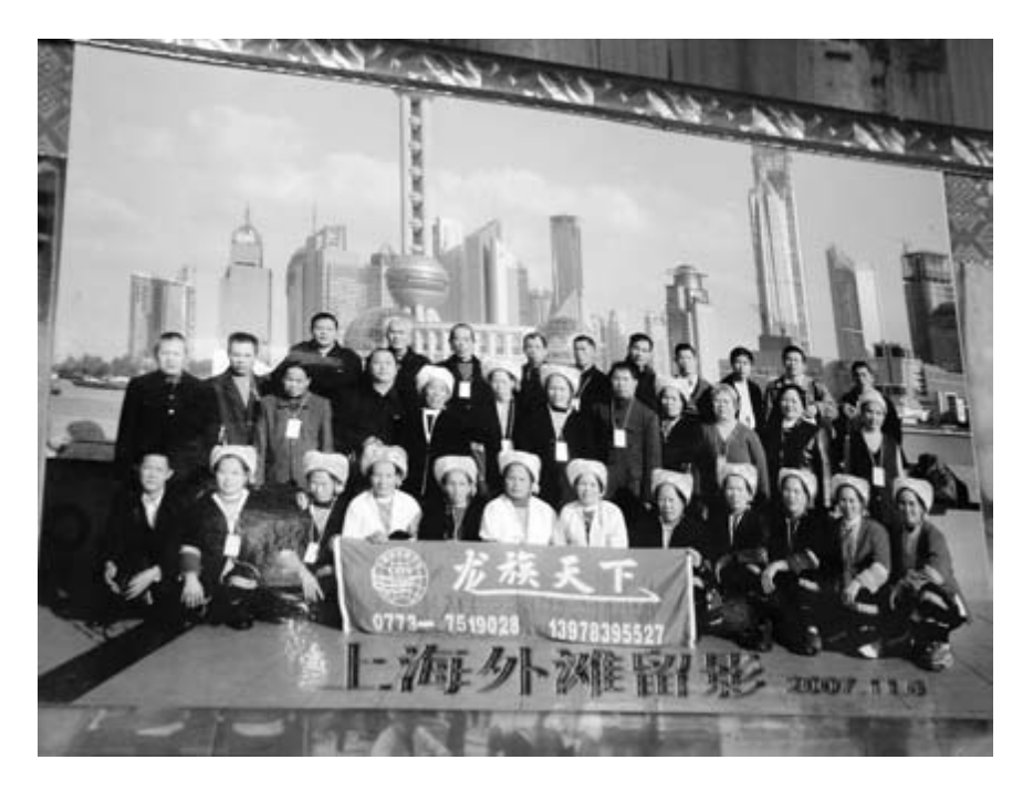
FIGURE 3.2. A souvenir group photo of Ping'an residents who visited Shanghai hangs on the wall of a house in the village (2007).

Returned migrants influenced tourism developments in their home villages by bringing their personal experiences in travel to bear on the future of their village tourism industries. Within this landscape of travel, mobility played a formative role in giving order and meaning to the identities and economic possibilities available. Through the stories of travel of five individuals, it is clear that the topics of experiencing the world, knowing what tourists want, entrepreneurship, and reintegration were all pertinent to the ways in which tourism was perceived as a livelihood and opportunity, much as out-migration was also already so understood. It is by tracing these changes in mobility that a more nuanced understanding of social transformation and modernization programs in rural tourism villages can be pieced together, thereby allowing for a closer examination of how both discourses of and experiences in travel operate in conjunction and in competition with each other.