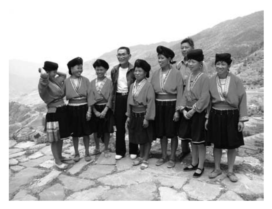
FIGURE C.2. Members of the Upper Jidao Tourism Association pose for a photograph with Yao women who come to Ping'an daily from the neighboring village of Zhongliu (2007).

ethnic minority courtship practices in southwestern China, and it is commonly performed in ethnic shows and films. Part of the preparations for tourism in Upper Jidao included organizing groups of men and women to practice and perform call-and-response singing for tourists in the forms of courtship songs ( qing ge ) and "ancient songs" ( gu ge ). It was a moment of parallel ethnic forms meeting face to face. Both the Yao women and the Miao men knew that such songs were evoked in the mainstream media as representative parts of their own traditional practices; they knew how the performance of these songs was valued in tourist experiences; and they knew that they were each singing in languages and styles unfamiliar to the other (figure C.3). Nevertheless, "being ethnic" in this touristic context became a total sensory experience for everyone involved—"ethnicity" here was entertaining and deeply personal, as each group drew upon its own practices and skills to participate in the encounter.