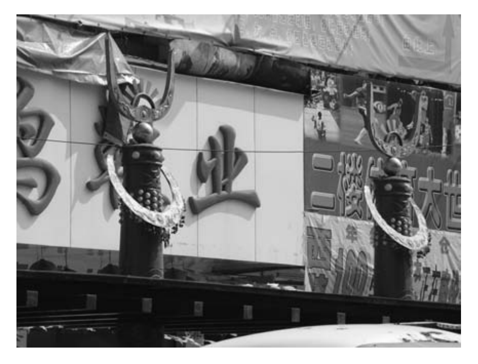
FIGURE 4.2. Bus stops in Kaili are visually themed to resemble Miao headdresses (2007).

not specifically deemed scenic tourism areas (ibid., 48). The gradual visual transformations in Sankeshu and Kaili clearly aimed at constructing and standardizing the "visual impact" of the prefecture for tourism.