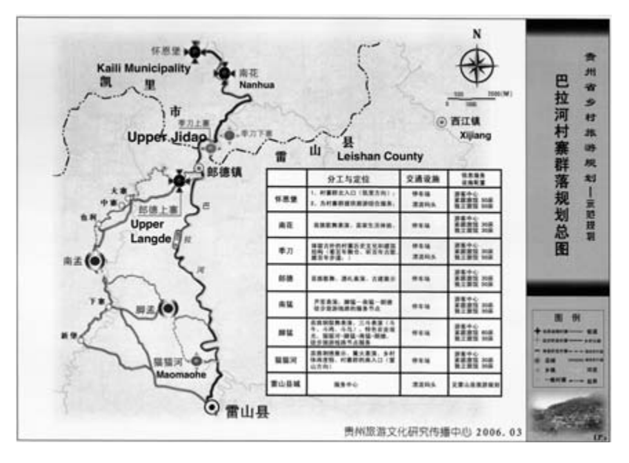
FIGURE 1.3. A map of the seven villages in the original Bala River Demonstration Project for Rural Tourism illustrates the idea for a tourism region. The chart on the right outlines the various tourism resources and attractions in each village, the transport infrastructure to be constructed, and plans for accommodation. The dotted line between Upper Jidao and Upper Langde indicates the administrative division separating Kaili from Leishan county. Adapted from map 5 in Guizhou Tourism Bureau, Rural Tourism Plan, 2006–2020 (Guiyang: Guizhou Provincial Tourism Administration, 2006).

as local governments competed against each other for tourists and tourism profits.