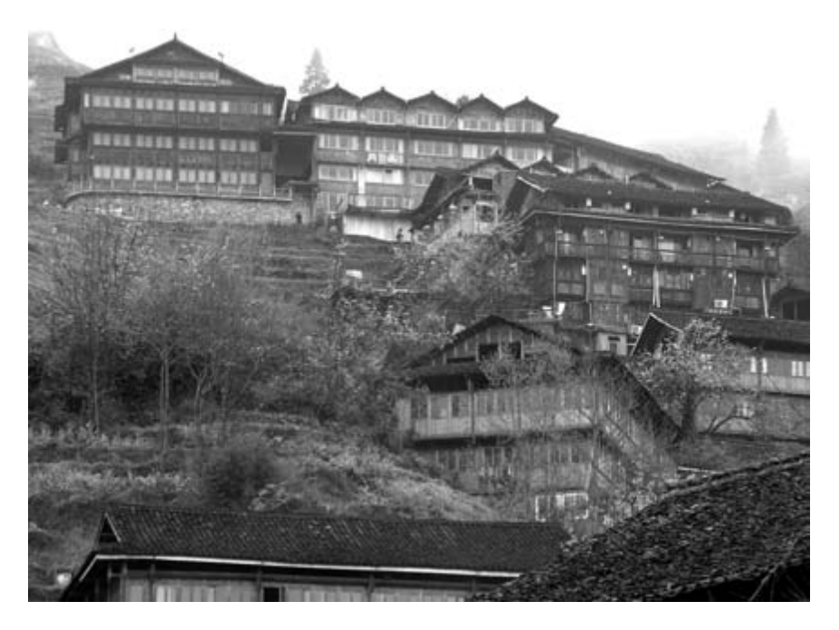
FIGURE 5.3. Hotels in Ping'an are clustered along the path to the viewpoint for looking at the Seven Stars with Moon landscape, which is the more well-known view; the last large building on the upper left is the most expensive hotel in the village (2007).

effect, "such photographic practices [of landscape] thus demonstrate how the environment is to be viewed, as dominated by humans and subject to their mastery" (Urry 2000, 87). These spaces only reinforced an ongoing problem, however: village residents felt excluded from the celebration of their landscape, which they considered the product of their ingenuity and labor. The photographic "domination" of the landscape in Ping'an by the gated balcony of a hotel owned by an outsider to the village suggested yet another external exertion of power over the community. Within a few months of this hotel's opening, villagers remarked to me that no one except the staff (at first only one of whom was a local woman, hired as a cleaner) and guests could enter. The villagers who were hired as porters to carry luggage up from the parking lot were allowed only as far as the front door. This total exclusion from the hotel space was new to the village residents. Family-run guesthouses were more typically a semiporous border