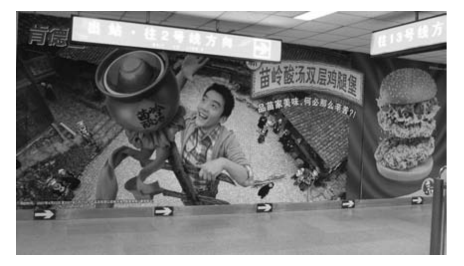
FIGURE 5.5. A KFC advertisement for the Miao Mountain Sour Soup Double Chicken Burger inside the Xizhimen subway station in Beijing features a background image from Upper Langde, Guizhou (2007).

local specialties included bamboo rice and smoked pork. In both villages, the local alcoholic brew was also evoked as a specialty. In Upper Jidao, it was distilled from rice or corn; in Ping'an, it was usually made from sweet potatoes, and many families also made their own sweet rice wine.