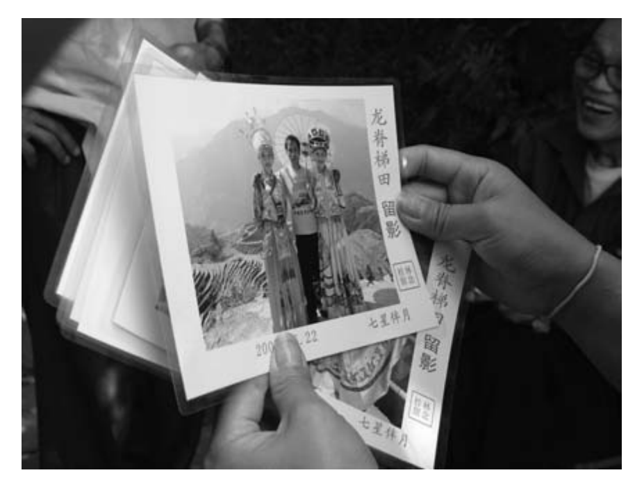
FIGURE 4.4. This photograph cost the tourist ¥30 in total: ¥10 to each of the two models, plus an additional ¥10 for the printed and laminated souvenir photograph (2007).

clothes worn by women in Ping'an (see figure 4.6), and they were specifically manufactured and purchased as costumes to be worn for tourism performances or shows, including national ethnic minority dance performances.<sup>15</sup> The ethnic minority costumes worn by the models were also the same types provided to tourists who wanted to dress up in costumes for a fee, so they were designed to be easily slipped on over one's clothing. Conversely, the festival attire worn by women in Upper Jidao and the ethnic clothes worn by women in Ping'an were used both in nontouristic contexts as well as repurposed for tourism over the years.