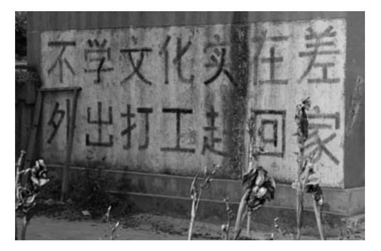
FIGURE 3.1. A slogan painted on a wall in another village about a mile away from Upper Jidao reads, "Not pursuing an education is really bad; migrant workers, come back home" (2006).

rural residents could give precedence to "an education in the city" before coming home. The educational opportunities afforded by out-migration were emphasized in a number of interviews I conducted; the ones who leave, people said, return with a better understanding of the world (in Chinese they used the phrase jian shi mian , which generally referred to having experienced life in the world outside of the village). Every interviewee mentioned the idea of having experienced the world when speaking of the positive advantages gained from migration. Other villagers would occasionally use a negated version of the phrase ( mei jian shi mian , not having experienced the world, or not having seen the world) to describe people who were perceived as being less educated or having less common sense and worldliness.