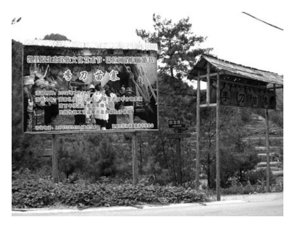
FIGURE 1.4. Signs along the old highway S308 attempt to capture the attention of passing tourists. The poster to the left advertises the "Kaili Ecological Minority Culture Festival–Bala River Summer Tourism Holiday." The wooden gate to the right reads, "Jidao Miao Village" (2007).

project for this place. Later, Teacher Pan explained to me that the Jidao village Party Secretary, who was from Lower Jidao, had written a letter to a provincial-level official in 2006, complaining about the unequal allocation of development funds and resources in the village. This had caused enough of a stir at the provincial level, Teacher Pan surmised, to prompt the Guizhou Tourism Bureau and Shan Li to back off from their original plan to build a hotel in Upper Jidao.