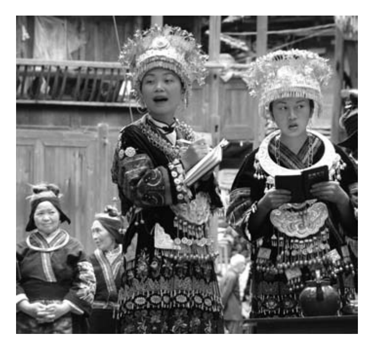
FIGURE 1.5. Qin and Wu of the Upper Jidao Tourism Association organize village residents before a reception and performance for a tour group (2008).

This project was largely funded through the personal efforts of Zhang Xiaosong and a Hong Kong–based philanthropist, who provided funding to purchase supplies.<sup>76</sup> In my conversations in 2008 with the women in Upper Jidao about this project, many said that the designs and embroidery styles they were given to practice were entirely new to them; some women were afraid of doing a bad job and thus reluctant to participate. Others were unhappy or disappointed when their works were not deemed good enough to sell or not selected for recognition; gradually some women stopped participating. The project did not cease entirely, however, and by 2012 the lower level of the village cultural center had been turned into a small exhibition space, holding some of the embroidered pieces and a copy of the 2011 Marie Claire issue, while the better works were framed and gifted by the organization to visiting dignitaries including, in 2010, the president of the World Bank, Robert Zoellick.<sup>77</sup> As I observed their meetings and spoke with Qin about this project, I realized that the village