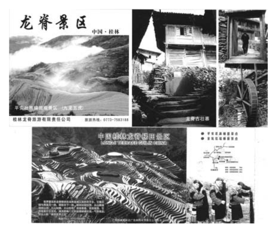
FIGURE 1.2. Images of the terraced fields around Ping'an, ethnic Yao performers in Huangluo, and village scenes are featured on a brochure (top) and entry ticket (bottom) for the Longji Scenic Area (2007).

( Longji titian tianxia yi jue )—was coined by one of the foreign visitors, Lao said.