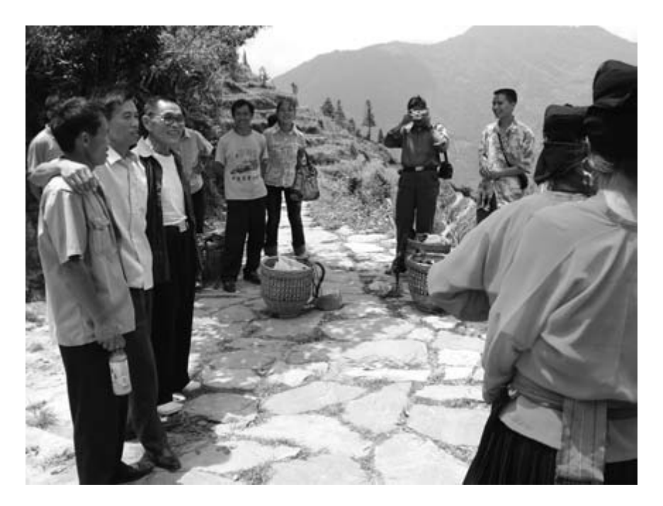
FIGURE C.3. Men from Upper Jidao sing in response to the Yao women's song (2007).

Jidao jokingly referenced familiar storylines of love and sex in their conversations with the Yao women—from winking at the notion of women not being allowed to "show their hair" to asking if Yao young men were allowed to "visit" young women at home, in an allusion to another wellknown ethnic stereotype of "free" love among some minorities in China, such as the Mosuo, or Na, of Yunnan (Walsh 2001 and 2005). The joviality from both sides was reminiscent of the "sweet talk" of the models. But unlike the models whose interactions with tourists are decidedly, and deliberately, unbalanced and unequal, in this instance I wondered if the performances of the Yao women and of the Miao men somehow could cancel out the staged nature of their encounter. These men seemed quite pleased to be able to contribute something to the performance, just as they had perhaps thought that they could do by bringing a few lusheng with them to Ping'an. They were not simply performing ethnicity but in fact anticipating and planning ahead for how they could, and would, be ethnic