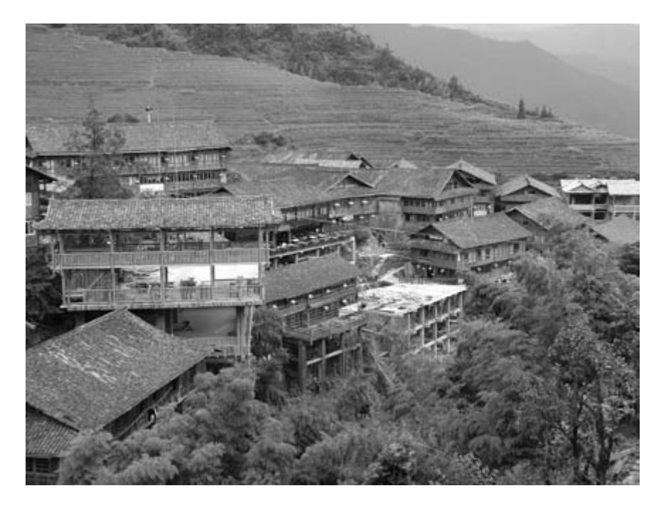
FIGURE 5.4. Balconies in Ping'an compete for views, space, and tourists. The smallest, lower-middle balcony was the first to be built in the village, attached to the old Li Qing guesthouse (2008).

had trouble at first with designing a balcony out of wood that would be structurally sound but still maintain the look of the village. Eventually, Ying devised a way to use steel rebar and concrete to construct supports for the balcony and then wrapped the concrete pillars with wooden planks to cover up the original material. When the balcony was complete, he said, income at the Li Qing guesthouse nearly doubled in one year.