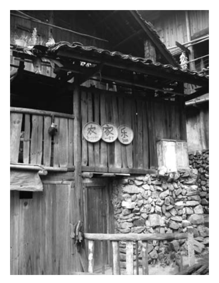
FIGURE 2.1. In 2006, households in Upper Jidao that had indicated they were willing to receive tourists hung nong jia le signs above their doorways. By 2007, most of these signs had been removed or turned around, leaving the blank backs facing outward.

Peasant Family Happy in English; spied small restaurants named Nong Jia Le in towns and cities across Guangxi and Guizhou; and enjoyed a postconference dinner at a three-story restaurant in Hefei, the capital of Anhui, also called Nong Jia Le.<sup>1</sup> During that particular evening in Hefei, I wondered what the people in Upper Jidao and Ping'an would have thought of this rural-themed restaurant. Would it have been rural enough for them? The interior was predictably decorated, with a few displays of