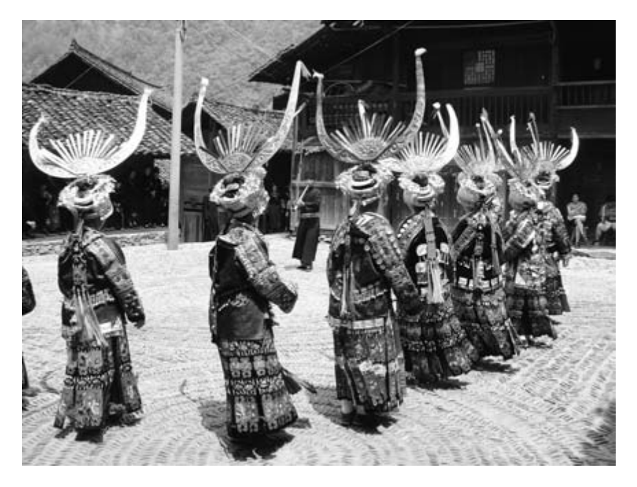
FIGURE 4.1. Women wear their Miao festival clothes and headdresses ( sheng zhuang ) when performing for tour groups in Upper Jidao (2008).

protection, and the question of what landscape architects and tourism consultants call "visual impact" (Landscape Institute 2002). According to the assessment study, "tourism development may also cause direct and indirect landscape and visual impacts. . . . [T]ourism development demands amenity infrastructure such as hotels, shops and recreational facilities that may result in landscape and visual impacts where their siting, architectural style or colour are inconsistent with the surrounding environment. This impact will become particularly significant for heritage-based tourism development, if new constructions are not compatible to host environment and cultural costumes" (World Bank 2007, 47). The authors recommend that visual impact be taken into account at a state or provincial level in all further environmental impact assessments, as their research revealed a lack of communication between various government departments involved in the promotion and management of scenic tourism areas, in addition to a total lack of regulations in parts of the province