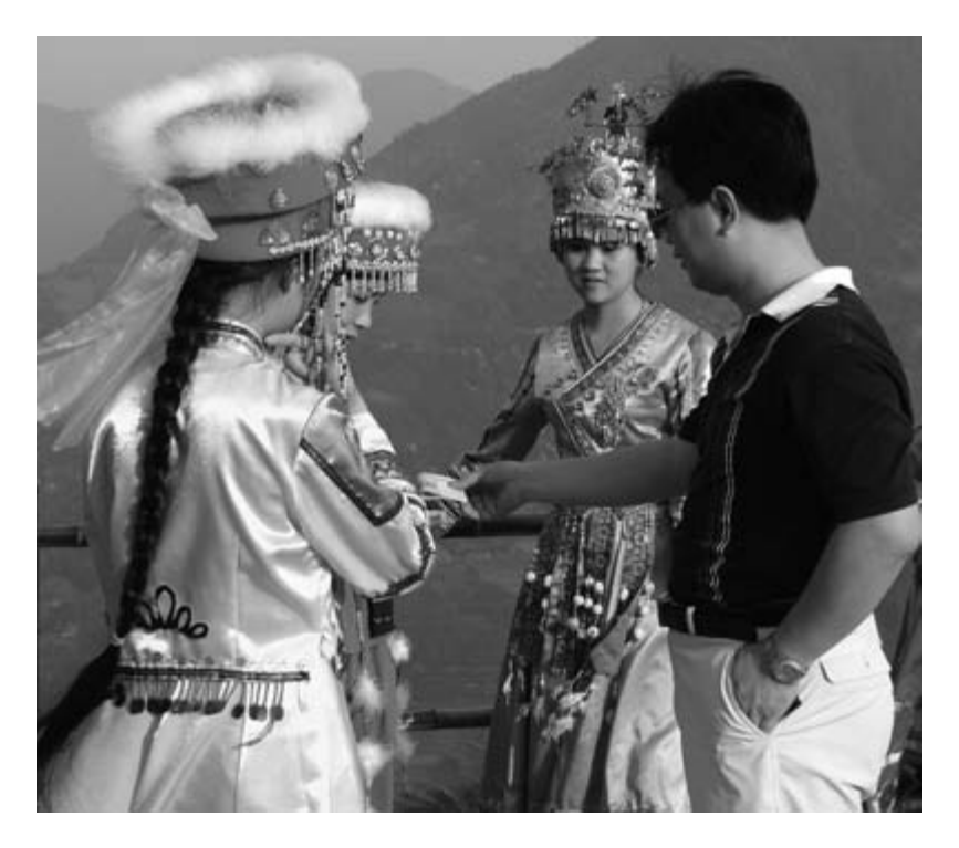
FIGURE 4.5. The minority models are paid directly by tourists who want to photograph or pose with them. At the end of each day, the models pay the photo booth owners a percentage for overhead costs (2007).

shared house and two meals a day to the models—a relatively customary arrangement in China for migrant workers.