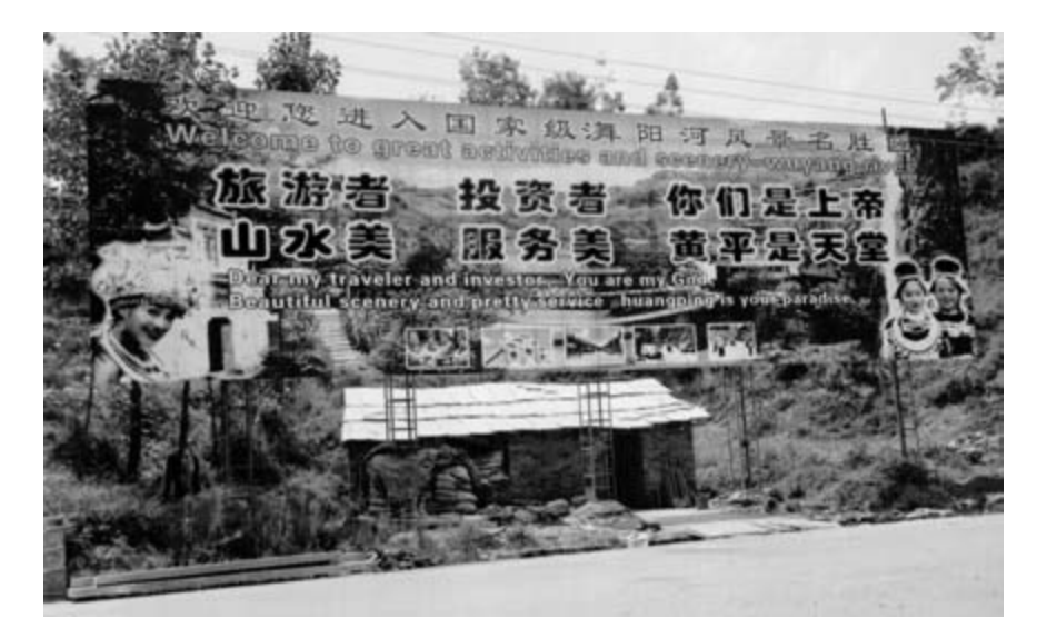
FIGURE I.2. A billboard in Huangping, Guizhou, beckons both tourists and investors (2004).

regions in China. Rural tourism was lauded by the CNTA as an ideally balanced socioeconomic formula that could increase rural incomes while simultaneously boosting urban leisure. It would help establish the role of tourism in building a New Socialist Countryside, and it would provide new destinations for domestic tourism for urban residents who needed relief from the stresses of modern city living (CNTA 2007, 93). But what were the assumptions and expectations suggested in this straightforward association between rural tourism and rural development? What would it mean to develop rural tourism and build a New Socialist Countryside? Who were these billboards really addressing, and more important, who was supposed to actually do these things?