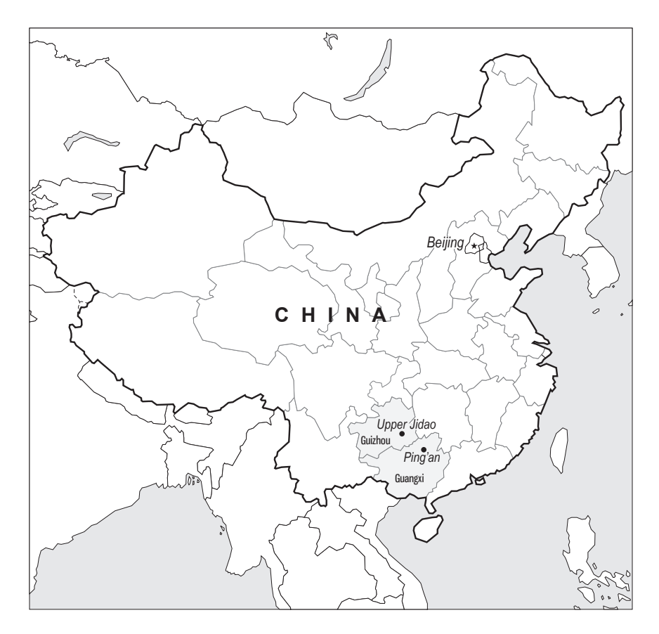
China, showing Guizhou and Guangxi (shaded) and the locations of Ping'an and Upper Jidao.