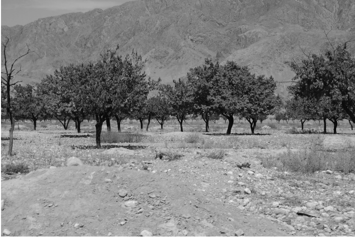
Figure 11.3 Apricot trees in the Isfara River basin, Ak-Sai.