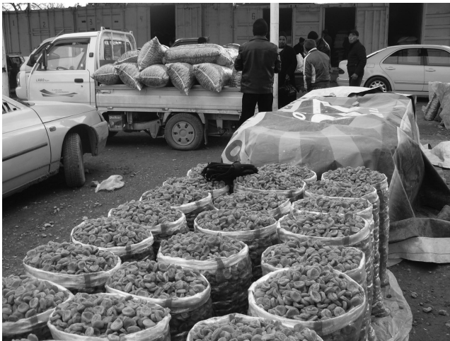
Figure 11.5 Surkh, dried fruits bazaar.