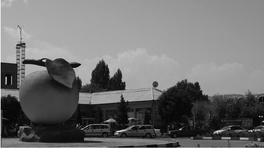
Figure 11.4 Apricot sculpture in the central bazaar of Isfara city (Tajikistan). Photo by Murzakulova, August 2017.

Our conversation with Ikhtiyor took place against the background of sporadic conflict between 2014 and 2019 in the upper reaches of the Isfara River. This was provoked by the construction of a disputed road between Ak-Sai, Tamdyk and Kishemish. 34 Kyrgyzstan's government announced the