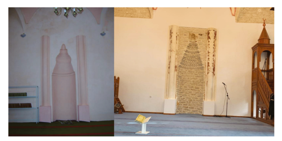
FIGURE 6.33 Mihrab of Mosque of Bazar in 2005 (right) and after restoration in 2021 (right-Merxhani)