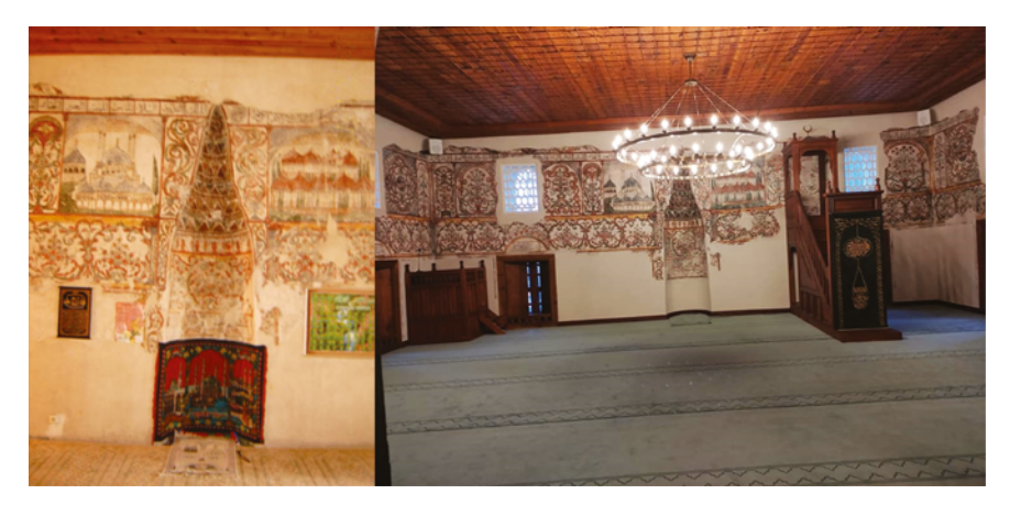
FIGURE 6.22 Mihrab image in 2005 (left) and after restoration qibla inner façade in 2021 (right-KMSH)