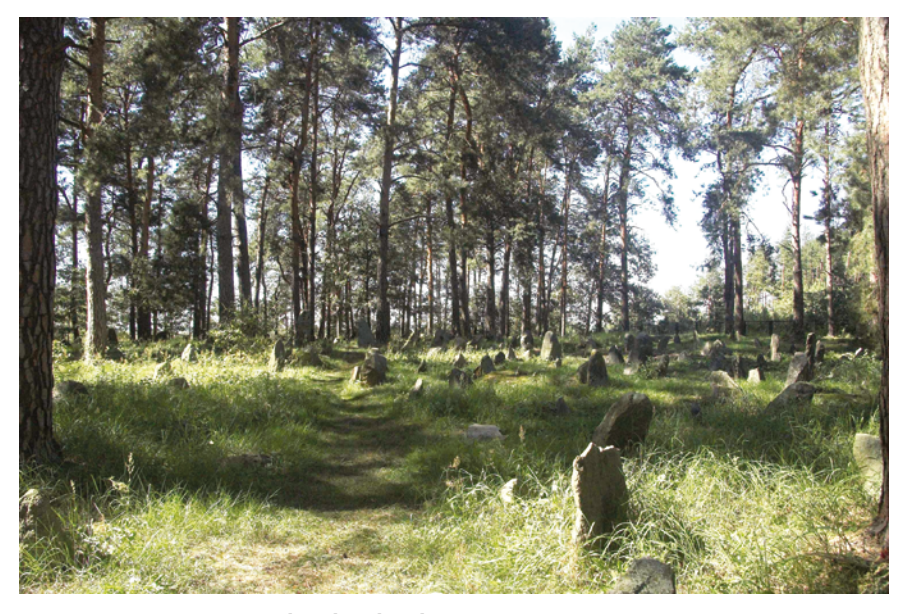
FIGURE 5.21 Mizar in Studzianka (closed) NALBORCZYK