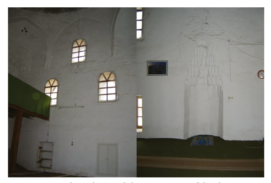
FIGURE 6.6 Interior of Naziresha mosque before restoration in 2005 (left) and (right-Manahasa)

The interior before the restoration, was very poor in terms of decorations, consisting only of mihrab stucco niches and some muqarnas stucco decoration in the squinches (Figure 6.6). After the restoration, the window frames were transformed using a compositional pattern which consists of circular and quasi-elliptical elements and partial bluish and yellowish stained glass (Figure 6.7). The lighting fixture is similar to the Murat Beg Mosque in Kruja, but in the case of Naziresha mosque, it sits better due to its higher inner spatial qualities.