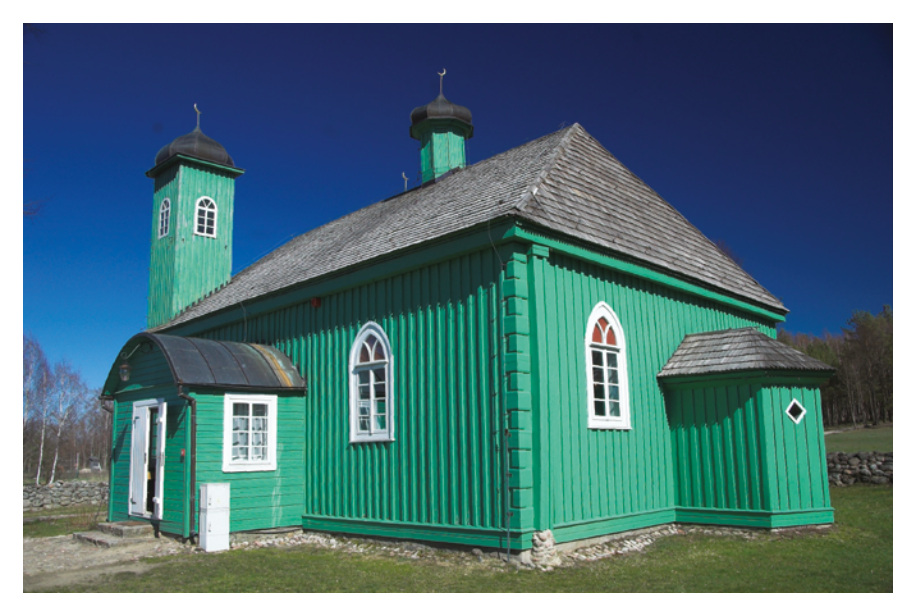
FIGURE 5.1 Mosque in Kruszyniany (1799) ENTRANCE TO THE MEN'S PART AND MIHRAB ON THE RIGHT (NALBORCZYK)