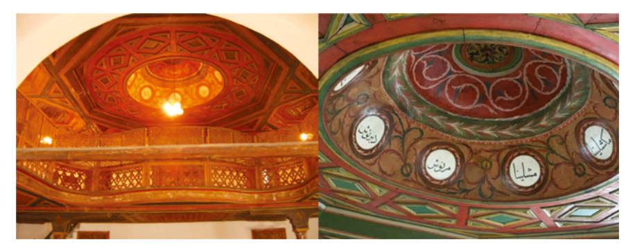
FIGURE 6.18 Wooden octagonal inner dome over women's mahfel in 2005 (Manahasa) and a closer image of the same dome after the restoration in 2021 (Ministry of Culture of Albania)

The paintings on the wooden domed ceiling of the mosque were also restored. Before restoration, the ceiling was predominantly reddish brownish, with greenish elements in a secondary presence. However, after restoration the green elements are much stronger, generating a more balanced, colourful composition (Figure 6.17). New chandeliers have been hung, whose new metallic fixture is circular and designed in a quatrefoil pattern, whose relation to Islamic symbolism remains unknown and unusual to the author (Figure 6.19). Apart from the restoration of the pulpit in the left corner of the qibla wall, the wooden quadratic ceiling in the last prayer hall has also been improved, although its colour changed from reddish brown to grey blue after restoration. On a positive note, the new roof tiles are similar to the original ones, and also respect the original colours. The roof eaves are cladded with cherry-coloured wood panels in the lower part, the only change being the colour (Figure 6.14).