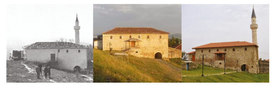
FIGURE 6.2 Image of the Mosque from 1971 (left, Luce Institute), before restoration (middle-Kreshnik Merxhani) and after restoration (right-Ministry of Culture of Albania)

space, conservation of the exterior and adjustments to the building interior. Overall, the restoration works are positive, except for some aspects which are the subject of discussion (Figure 6.2 – middle & right). In comparison to the original one, the new minaret looks as if it has been designed on the basis of classical Ottoman models, which are typical of centre of empire, Istanbul. In the original minaret, the part over the balcony and the conical cap are thinner than the lower part of its body, whereas the new one is all the same. The details in the şerefe (balcony) apparently reflect the İstanbul model. Although the original roof was tiled using hand-made local dark brown clay tiles, after the restoration the new tiles used are clearly manufactured and more reddish. After the restoration, the exterior looked more polished, and the rubble stone pattern more strongly emphasized.