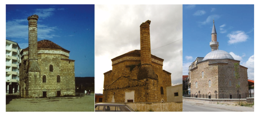
FIGURE 6.5 Image of Naziresha mosque in 1960s (Kiel-left), in 2005 (Manahasa-middle) and after restoration in 2020 (right)

The restoration works that started after 2012 included interventions in the exterior and interior of the mosque (Figure 6.5 - right). In addition, the minaret was completed, and the dome was renovated. We should say from the beginning that the restorative interventions in this building have been the most invasive ones. As seen from the comparison of the three images before and after the restoration, the drum of the dome and its covering material are not true to the original one. In the octagonal drum, which was composed of two different wall masonries, the upper white one was removed, consequently reducing the height of the drum, thereby negating the monumentality of the