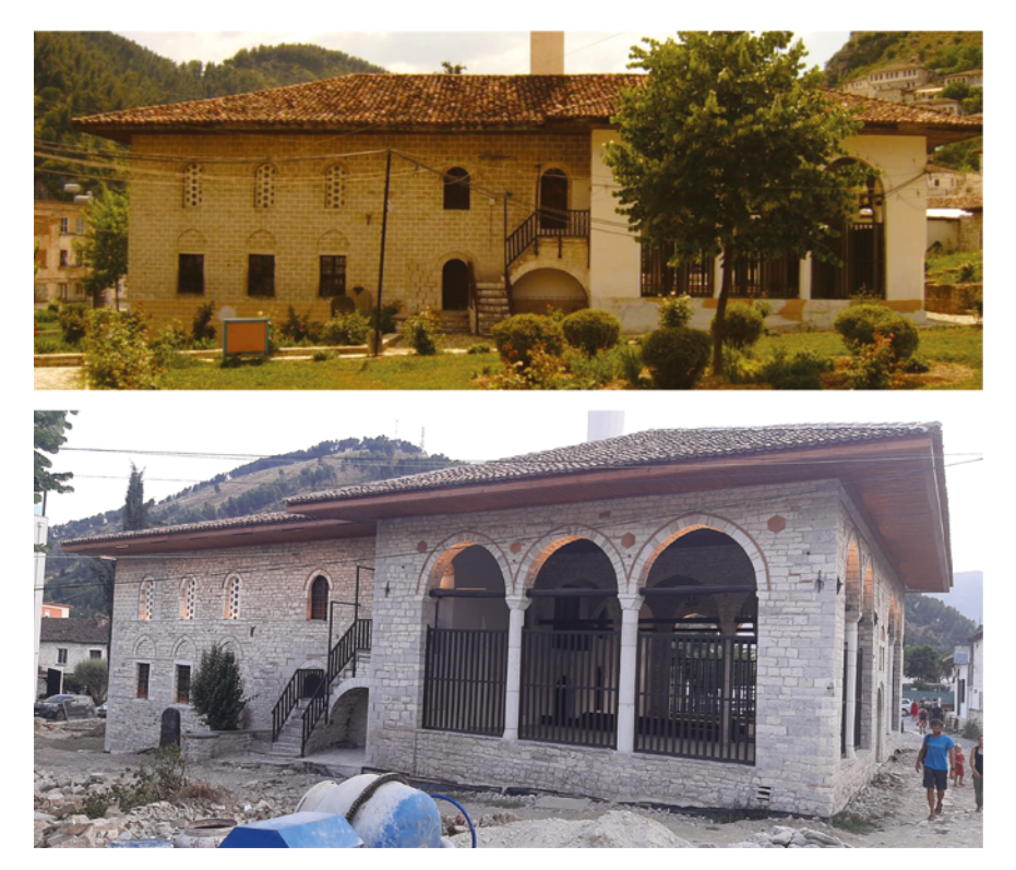
FIGURE 6.14 Northeast façade of mosque of Beyazit II in 2005 (top-Manahasa) and same image in 2021 (bottom-Manahasa)

among others Aleksander Meksi, one of the most important figures involved in historical Islamic architecture in Albania. Thus, the restorative interventions are more professional compared to the previously explained mosques, although some of them could be a subject of discussion. The restoration started in 2018 finished in February 2021 and included exterior masonry treatment and interventions in the interior space decoration. Prior to the restoration, the façades of the building were covered by a yellowish plaster, over which white rectangles are painted neatly (Figure 6.14 - left/Top). These rectangles give the impression of neatly cut blocks and are also recognizable in the image from 1978. After the restoration, the plaster was removed from the walls, except a smaller fragment, which was left at the northeast façade (Figure 6.15 - right). Thus, the new façade is left in bare masonry, polished, and treated from the structural point of view. This technique is also used in the arcade of the last prayer hall and in the piers of the main prayer hall which also had their plaster removed (Figure 6.15 - left & right).