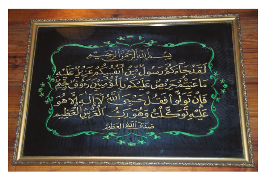
FIGURE 5.4 Kruszyniany – Muhir on the wall NALBORCZYK