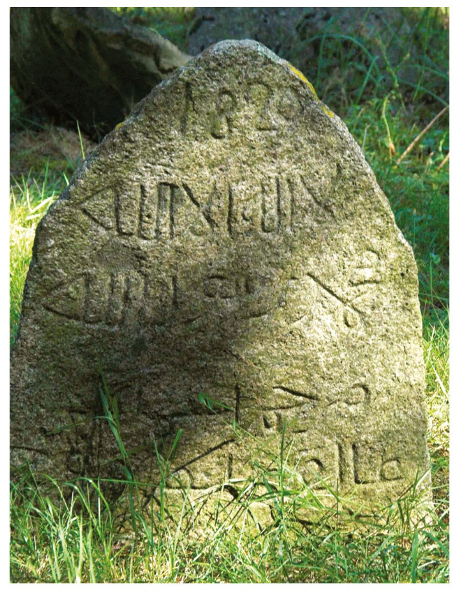
FIGURE 5.23 Studzianka – Muslim Tatar grave (Polish text in Arabic script – the name of the deceased 'Aleksandrowicz' – below Arabic religious inscription – 1820) NALBORCZYK