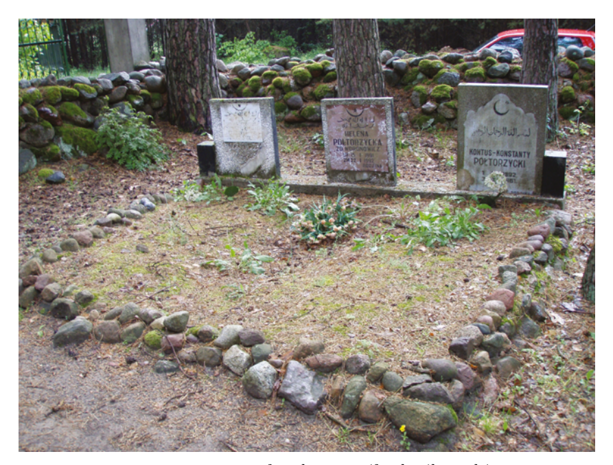
FIGURE 5.15 Kruszyniany – graves of Muslim Tatars (family Półtorzycki) NALBORCZYK