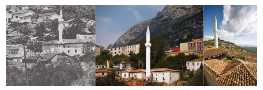
FIGURE 6.3 Murat Beg mosque in the 1960s before minaret was broken (left) and images after the 1990s before restoration (middle and right, кмян)