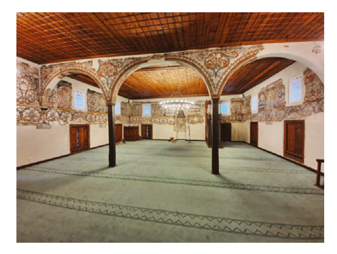
FIGURE 6.25 Main prayer hall after restoration