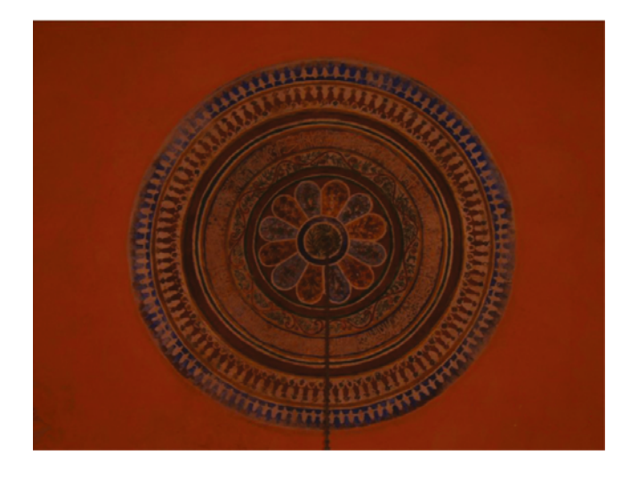
FIGURE 6.30 Medallion at the centre of the dome with central floral motif, and olive leaves and tulip motifs in the outer ring

The interior of the main prayer hall was also restored. The mihrab plaster was removed and left bare (Figure 6.33). Oddly, the same technique was used for the squinches in the transitional parts of the dome. When the author visited the mosque in 2005 the dome was painted in a light reddish colour and the original decorations were covered over, apart from a circular medallion which was left uncovered (Figure 6.30). After restoration, the dome and the interior were painted white, and eight smaller circular medallion motifs were uncovered (Figure 6.31 and Figure 6.32). The triangular surfaces created in the transitional part between the dome and the squinches were also uncovered by removing the plaster and being repainted.