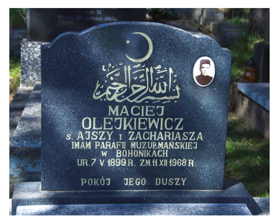
FIGURE 5.18 Bohoniki – grave of an imam of the Bohoniki mosque NALBORCZYK