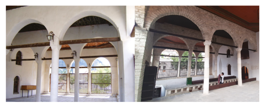
FIGURE 6.15 Last prayer hall arcade in 2005 (Manahasa) and last prayer hall after the restoration in 2021 (Manahasa)