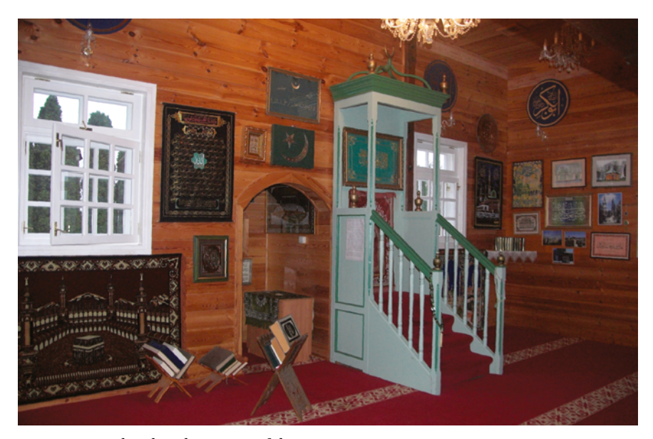
FIGURE 5.7 Bohoniki – the interior of the mosque NALBORCZYK