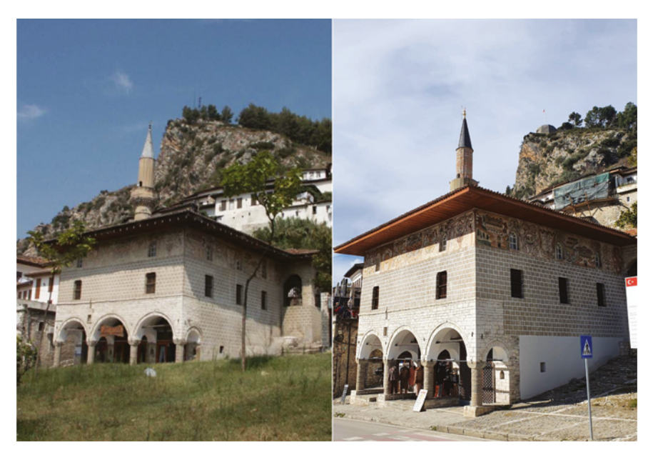
FIGURE 6.20 Mosque of Beqareve in 2005 (left) and after restoration in 2021 (right)