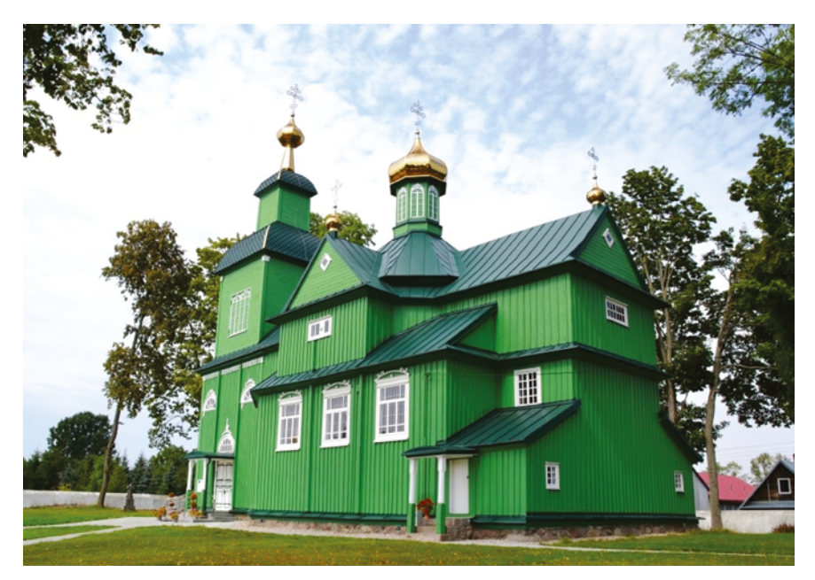
FIGURE 5.5 St. Michael Archangel Orthodox church in Trześcianka (1867)