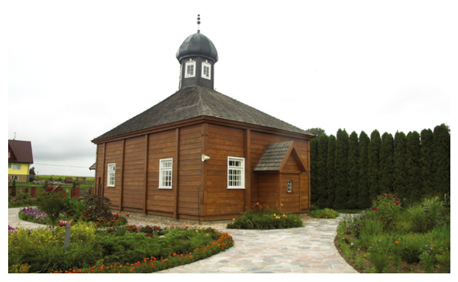
FIGURE 5.6 The mosque in Bohoniki (1873) NALBORCZYK