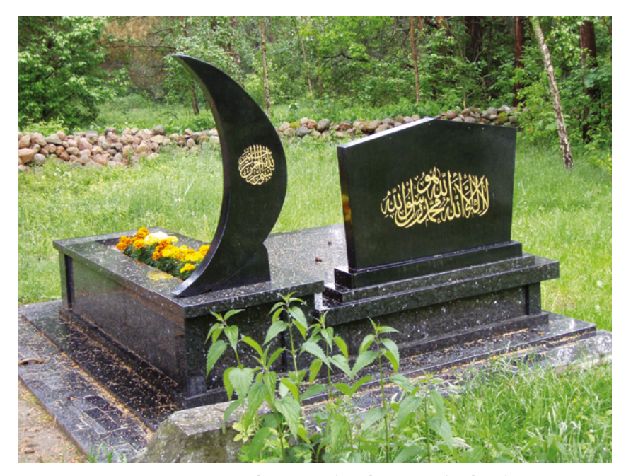
FIGURE 5.17 Kruszyniany – a modern grave of Muslim Tatars (family Safarewicz – 1999) NALBORCZYK