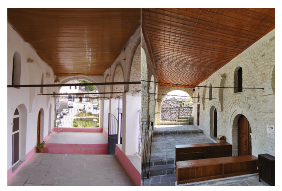
FIGURE 6.34 Last prayer hall in 2005 (left) and after restoration in 2021 (right-Merxhani)