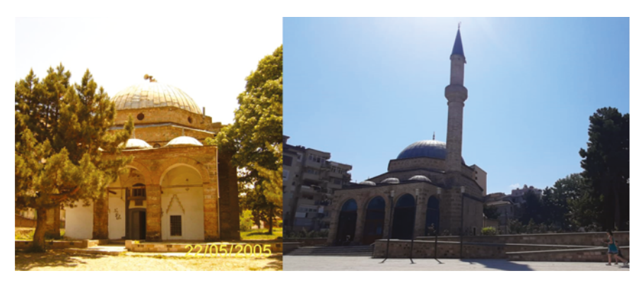
FIGURE 6.9 Entrance façade in 2005 and after the restoration in 2021 (Manahasa)