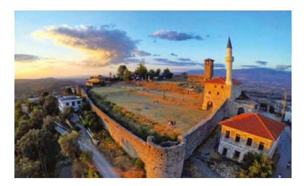
FIGURE 6.1 Actual image of Preza castle and Mosque after late restoration