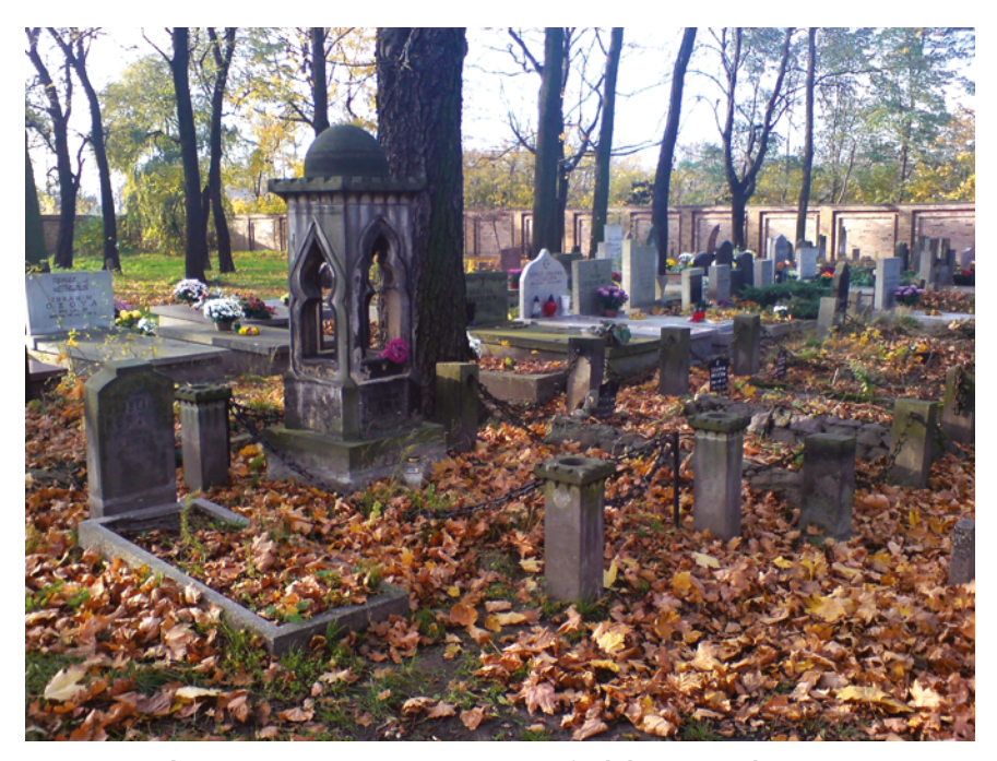
FIGURE 5.9 The Tatar Cemetery in Warsaw – graves of Polish Tatars (20th century) NALBORCZYK