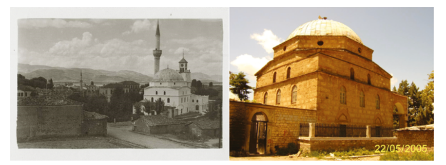
FIGURE 6.8 Image of Mirahor İlyas Beg Mosque before the second World War (left-) and in 2005 (right-Manahasa)