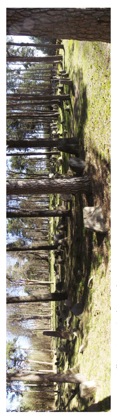
FIGURE 5.12 Kruszyniany – mizar (cemetery) NALBORCZYK