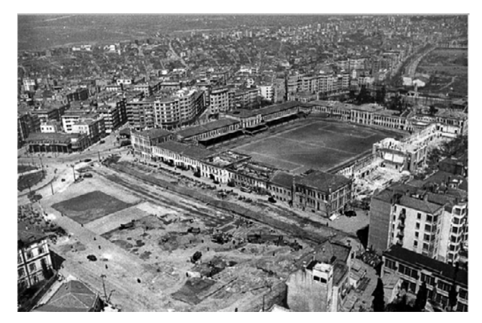
FIGURE 1.4 Taksim barracks before its demolition PHOTO FROM THE PUBLICATION "GÜZELLEŞEN İSTANBUL" DATED 1944, SHOWING THE TOPÇU MILITARY BARRACKS IN TAKSIM. THE BUILDING WAS DEMOLISHED IN 1940 AS PART OF THE URBAN PLAN OF HENRI PROST

the plans of French architect and city planner Henri Prost (Figure 1.4, 1.5, 1.6). It has since become a symbol of Turkey's modernization and secularism.<sup>17</sup> In 2011, however, Erdoğan wanted to reverse the course of history. His party's activists decided to rebuild the structure, despite the area falling within the purview of green space protection ordinances (Figure 1.7). The proposed rebuilt barracks were intended to be a shopping centre incorporating cultural