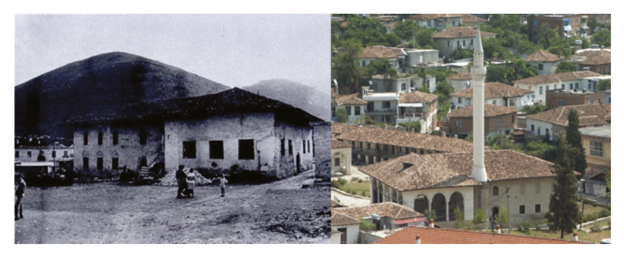
FIGURE 6.13 The image of the mosque of Bayezid II transformed into a store in 1978 (left-Kiel) and its image in 2005 (right)

The restoration of this mosque is part of the second agreement between IMK and TIKA which was conducted in 2018. The restoration process differs from the previous five mosques and was undertaken by Albanian specialists,