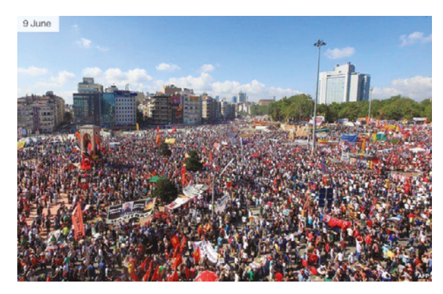
FIGURE 1.8 Gezi protests in Taksim square, 2013 "TURKEY GOVERNMENT FREEZES GEZI PARK PROJECT". BBC . JUNE 15, 2013. HTTPS://WWW.BBC .COM/NEWS/WORLD-EUROPE-22902308

FIGURE 1.7 Taksim barracks reconstruction project instigated by the AKP party DILEK ERBEY, CHANGING CITIES AND CHANGING MEMORIES: THE CASE OF TAKSIM SQUARE, ISTANBUL, JANUARY 2017. HTTPS://WWW .RESEARCHGATE.NET/FIGURE/TAKSIM-BARRACKS -REVITALIZATION-PROJECT-16_FIG19_322595360