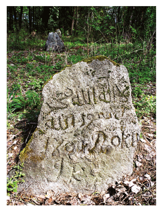
FIGURE 5.13 Kruszyniany – grave of a Muslim Tatar (1804) NALBORCZYK