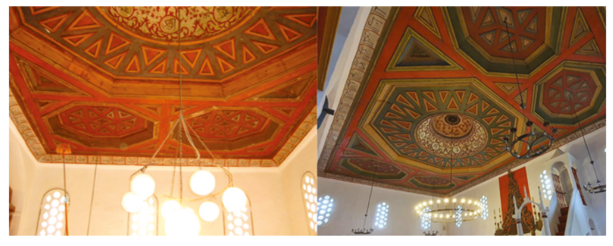
FIGURE 6.17 Minor lateral octagonal domes and major wooden domes in 2005 (Manahasa) and after the restoration in 2021 (Ministry of Culture of Albania)