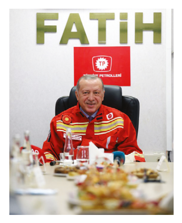
FIGURE 1.1 President Erdoğan during the conference held onboard the Fatih drillship "TURKISH PRESIDENT ANNOUNCES MORE GAS RESERVES IN BLACK SEA". POST ONLINE MEDIA. JULY 5, 2021. HTTPS://WWW.POANDPO.COM /POLITICS/TURKISH-PRESI DENT-ANNOUNCES-MORE-GAS -RESERVES-IN-BLACK-SEA/

Mediterranean and Black Sea basins. Three drillships of the state-owned Turkish gas company were renamed after them (Figure 1.1). Their goal is to search for energy resources at sea. The first resources were discovered in 2020 by drillship Fatih in Black Sea. This policy led to significant tensions with the European Union and the United States. However, the Turkish president did not intend to give up his ambitious plans and his policy in this region is supported by the vast majority of Turkish society. According to a poll conducted in 2020, 75.4 percent support Turkey's seismic research in the eastern Mediterranean.<sup>13</sup>