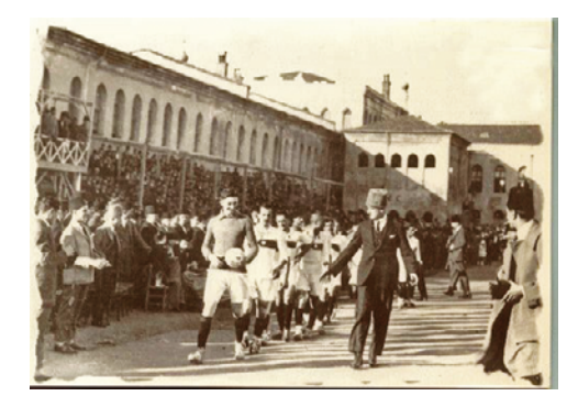
FIGURE 1.3 The first football stadium in Turkey established in the Taksim barracks "Taksim Stadium" WIKIWAND. 2020. HTTPS://WWW .WIKIWAND.COM/EN/TAKSIM _STADIUM