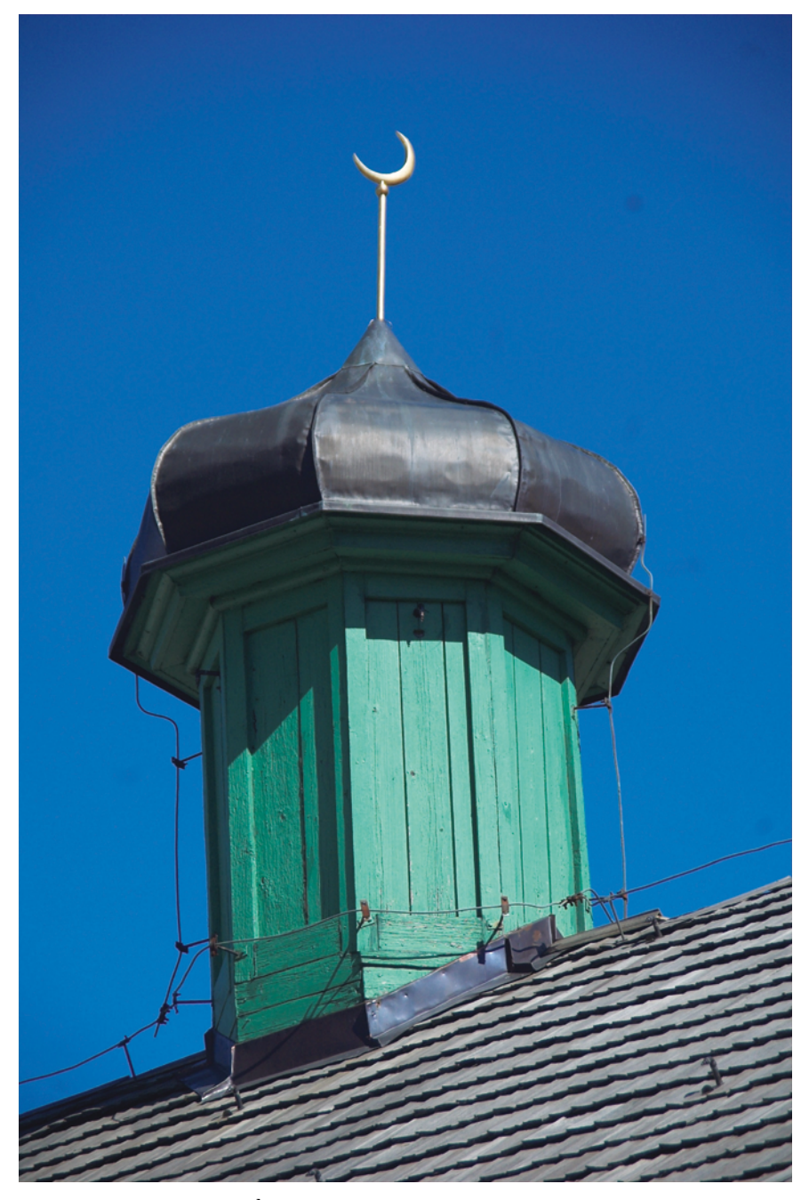
FIGURE 5.2 Kruszyniany – glorietta NALBORCZYK