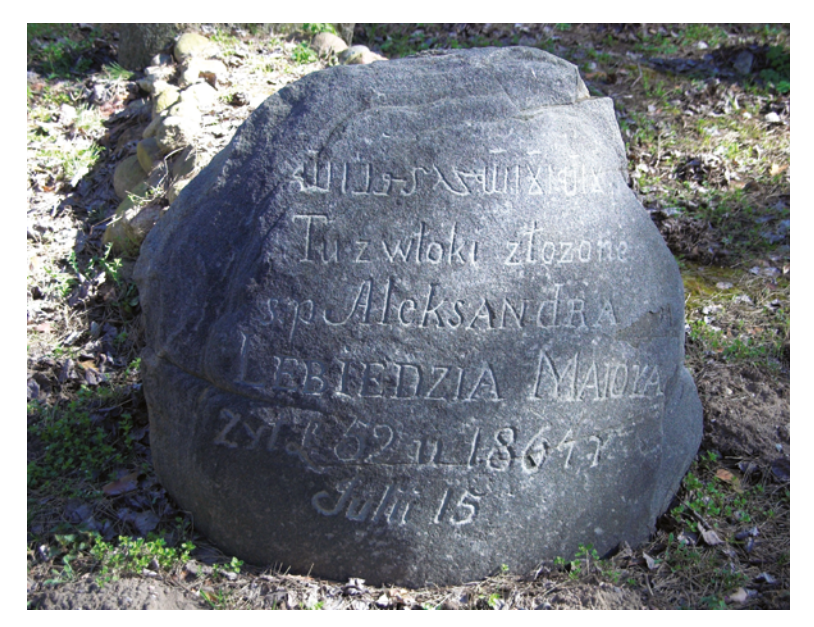
FIGURE 5.14 Kruszyniany – grave of a Muslim Tatar in the rank of major (1864); Polish text below Arabic religious inscription NALBORCZYK