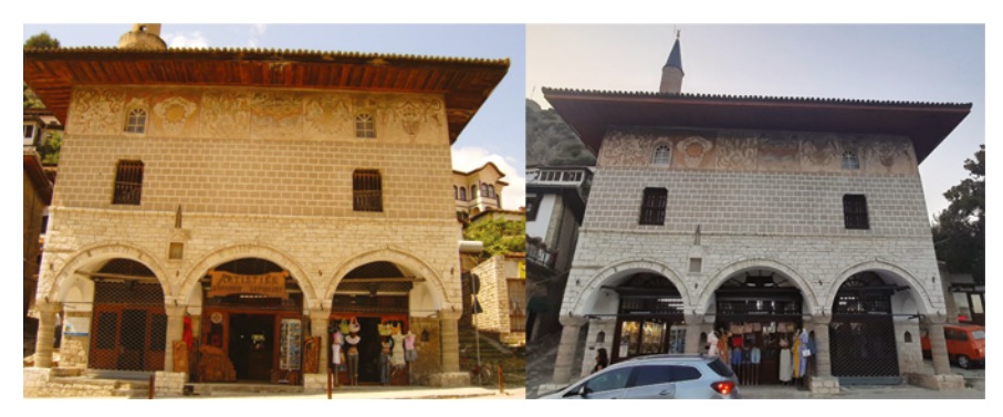
FIGURE 6.21 Qibla façade in 2005 (left) and the same after restoration in 2021 (right-Manahasa)

roof of the mosque. Apart from the replacement of old wooden structural elements, the roof was renovated using tiles of the same colour. The painting on the façades of the main prayer hall were also renovated (Figure 6.20 -right & Figure 6.21 -right).