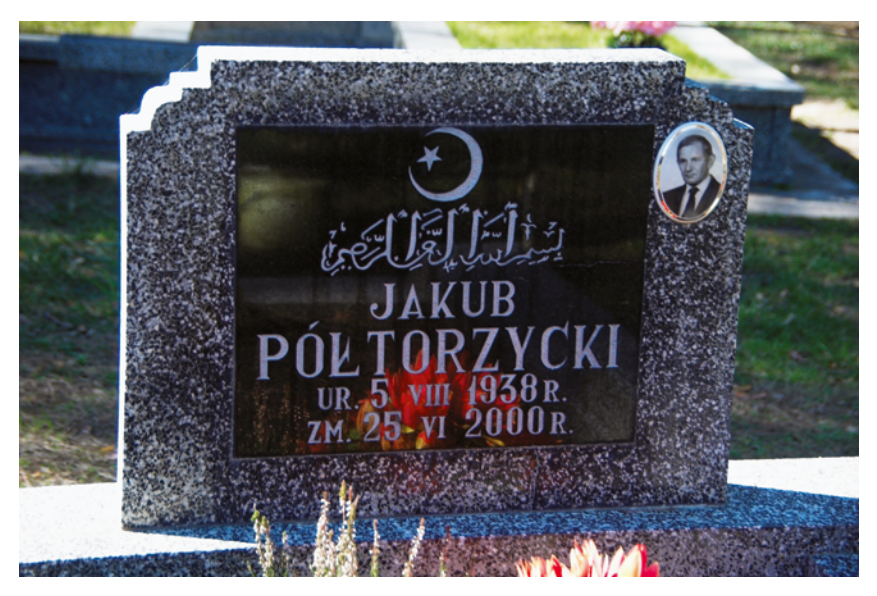
FIGURE 5.16 Kruszyniany – grave of a Muslim Tatar NALBORCZYK