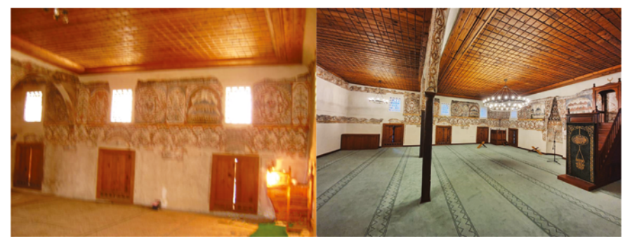
FIGURE 6.23 Inner image of north-east wall in 2005 (left) and after restoration in 2021 (right-KMSH)