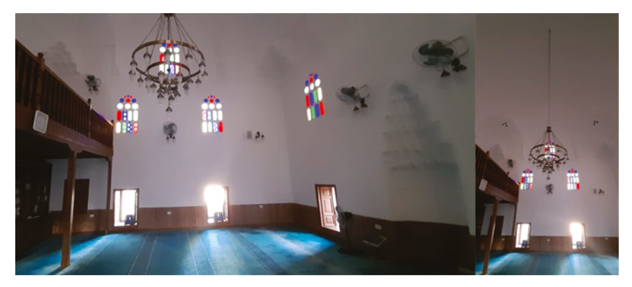
FIGURE 6.7 Interior of the Naziresha mosque after the restoration in 2021 (Manahasa)