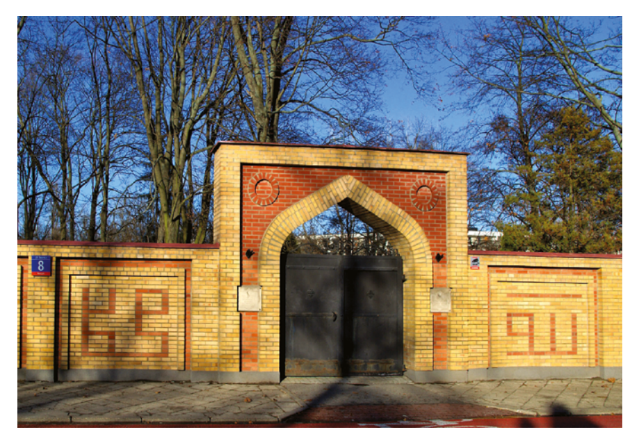
FIGURE 5.8 The Tatar Cemetery in Warsaw (est. 1867) – main gate NALBORCZYK