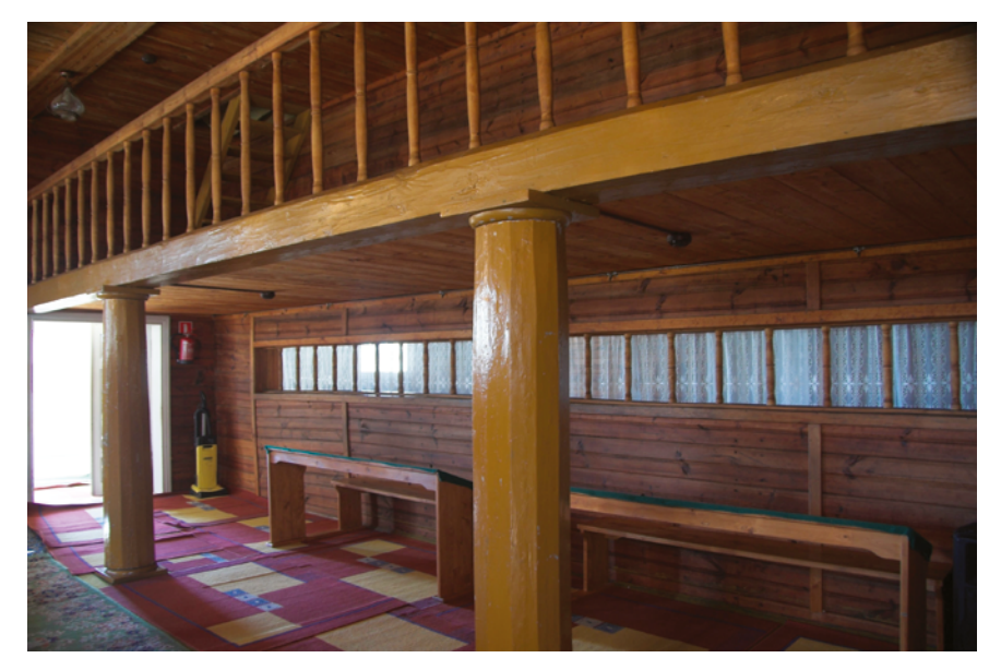
FIGURE 5.3 Kruszyniany – the place for women – babiniec NALBORCZYK