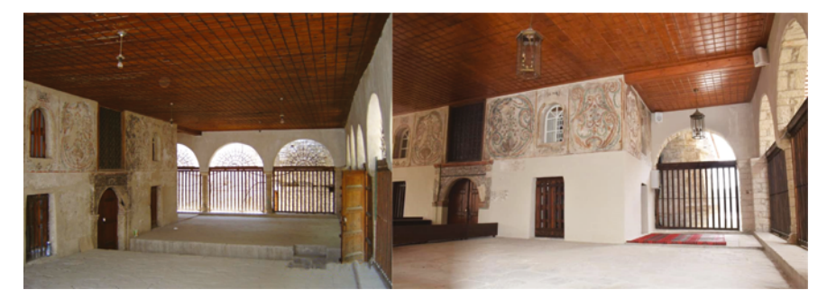
FIGURE 6.24 Last prayer hall in 2005 (left) and after restoration (right-KMSH)