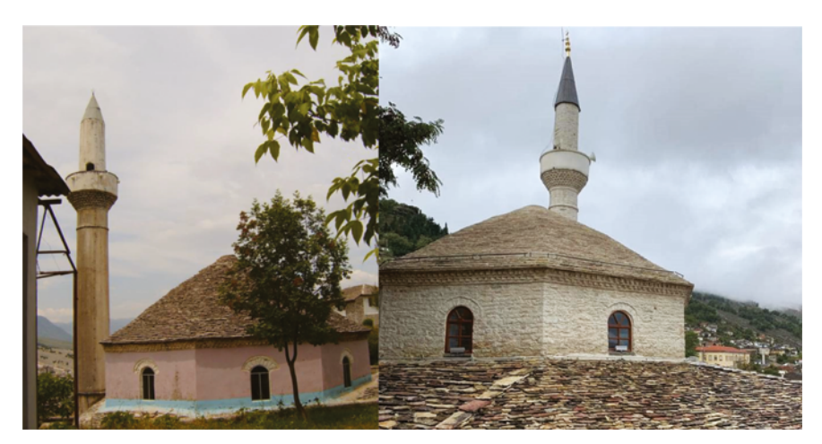
FIGURE 6.29 The stone slates on the dome in 2005 (left- Manahasa) and precisely rectangular stones on the dome after restoration (right-KMSH)