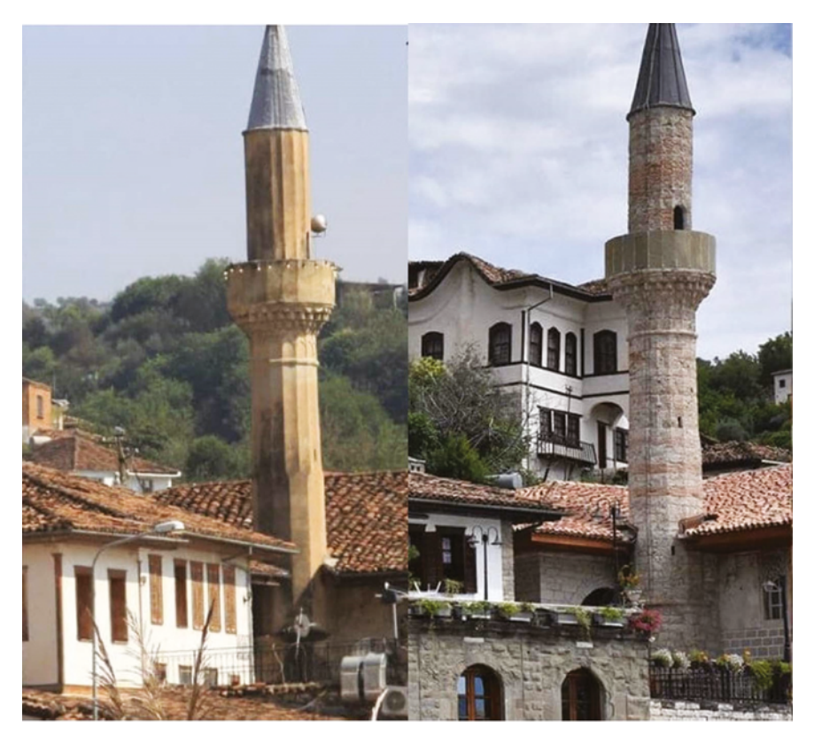
FIGURE 6.26 Minaret of Mosque of Beqareve before (left) and after restoration (right-Joni Margjeka)