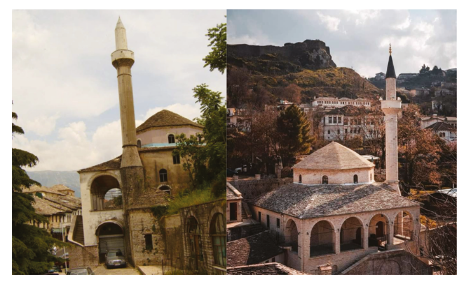
FIGURE 6.27 Image of Mosque of Bazar in Gjirokastra in 2005 (left) and after restoration 2021 (right)