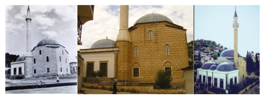
FIGURE 6.11 Lead mosque after 1978 restoration (left-Dashi) and an image of main prayer hall in 2005 (center-Manahasa) and (right) after the restoration 2018 (KMSH)

The interior has been painted in a lighter colour compared to the previous yellowish tone, making the space more serene and noble (Figure 6.11 – left and right). However, the new minbar and the pulpit are ordinary, probably imported from Turkey. The gypsum window frames are decorated with stained glass in cyan, pink, and purple. The lighting chandeliers are the same as those used in the previous mosques, but we must say that here it stands out better, due to the inner space's height. Overall, the interventions in this building are appropriate and balanced.