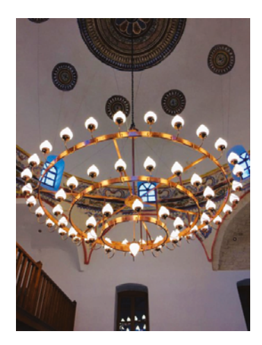
FIGURE 6.31 Painting decorations at the transitional part between squinches and dome after restoration in 2021 (KMSH)