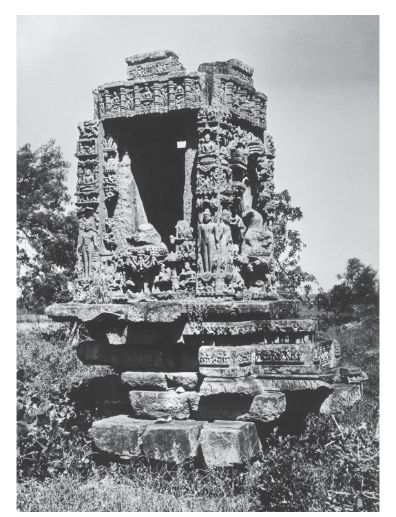
Figure 2.2 Jain shrine in Indore, Guna District, Madhya Pradesh.