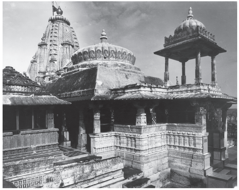
Figure 2.3 Sacciyā Mātā temple, Osian (1137–1138 CE).