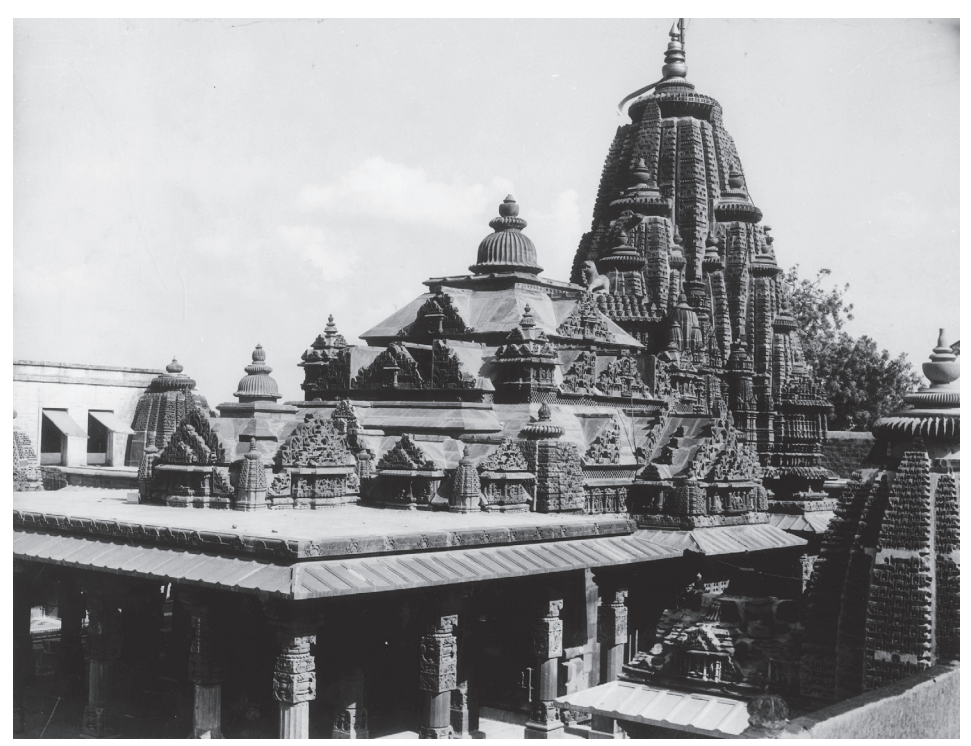
Figure 2.4 Mahāvīra temple, Osian (8th c. CE).

1972 'Plea': the study of Jain art should pay close attention to the demands of ritual and iconography. His geographical locus for this interest has consistently been Osian, especially the Sacciyā Mātā and Mahāvīra temples (Figure 2.4).