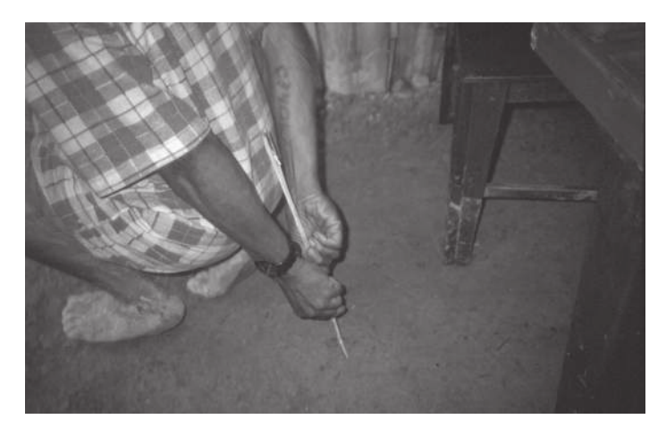
Figure 3. Doing ki'nye (sorcery)

However, this use of the "hind-face" gestalt is not just due to the fact that the anus is regarded as an exclusively evacuating/rejecting (i.e., inside > outside) orifice.<sup>10</sup> Unlike the frontal-genital zone that is coterminous with the upper head-face endowed with the two eyes and the mouthnose (these orifices are self-symmetrical in relation to the inside-outside projection, i.e., their dynamics is reversibleinside > outside > inside), the backside zone is eve-less. Accordingly, by facing something with one's behind one does not face the world with the receptive ocular surface but with the eyeless "hind-face" gestalt that does not look at, and therefore does not introject, its object. Unlike the mouth, the anus is exclusively a rejecting orifice and so the behind does not have a chance to introjectively selfidentify with such ocular equivalents as penis and hand. The human face, being oral and ocular, does so willy-nilly. That is why one may be compelled to close, cover, or avert the eyes when facing a repelling sight. Hind-face does not, for