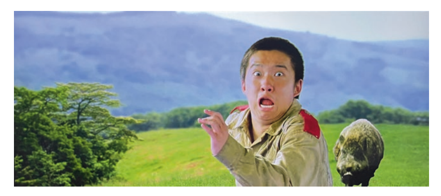
Image 1 Young North Korean soldier Taekgi chased by a wild boar, from "Welcome to Dongmakgol"

Strikingly, "Welcome to Dongmakgol" is one of two distinctly fantastic Korean War films released over the hallyu era, with the other being the newer and equally remarkable "Swing Kids". The recent appearance of two such works says a lot about the continuing, comprehensive, and exhaustive (and exhausting) presence of the Korean War up to the present day. Counting just those treatments from South Korea alone, over 20 films set in the Korean War have been released in theatres over the hallyu