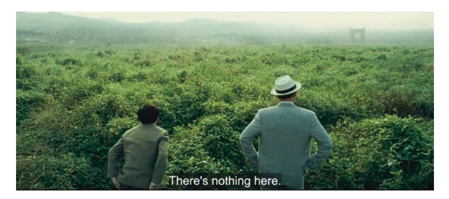
Image 2 The detective and his assistant looking at the neglected Independence Gate in a weedy field, from "Private Eye"