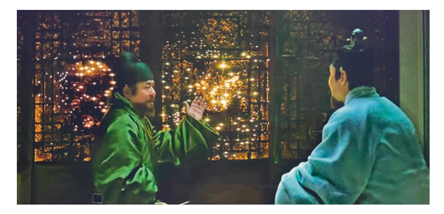
Image 3 Former slave Jang Yeong-sil showing a makeshift star chart to King Sejong the Great, from "Forbidden Dream"

eventually chooses to sacrifice his own work for the even greater cause of the new script, a concession that the king himself has to make as well.