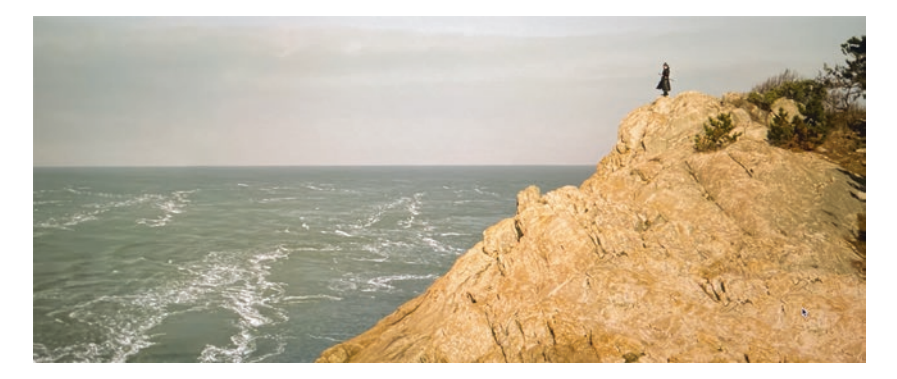
Image 1 Admiral Yi Sun-sin before the decisive battle in "The Admiral"

("Don't think that the land will be any safer!") in the scene in which he uttered his rallying cry about surviving only by seeking to die (at sea). The imposing array of Japanese ships, shown both down from the air and up from beneath the water's surface, underscores the impression that the storming of Korea was an invasion facilitated first and foremost by the waters. But it is also the sea, in scenes in both day and night, that stirs ominously in anticipation of being unleashed and channelled, through human guidance, in defence of Korea. In the extended final battle sequence, the overhead shots of ships jostling with each other and against the currents further accentuate the furiousness of this punitive nature, which swallows up enemy ships and combatants as if condemning them to the depths for their moral transgressions (Image 2). Among his individual heroics, then, Admiral Yi's most important role is as an usherer of fateful nature, the shamanic figure who activates the cosmic instruments of justice.