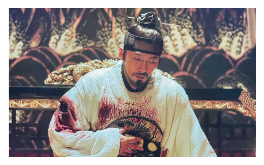
Image 2 An exhausted and bloodied King Jeongjo at the close of "The Fatal Encounter"