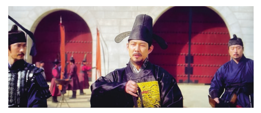
Image 1 "I wonder if that man knew his son would die in such a manner". Prince Suyang in "The Face Reader"

The prominence of this motif of fate and freedom in settings from the nation's past characterises recent South Korean historical films. Released over the hallyu ("Korean wave") era from the mid-1990s until 2020, they have not only carried a common concern with Korean history but also contributed to historical understanding and debate, even controversy, in South Korean society since democratisation in the late 1980s. As such, the balance of fate and freedom-or structure and agency, as well as cyclical and linear history-works as a universalistic concept and a symbol or plot device for illuminating past events, figures, and issues that, in turn, help in understanding Korea today. The presence of the past in the present (and future), as well as the reverse-the constant projection of contemporary concerns into cinematic depictions of the nation's history-marks these films in ways large and small, and the best of the works expansively. "The Face Reader" (Gwansang ["Face reading" or "Physiognomy"]; Han Jaerim, 2013), for example, deploys this theme also to spotlight the injustices suffered by common people, like the eponymous prognosticator or his son, who get entangled in treacherous court politics. Hence, the motivic tension between fate and freedom highlights the inequities of social