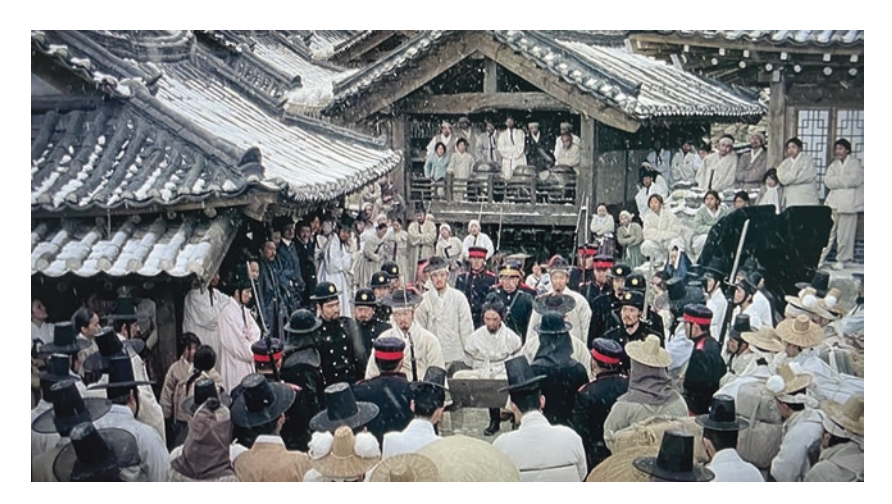
Image 3 Jeon Bong-jun, captured leader of the Donghak movement, being paraded through the streets of Seoul in 1894, from "Chihwaseon"