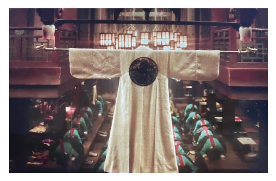
Image 1 Palace servants bowing before the gown of King Yeongjo in "The Fatal Encounter"