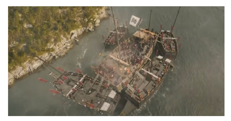
Image 2 The Koreans' command ship surrounded by Japanese ships in "The Admiral"

tells his son at the close of the film in a denouement dialogue, the efforts of the people saved both him and the country, including through their unstinting efforts in the Battle of Myeongnyang: The people themselves determined their collective fate. As the final naval sequence showed, they sacrificed their lives to enable victory, exceeded their reservoirs of stamina and strength in manning the Korean ships, and cheered unstinting encouragement from the shore. Among those showing such support was a mute woman who summoned the capacity to shout warnings, thus representing the hitherto voiceless masses finally being given a chance to roar their faithfulness to the collective. This determination to share the credit, as expressed by the admiral himself no less, feels a bit forced—as he clearly is the nearly super-human character at the centre of the film—but it testifies to the pull of modern populist sentiment as well as of the traditionally transmitted narratives.