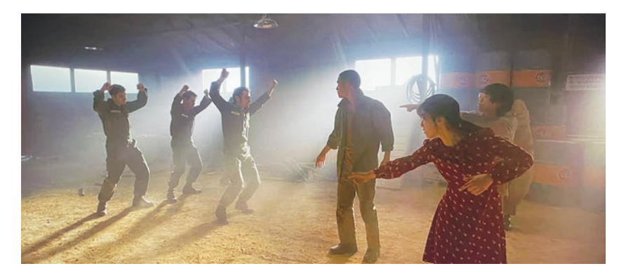
Image 4 Fantasy sequence of a dance-off between American soldiers and members of the POW camp's dance troupe in "Swing Kids"

young woman character tells Jackson at one point, her dancing boots are "magic shoes": "When I wear them, war, food, miserable things, they all just disappear". Other items do something similar—sticks and canes originally used as weapons being turned into performance accessories (more examples of lemons made into lemonade). A dance gesture like this, as "Swing Kids" shows repeatedly, can overcome barriers to communication and understanding by serving as a universal medium, a language all its own, in order to pursue happiness, establish connections, and mediate conflict. The most fantastic moment in this regard is the outbreak of a dance-off between the prisoner team and belligerent American soldiers in a scene straight out of Westside Story (Image 4).