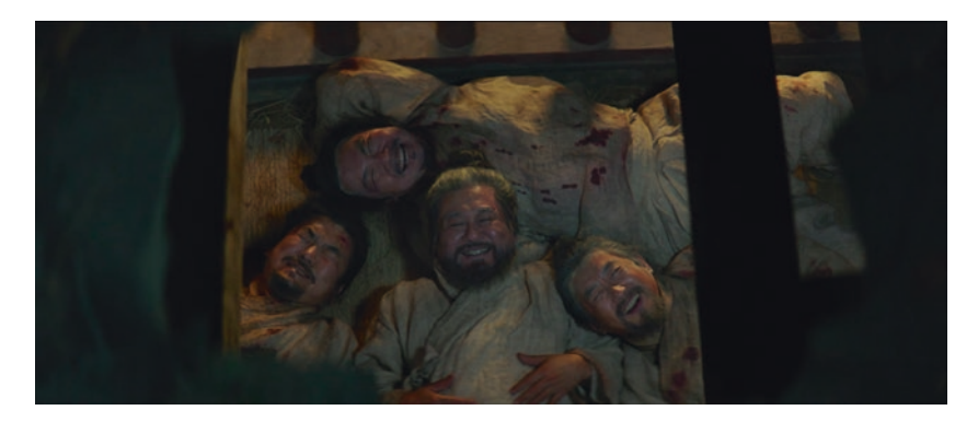
Image 2 Jang Yeong-sil and fellow prisoners looking up at the nighttime sky through a hole in the jail's roof, from "Forbidden Dream"