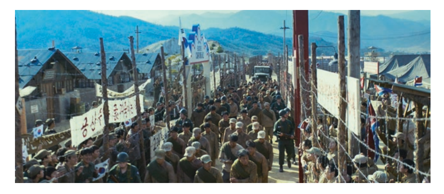
Image 3 New prisoners entering the Geoje Island POW camp in the Korean War, in "Swing Kids"

a few short scenes in the neighbouring area) is filled out by the interiors, including scrap-metal buildings in which a few prisoners on the "procommunist" side could infiltrate the "anti-communist" areas that included the American soldiers.