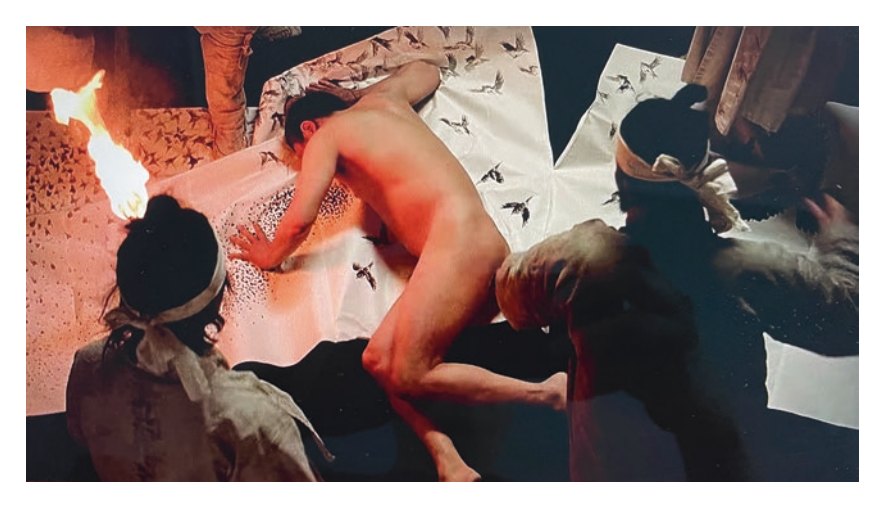
Image 4 The painter Jang Seung-eop caught in the Donghak Uprising of 1894, in "Chihwaseon"