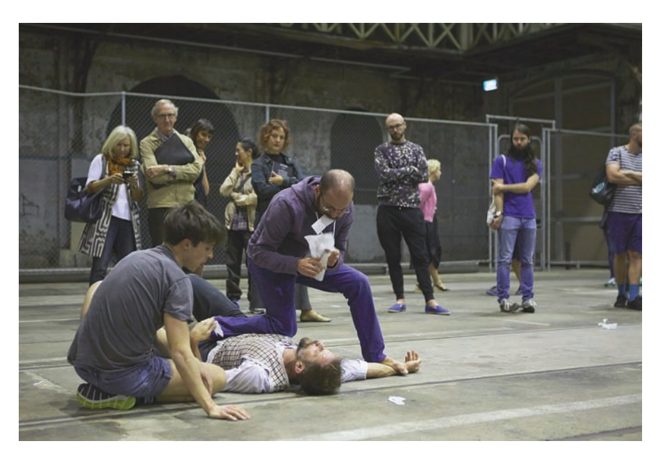
Boris Charmatz manger, 2014. Choreography: Boris Charmatz. Performance, 60 mins (19 March 2016) presented at Carriageworks for the 20th Biennale of Sydney. Courtesy the artist.