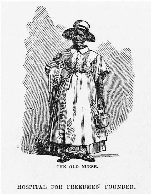
FIGURE 2.6 Illustration captioned “The Old Nurse,” portraying an aged Black woman at New Bern who nursed a Black smallpox patient when no white physician or attendant was willing. The drawing was included in Vincent Colyer [Superintendent of the Poor under General Burnside], Report of the Services Rendered by the Freed People to the United States Army, in North Carolina, in the Spring of 1862, after the Battle of Newbern (New York: Vincent Colyer, 1864), 41.

a very fortuitous claim, on us, though they have a very certain one on the Government. Would to God that it were met.” 92 The commission also applied this policy in Norfolk, where it had “given satisfaction.” 93