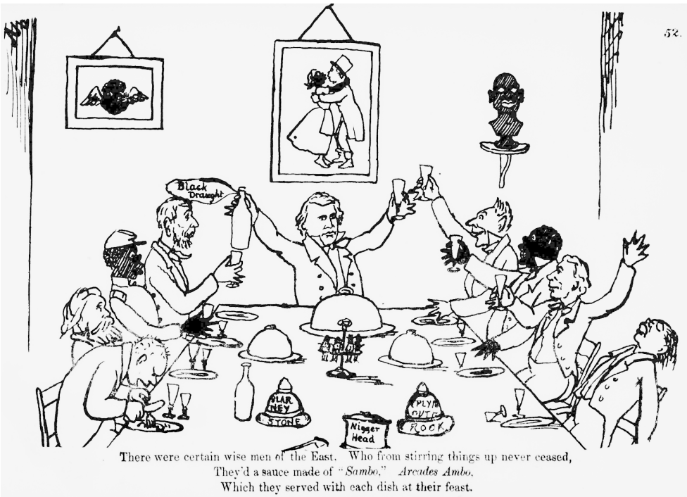
FIGURE 2.2 One of several cartoons focused on the racial politics of the war included in a collection sold for the benefit of a U.S. Sanitary Commission fair. With Charles Sumner at the head of the table, it appears to poke fun at the allegedly radical racial politics of eastern Republicans—from whom the commission drew several members. “There were certain wise men of the East. Who from stirring things up never ceased, They’d a sauce made of Sambo, Arcades Ambo. Which they served with each dish at their feast.” Illustration by William Emlen Cresson, from The Book of Bubbles, A Contribution to the New York Fair, in Aid of the Sanitary Commission, New York, March, 1864 (New York: Endicott & Co., 1864), 52.

Detroit Ladies’ Freedmen’s Relief and Educational Society noted, the Chicago freedmen’s fair had “originated with the white ladies assisted by the colored”; they, by contrast, proposed a fair that would “originate with ourselves, and we will be assisted by some of the first white ladies of this city” (my emphasis). 29 In these and nearly every form of participation in USSC work, white women’s exclusion of Black women was very rarely acknowledged or openly discussed, obscuring their exclusion of Black women in the historical record.