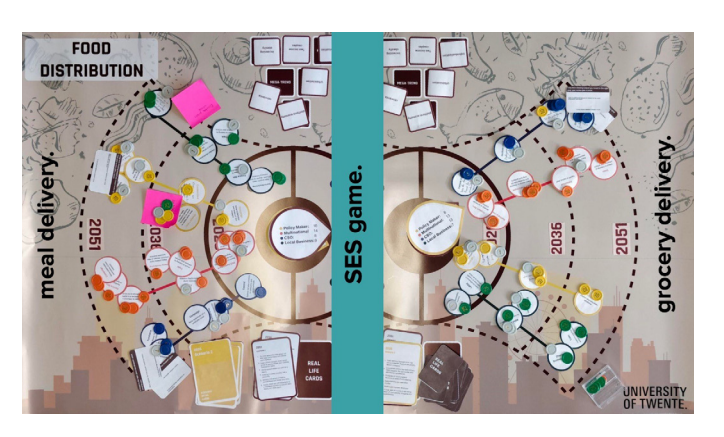
Figure 3. SES game board at the end of a game.

themselves, using their design knowledge, to make a design set into this future.