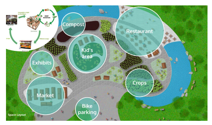
Figure 4. "Lokaal is Lekker" design.

The students chose to focus on the future of Nutrition and Health for adults in the Netherlands. The focal issue was then