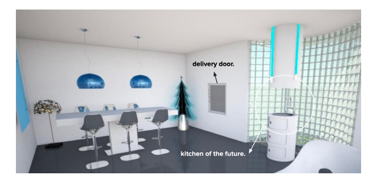
Figure 5. design of "Kitchen of the Future"

They chose one of the four scenarios they developed in the course as their future context. In this scenario, today's platform economy, where restaurants offer meals through a delivery platform, becomes the norm. Positioning themselves as a commodity for every family, these restaurants minimise end-consumer cooking effort while trying to preserve family-style dinners by offering family meal options. Citizens, in this scenario, put emphasis on convenience and are universally accepting of this new system. Everyday food has been indus-