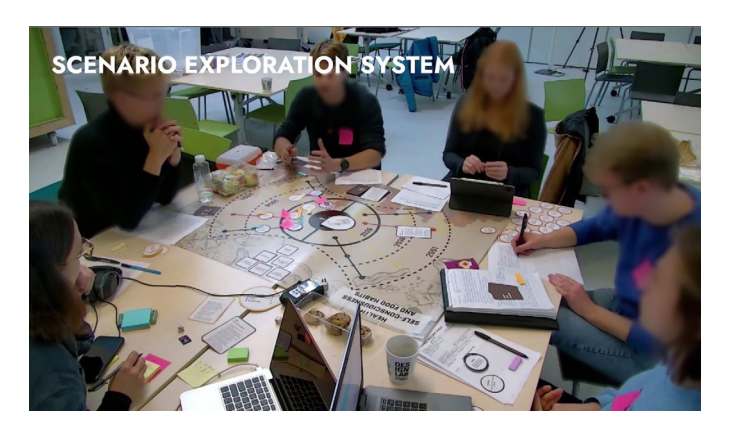
Figure 2. SES game in process.

Directly after the game itself see Figure 3, a short facilitated reflective session was held per group. Making sure to summarise thoughts and get some discussion going about the long session. Events and actions taken in the game were reflected on, answering questions like: How diverse groups of people would feel during the scenario's playing out? Was this a desirable future? What could design do to influence this future, or the road towards it? In the final phase, it was up to the groups