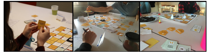
Figure 2. From left to right, captures from game playing session from workshops 1, 2 and 3

The game-playing session (Figure 2) was based on playing the board game prototype to test it. The participants started by randomly choosing their characters and playing the game based on the rules.