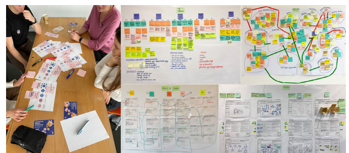
Figure 2. Transition Design Workshop in Prague.

Stakeholder Relations, Historical Evolution of Wicked Problem, Future Visions and Designing System Interventions (transition framework and design strategies) will be constructed based on the analysis of wicked problem. The AFCC transition framework and strategies will be driven by the future vision, and proposed by combining the Age-Friendly