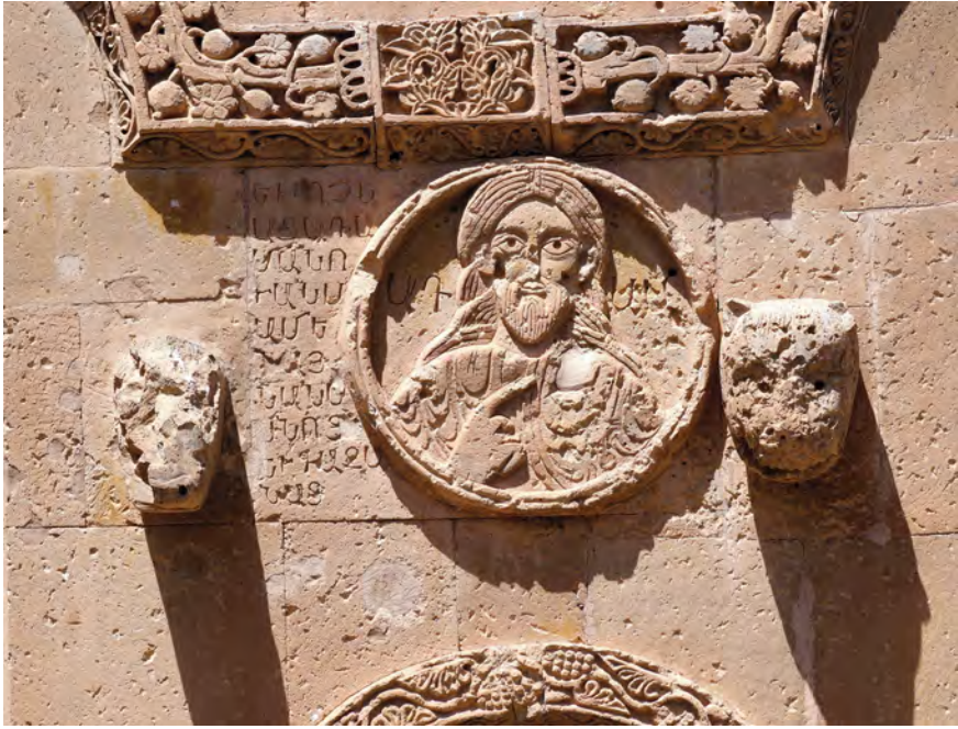
FIGURE 3.4 Adam (Gen 2:20), Surb Xac' (Holy Cross) Church in Alt'amar, 915–921, east façade, architect Manuēl

FEBRUARY 2015