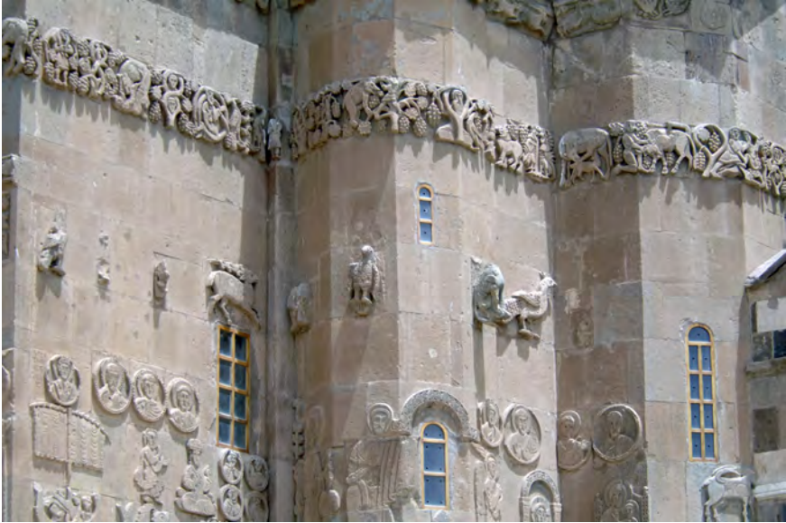
FIGURE 19.1 Church of the Holy Cross at Alt'amar (915–921), south façade

The analysis of the cycles of the patriarchs Abraham and Isaac, as well as that of King David, has shown that the biblical episodes represented in the vine frieze are interpreted christologically; they prefigure the coming of Christ, “the true vine” (John 15:1–7) and convey a messianic message. These scenes require a complex interpretation, because their meaning is expressed in the terms of a symbolic, even cryptic, language, drawing at the same time both from Scripture and from apocryphal writings, together with a profound knowledge of the great exegetes of the Bible. The cycle of the patriarch Jacob takes its place among the Old Testament cycles and one scene of the Jacob cycle is the subject of this article.