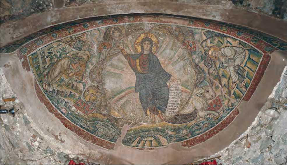
FIGURE 1.2 Mosaic of Christ in the Vision of Ezekiel, apse of Hosios David/Moni Latomou, Thessaloniki, 425–450. Eastmond—Hatzaki 2017, Figure 35 (page 79)