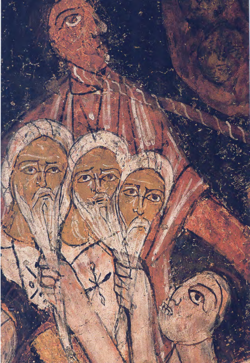
FIGURE 19.5 A demon is pulling the beard of three ecclesiastics in Hades. Fresco of the Karsı kilise, Güleşir, Cappadocia (13th c.), detail FROM: JOLIVET-LÉVY 2001