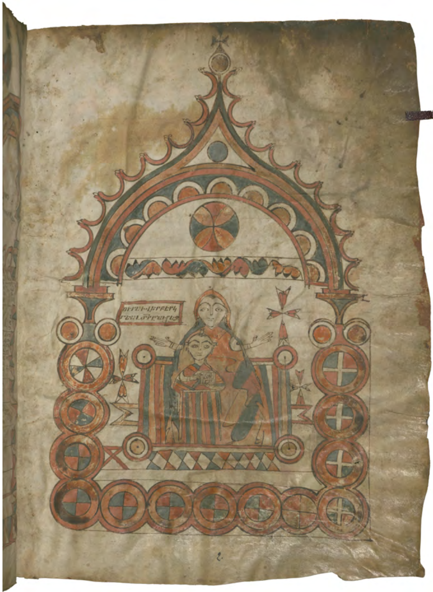
FIGURE 1.6 The wheels of Ezekiel's Vision at the corners of the Virgin's throne, The Virgin and Child Enthroned. Walters Armenian Gospel W 537, fol. 2 recto, 966