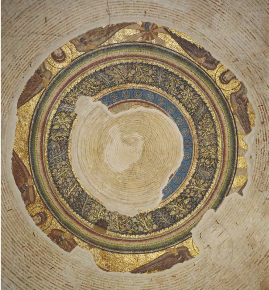
FIGURE 1.1 Mosaic of the medallion of Christ supported by four angels, Rotunda of Thessaloniki, 390s Killeirich—Torp 2017, Figure 38 (page 47)

gertips the four angels gingerly support a unique 360^\circ rainbow that encircles the representation of Christ with his right arm raised. In nature one never sees more than a fragment of a rainbow. The full circular mosaic rainbow that embraces the whole congregation below must be credited to the artists' imagination and it illustrates Ezekiel's "glory of the Lord" (Ezek 1:28). The charming human faces of the angels regard us with understanding and concern as they support the great golden wheel of the Lord. In Thessaloniki, the rainbow contains a garland of rich fruit, within which is an inner ring featuring 28 smaller gold wheels with black rims and spokes of gold. Though Killeirich and Torp see