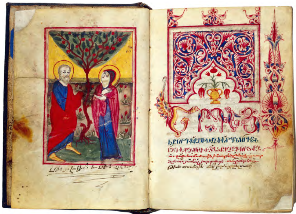
FIGURA 10.2 London, Wellcome Library, ms. 16586, ff. 2 v -3 r : i santi Gioacchino e Anna e, sulla destra, l'incipit dell'inno per la Natività di Maria

LICENCE: ATTRIBUTION 4.0 INTERNATIONAL (CC BY 4.0) HTTPS://WELLCOMECOLLECTION.ORG/WORKS/J4TG4DSP/ITEMS