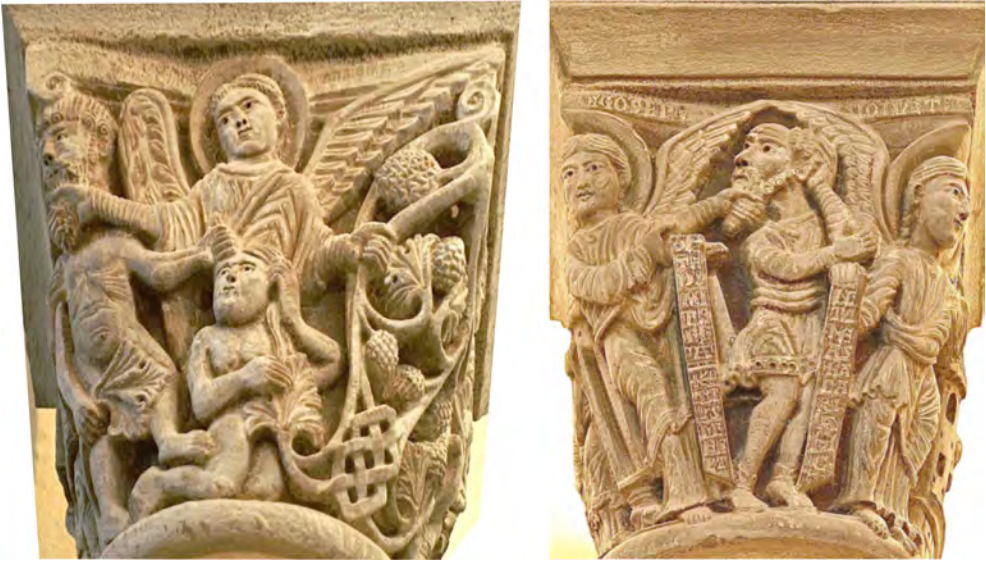
FIGURES 19.7A–B Capitals of the Basilica of the Notre-Dame-du-Port at Clermont-Ferrand, France (12th c.); a) The punishment of Adam and Eve; b) Appearance of the angel to Joseph (Matt 1:19)