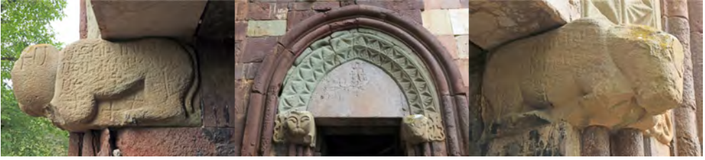
FIGURES 3.2A–C Western entrance of the gavit' of the Xoranašat Monastery, 13th century PHOTO BY AUTHOR, SEPTEMBER 2019

functions are easier to discern especially in those depictions which are accompanied with inscriptions, for they often ask for divine protection for those named in the text. In the 13th-century Xoranašat monastery, for example, two inscriptions are written on two beast sculptures, which also serve as capitals for the western entrance of the gavit' 27 (Figure 3.2). These texts are accompanied with small crosses placed below, in that way filling in the free space remaining on the beasts' bodies. The inscriptions on the two sculpted capitals depicting a lion and a horned animal read as follows, respectively: