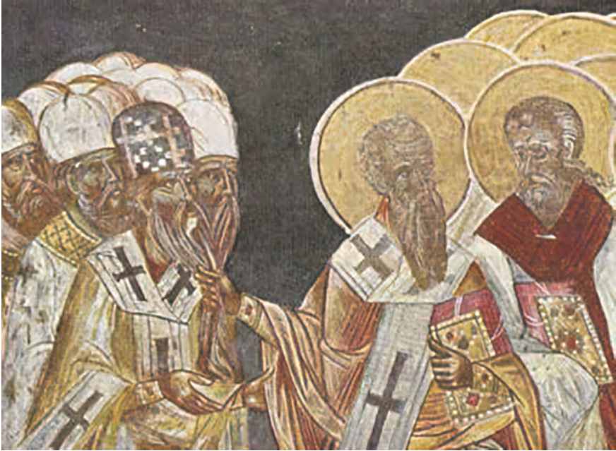
FIGURE 19.6 Council of Chalcedon. Fresco of the Church of Saints Peter and Paul in Veliko Tarnovo, Bulgaria (14th c.), detail FROM: FILOW 1919

ography occurs on Byzantine documents. The October Volume of the Menologium of Simeon Metaphrastes, copied at the beginning of the twelfth century, 72 contains initials with images, all devoted to the victory of the saints and martyrs over death. In this series, the initial of the life of Epimachos, represents him stamping on and pulling the beard of a defeated figure. 73