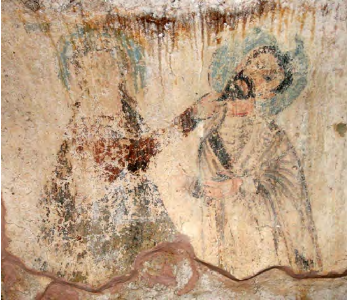
FIGURE 19.4 Christ and the Apostle John. Fresco of the Basilica of the Forty Martyrs in Saranda, ALBANIA (5TH–6TH CC.).

strength, but as a sign of relative position of the two figures, as in the texts cited above. Here are several examples of this theme in art.