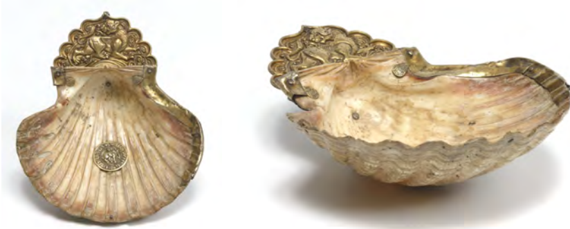
FIGURES 3.1A–B Šahuk's shell, Cilician Armenia, 13th–14th cc. Inv. no. ЧМ-1317

tion and the possible relevance of certain objects to pilgrimage practices are still largely understudied. This paper is an attempt to fill that gap and, because of the lack of previous approaches to Armenian pilgrimage art, it also faces a methodological challenge. Therefore, the reader should not be surprised that the terminology and comparanda used in this article will make use of Western examples and traditions, which have received more scholarly attention so far. This essay is a search for context, and I would like to dedicate it to Theo van Lint, whose work has enriched our understanding of Armenian culture and spirituality.