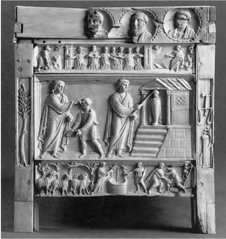
FIGURE 19.3 Reliquary from Brescia (4th c.), right side. The scene of Jacob's struggle is located in the lower frieze devoted to Jacob, at the right end

of God” or “Visible-form-of God” (Gen 32:31). 32 Like many commentaries, 33 a number of early Christian images follow this interpretation, of which the Brescia reliquary and the scene as given in the Vienna Genesis (6th century) are the