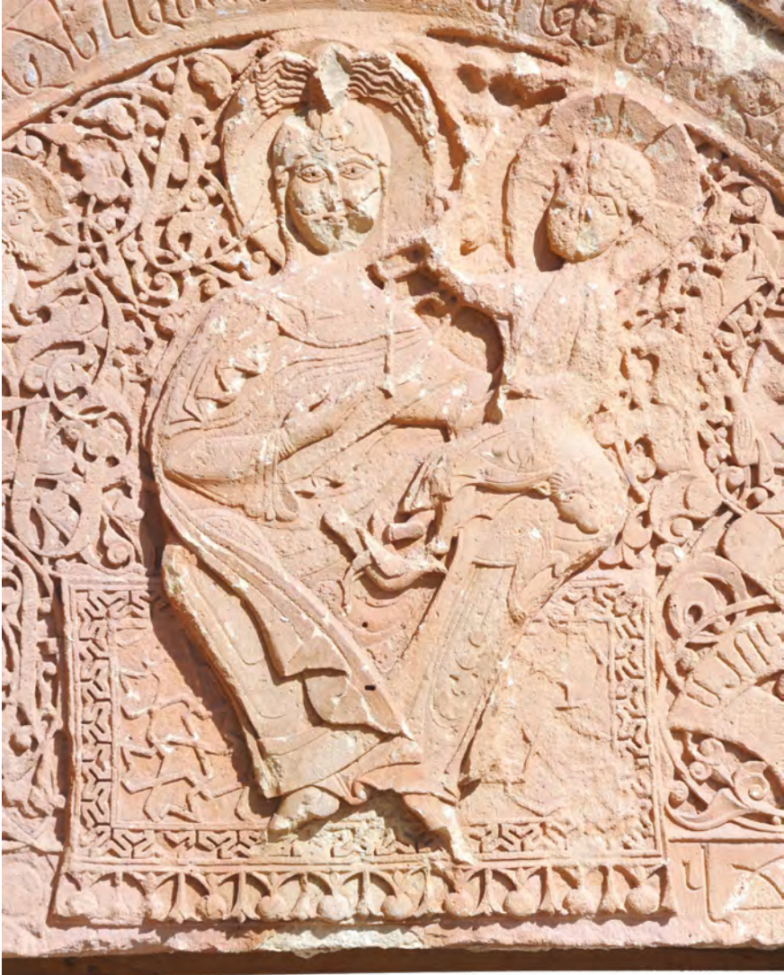
FIGURE 19.8 The Virgin and Child in majesty. Bas-relief on a tympanum on the monastery of Noravank', Armenia (14th c.), detail