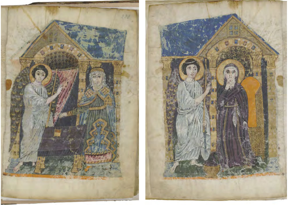
FIGURES 1.3–4 The angel Gabriel with wings of peacock feathers in the Annunciations to Zachariah and to Mary, Matenadaran 2374, fol. 229 r and 229 v , 6th century

COPYRIGHT: MATENADARAN MESROP MASHTOTS INSTITUTE OF ANCIENT MANUSCRIPTS