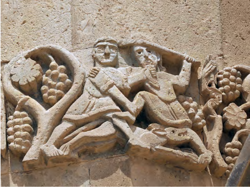
FIGURE 19.2 Jacob's Struggle. The vine frieze of the Church of the Holy Cross at Alt'amar

the right, is more dynamic, showing movement through his raised right leg and while waving a staff in his left hand. Between them is a dog which, with expressive movement, is biting Jacob's left leg (Figure 19.2). 11