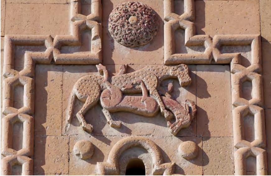
FIGURE 3.3 Surb Astuacacin (Holy Mother of God) Church in Ełvard, 1311–1321, east façade, architect Šahik.