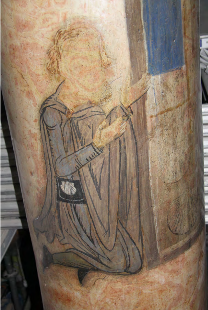
FIGURE 3.5 A Jacobean pilgrim, mural painting, ca. 1150, Nativity Church, Bethlehem PHOTO BY MICHELE BACCI, JUNE 2019