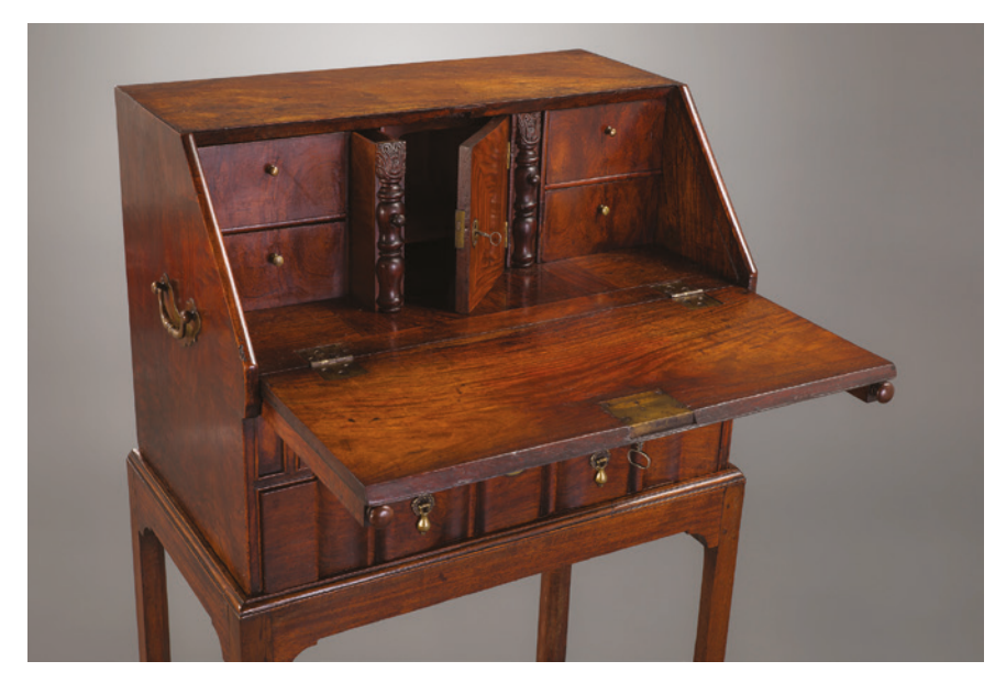
FIGURE 13 Interior view of the small padouk bureau. Chinese for the English market, c. 1730.

eye of the European viewer could admire their decoration (Figures 12 and 13). At the same time, the elevated position of often-inconspicuous writing boxes or nécessaires diverted the gaze from the signs and purpose of the objects' seafaring careers – for instance, the brass hinges at the sides by which they were carried. Larger pieces of furniture such as bookcases and writing desks were pragmatically composed of two pieces – thus facilitating their transport – that were retrospectively mounted on top of each other.