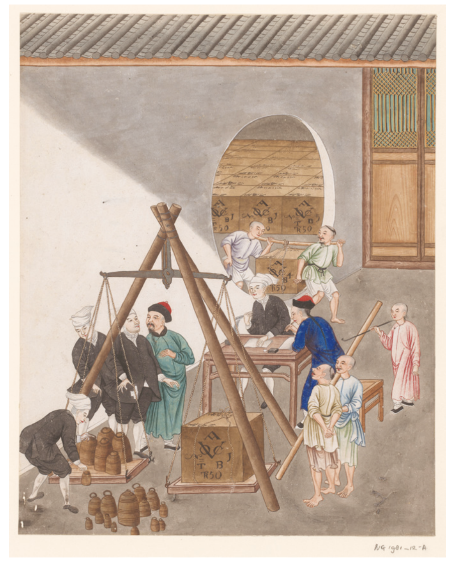
FIGURE 10 Determining the weight of the tea chests. Anonymous, Canton c. 1770. Watercolour on paper, 313 × 250 mm.

were carved, lacquered or otherwise embellished and could subsequently be sold on as furniture and decoration fit for travel and domestic display.<sup>101</sup>