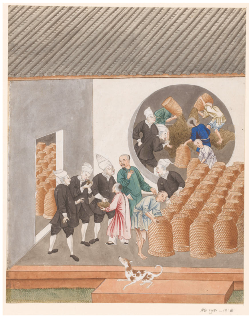
FIGURE 11 Sampling the tea. Anonymous, Canton c. 1770. Watercolour on paper, 313 \times 250 mm.

Furniture, of course, is in itself excellent for packaging more fragile goods such as prints, drawings, rolled-up wallpaper, painted mirrors, fans, woven silks and accessories of all sorts – as it is for hiding small things from the discerning eye