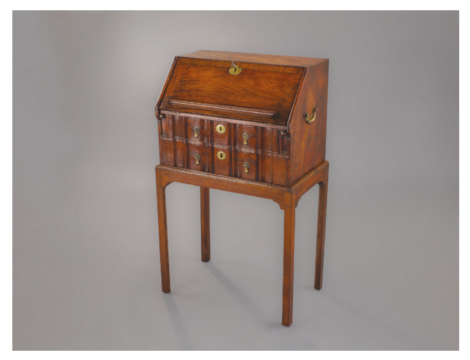
FIGURE 12 Small padouk bureau. Chinese for the English market, c. 1730. The stand, a later English addition, is mahogany and probably nineteenth century.

of customs officials and Company surveyors.<sup>102</sup> And if one looks at the dimensions and boxy designs of Chinese export furniture, its purpose as a temporary storage home for other merchandise is hardly concealed. Inside individual pieces of furniture, there were often numerous separate compartments, often lockable, that could protect smaller, and often high-value commodities from theft, official registration and curious eyes.