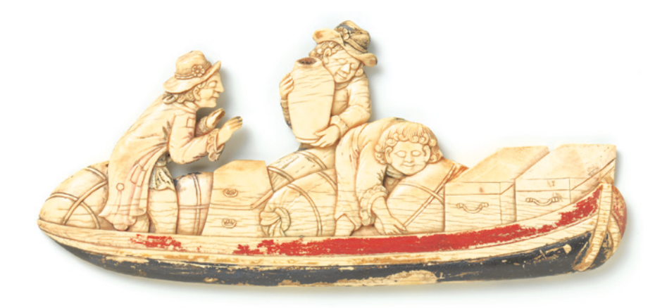
FIGURE 17 Three Dutchmen in a Sloop. Ivory carving, Canton, c. 1725–1750, 7 cm × 16 cm.

his attendant (to the extreme right) might mishandle his goods. The figure in the middle appears, instead, fully absorbed by the task of holding a single jar. No wonder – as he is standing in the midst of a tiny boat that would be rocked about by the smallest wave.