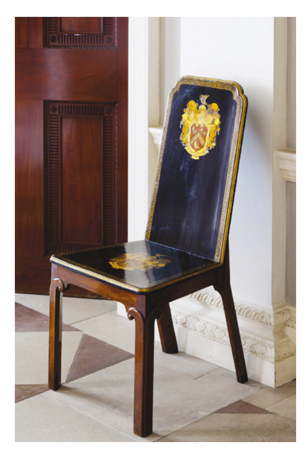
FIGURE 6 One of six lacquered hall chairs, part of a larger armorial set of 16 items with the Child coat of arms, on display at Osterley.

In return, they were able to use these personal ties to commission objects that were clearly different in both quality and originality from pieces that would be sold at the EIC auctions (Figure 7).<sup>59</sup>