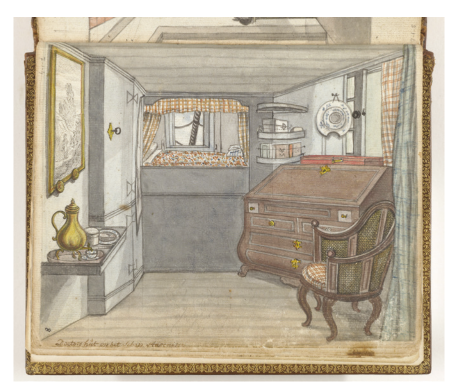
FIGURE 16 Hut van de chirurgijn op het voc-schip de Stavenisse. Jan Brandes, 1785/86. Brush, 155 mm × 195 mm.

and commissions, for which they did not have to pay any duties to the employing Company.<sup>115</sup> To illuminate the ways in which travelling furniture and space were used during the voyage, we now turn to the cabins of the Canton traders.