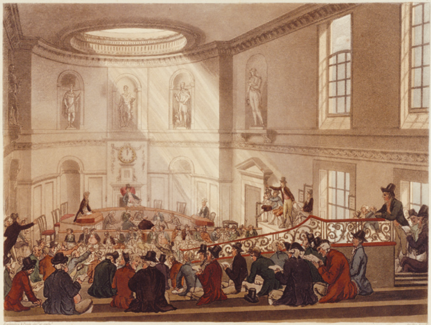
India House, London. The Sale Room, Plate 45 (1808). PU1361. Aquatint, coloured FIGURE 4

replied, stating that they 'did not mean that the Officers of the Customs should be the Judges of whether a lott be fairly Sold or not'.<sup>86</sup> Overall, there are surprisingly few formal complaints in the East India records that directly relate to methods of selling private-trade goods. What is clear from the cases we have, however, is that Company directors were reluctant to regulate the mechanisms of sale too closely. In this context, it is important to note that Company directors were anything but disinterested administrators. On the contrary, they were usually as involved in private trade as their employees.