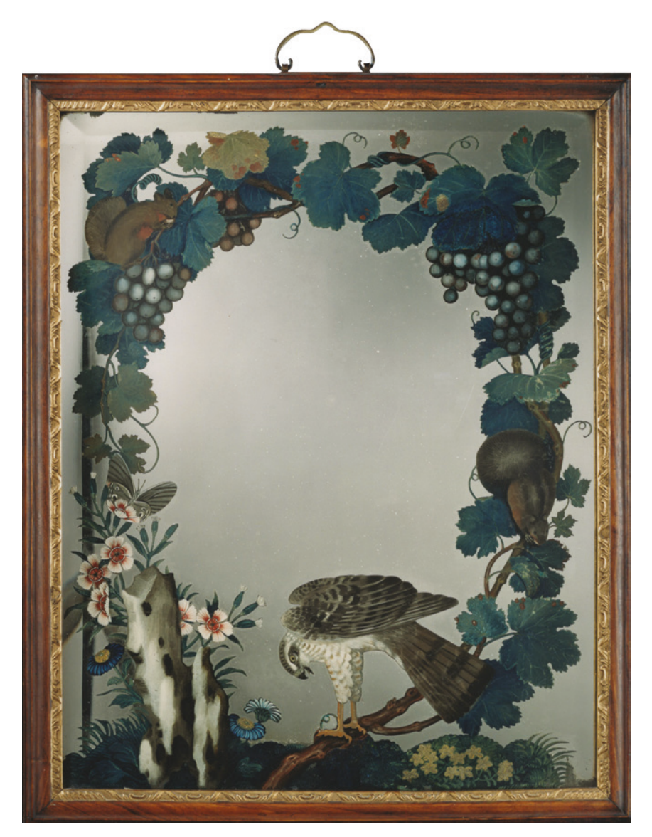
FIGURE 9 A Chinese export reverse mirror painting, c. 1750, in original hardwood and gilded Chinese frame. Height (with frame) 72.5 cm; width 59.7cm. Decorated with leaves, butterflies and two squirrels eating grapes or nuts