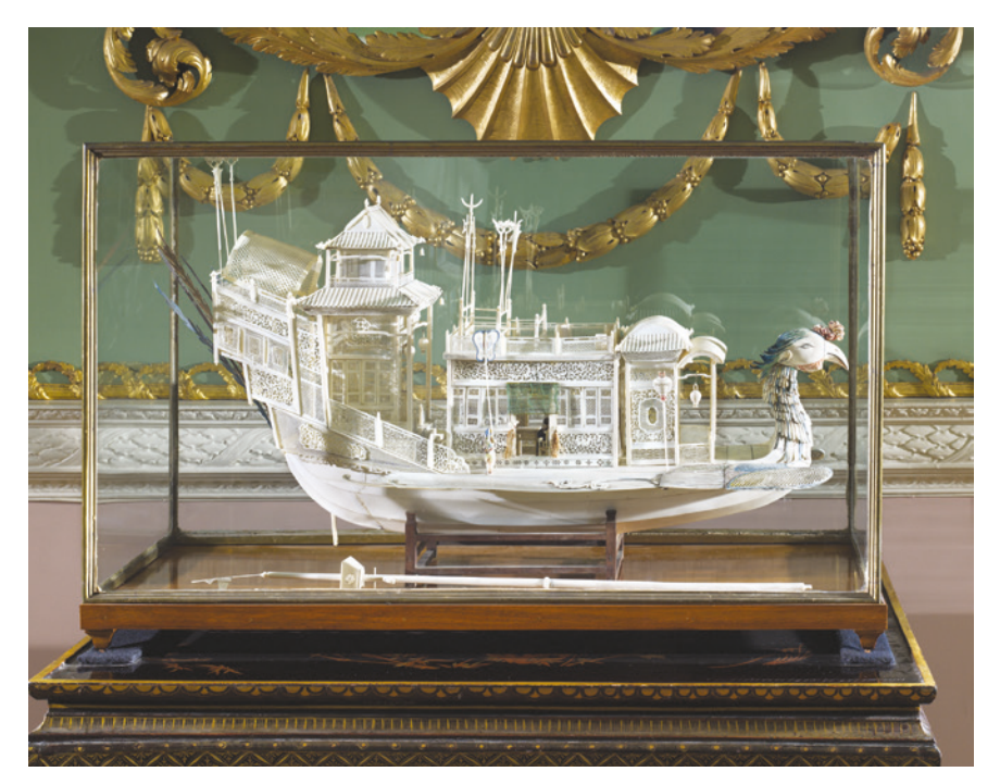
FIGURE 7 Model in ivory of a Chinese pleasure barge, mid-eighteenth century, Chinese export

sources, we learn that Captain Robert Hudson went out in 1724–1725 to navigate the Macclesfield to Canton. According to EIC records, he brought back the conspicuously large cargo of '2 Japan Escrutores, 2 Japan Screens', one box with 'Dressing Boxes' ( nécessaires ), ten cases 'lacquered trunks', two cases of 'lacquered chests', and an additional two cases with 'lacquered screens'.<sup>60</sup> This quantity of lacquerware on account of a single merchant is unusual not only in comparison to most of his peers, who often brought home a single box of lacquerware. Rather, if we look at the private cargo of Hudson's next voyage as commander of the Macclesfield in 1727–1729, we see that this time he contented himself with investment in a single box of Japanware and two lacquered writing desks. This might reasonably be seen as an indicator that he had taken on a large commission for lacquered furniture on his previous journey and did not usually specialise in speculative purchases of fine furniture.<sup>61</sup>