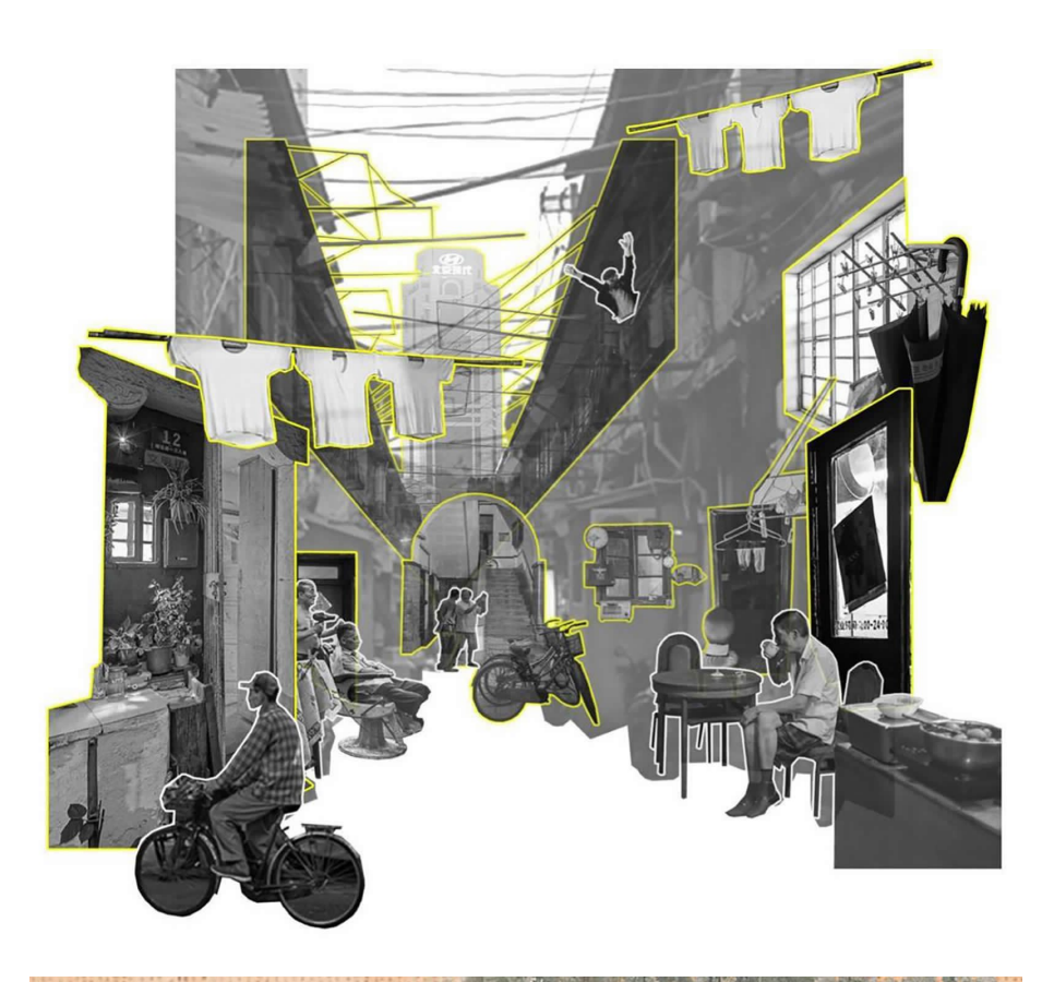
Fig. 1. Yongjia Road Youth Shared Space Design, 2021. Courtesy of Greyspace Architecture Design Studio.