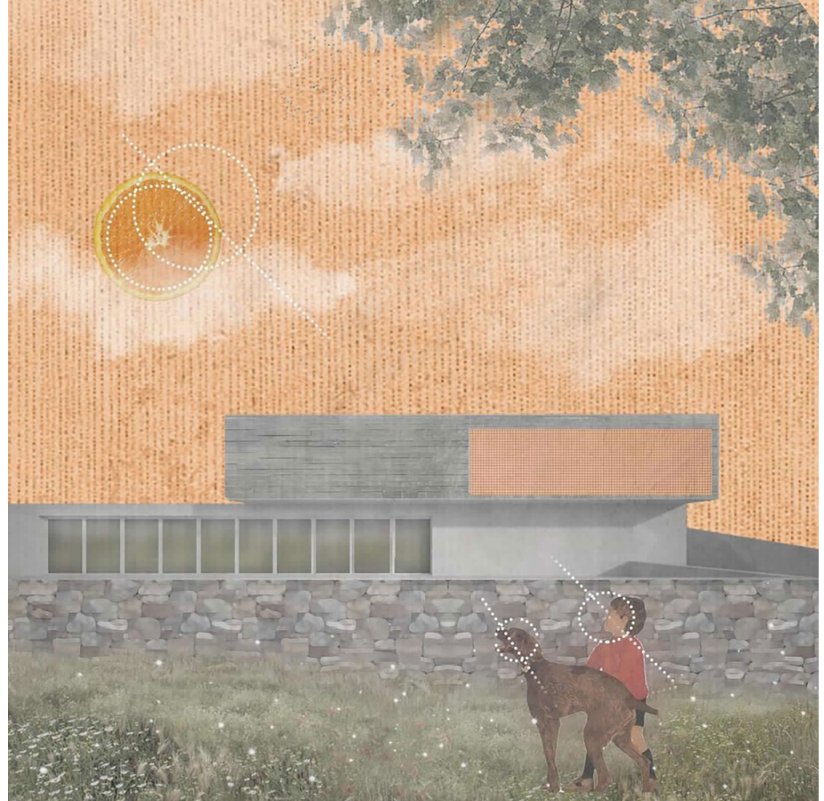
Fig. 2. Orange house , 2020. Courtesy of Studio Guilherme Torres.

Fig. 1. Yongjia Road Youth Shared Space Design, 2021. Courtesy of Greyspace Architecture Design Studio.