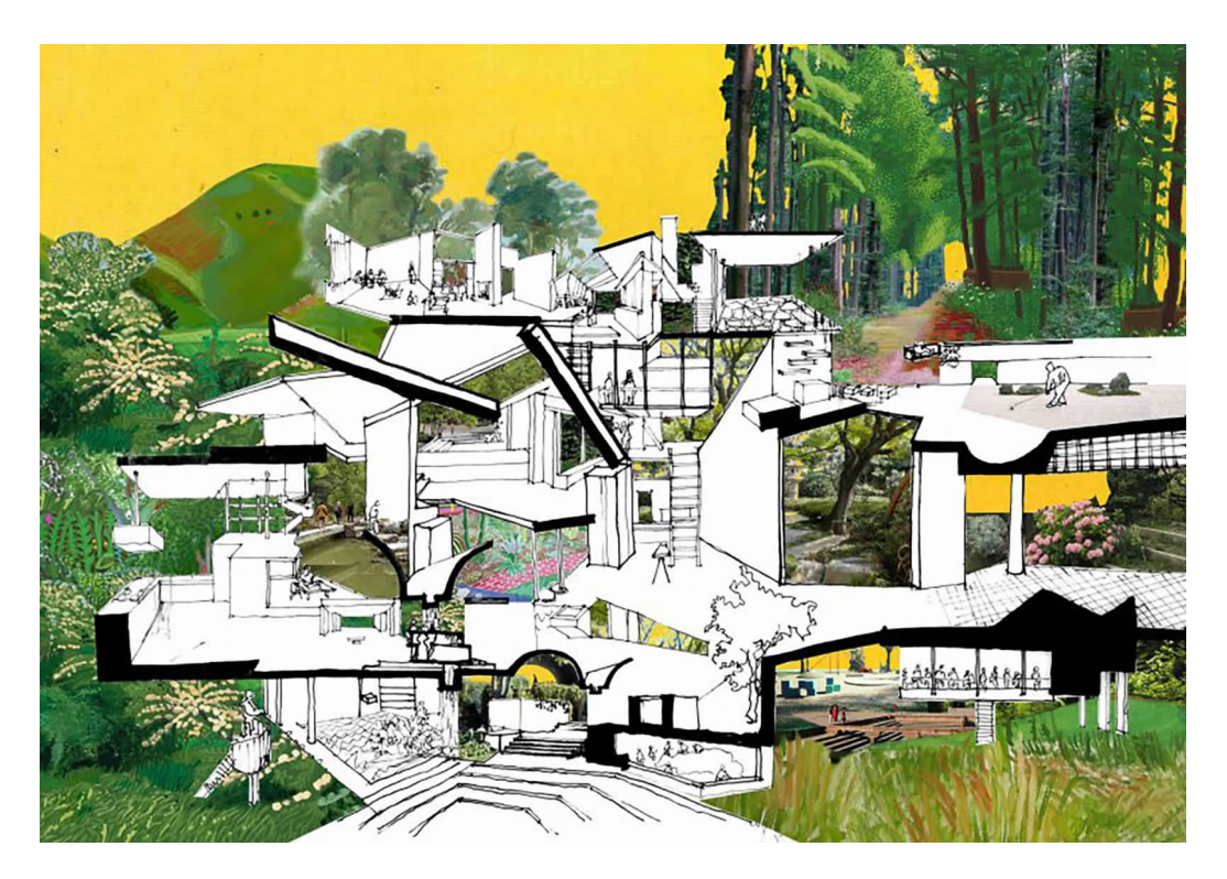
Fig. 8. Ways of Life conceptual collage.

nique, has the capacity to establish meaningful interactions with viewers, by suggesting to them a world of stories and possibilities. On occasions, this capacity can be lost in a photorealistic representation. Realism and narrative potential do not always go hand in hand. Non-realistic images pretend to involve the viewer in a more active way. Faced with a detailed rendering, the viewers are asked to become passively aware of the project as it is. Faced with a non-realistic post-digital image, viewers are invited to actively participate in the production of meaning. They have to fill in the gaps left by a deliberately open-ended representation, reflecting on messages and ideas hiding behind the image. Being open-ended, photo(un)realistic images can help in the early design stages, suggesting ever new directions; or when the project is finished, helping tell its story in all its narrative value. This approach is not intended to replace realistic renderings, which are and will remain useful tools. Rather, it aims to free architects from a naïve reliance on realistic images, which can reduce the design process to a matter of producing pretty pictures. There is more to architecture. Buildings tell stories; they have an emotional truth, as well as a visual one, that can best be communicated through images not constrained by a self-imposed resemblance to reality.