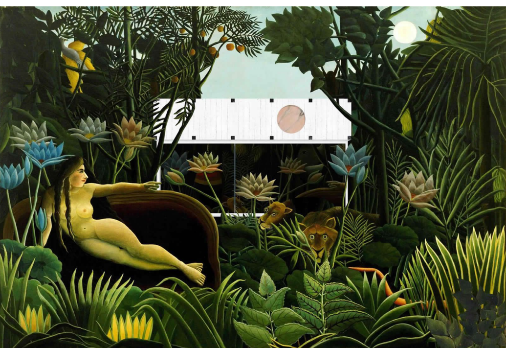
Fig. 7. Very Tiny Palace House, 2012. Courtesy of fala atelier.

Fig. 6. Reggio School, 2022. Courtesy of Andrés Jaque / Office for Political Innovation.