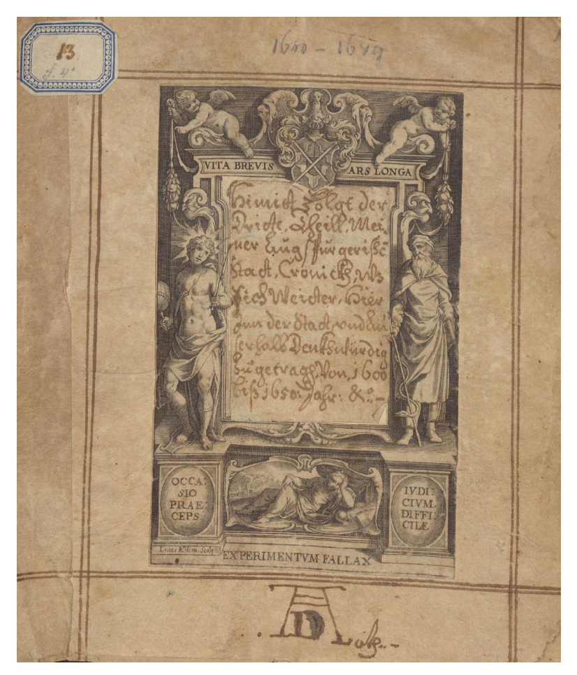
fig. 5 Lucas Kilian/Abraham Thelott: Title of t. 3 (Augsburg, Staatsund Stadtbibliothek, Thelott, Chronik, 4<sup>°</sup> Cod S 13, fol. 1r.)