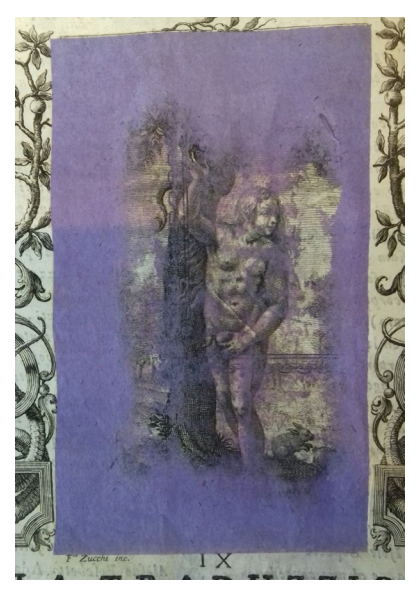
fig. 8 Modified headpiece, Il Paradiso perduto , 1742, [Biblioteca di San Francsco della vigna, Venezia, Shelfmark SMII G XI 086].

thin purple paper, in books I, VIII, IX, X and XII. But a later reader scratched the paper, without removing it, which had the effect of making the incriminated images visible again (fig. 8). It is likely, but it is only a hypothesis, to think that the first intervention dates from the entry of the book into the convent library, and the second from a reader who was intrigued by the veiled images that made seeing them more desirable and was unable to repress his libido videndi . I will conclude with these images of this copy, as in their current state, between veiling and unveiling, they seem to me to be emblematic witnesses to the circulation of Paradise Lost in the Veneto region in the 18<sup>th</sup> century.