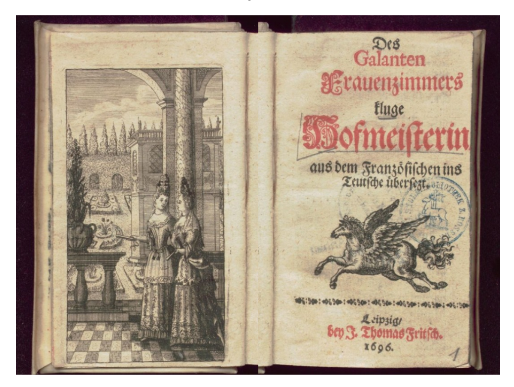
fig. 2 Leipzig 1696 – Leipzig 1711: Des Galanten Frauenzimmers kluge Hofmeisterin

sees the act of reading and reading matter as indispensable means of education is strikingly placed in the German title: " Vorbericht an den leser (Preface to the reader)".