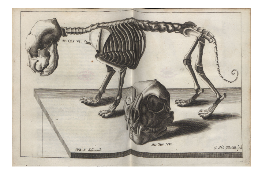
fig. 7 Johann Philipp Thelott: Anatomic illustration, Miscellanea Curiosa Medico-Physica Academiae Naturae Curiosorum, sive Ephemeridum Medico- Physicarum Germanicarum Curiosarum Annus Secundus, Jena, Esaias Fellgiebel, 1671, unpaginated, Observatio VI.

In 1652, four physicians founded the Academia Naturae Curiosorum in Schweinfurt, which called itself Academia Imperialis Leopoldina Naturae Curiosorum (Leopoldina) after the imperial privilege in 1687. Starting in 1670 it published its own journal under the title Miscellanea curiosa medico-physica Academiae Naturae Curiosorum [...], which was presented at the Frankfurt Easter Fair of the same year. After the Iournal des sçavans in Paris (1665) and the Philosophical Transactions of the Royal Society in London (1665), it is one of the oldest scientific journals and was the first periodical worldwide to focus on medicine and the natural sciences. The first volume appeared in 1670, and Joachim von Sandrart engraved the title and the portrait of the Academy's founder Johann Lorenz Bausch for