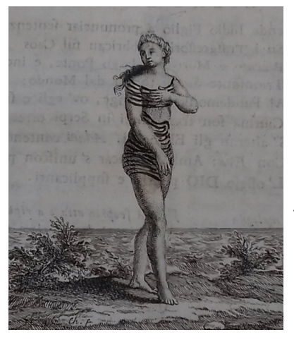
fig. 7 Modified tailpiece, Book IX, Il Paradiso perduto , 1742, [Biblioteca di San Francsco della vigna, Venezia, Shelfmark SMII G XI 086].

Only one image of female nudity has not been covered by a vignette, and that is the image of Venus at the end of Book IX. All that has been done is to cover her breasts and hips with wavy ink strokes. The final effect gives a most surprising impression, namely that she has been dressed in a swimming costume (fig. 7).