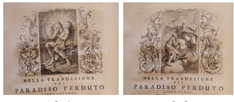
fig. 4 Headpiece, Book II, Il Paradiso perduto , 1742.

framed by foliage and flowers (fig. 3), while the figure in the second book, showing a grinning Satan, is framed by instruments of violence (saw, nail, hammer, chain, torch, knife, hook) (fig. 4).