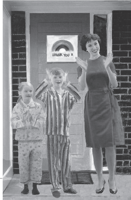
Figure 11.1 ‘Evening virtue signalling’ from ‘We do Lockdown’ published by Dung Beetle Books ©Miriam Elia 2020. Reproduced with permission.

By the fifth week of The Clapping, although people from ‘Black, Asian and Minority Ethnic’ backgrounds make up 21% of NHS workers, they were accounting for 63% of the 106 NHS staff reported to have died from COVID-19. Fully 95% of all doctors and consultants who had lost their lives in the UK at that point in the pandemic were from a ‘Black, Asian and Minority Ethnic’ background (Cook et al. 2020). Over twice as many doctors from ‘Black, Asian and Minority Ethnic’ backgrounds said they had faced shortages of or were using sub-standard personal protective equipment (PPE) compared to ‘White British’ colleagues, leaving some feeling like ‘sacrificial lambs.’ ‘There was one time when I was on-call, and I hadn’t been mask fitted yet ... but ... my senior was like “it doesn’t matter, can you just go and see the patient” ... I remember thinking this is really unsafe, I didn’t feel like I could speak up because I was very junior’ (Qureshi et al. 2022). While some lives during the pandemic were considered worthy of protection, others were stripped ‘of any political, ethical and human value.’ As the spectacle curates ‘who and what is human even though the physical body might still be in existence’ (Evans and Giroux 2015, p. 7), many had already been consigned to the realm of the ‘still living dead’ (Kear and Steinberg 1999, p. 172).