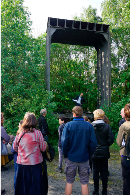
Remains of the old Britannia Bridge Structure, staging Balke calling colleagues to increase productivity (Bangor, 2019).

market advantage. At the same time, the title of the performance, The Redundancy , suggested a fatalistic premonition, given that academic life was marked by the absence of those who usually embody it. The suggested incorporeality of the academic workforce paradoxically made it possible to focus on the material conditions of academia, instead of supporting the assumption of academia as an intellectual occupation or immaterial vocation. The university building was staged as an installation of academic work, with some rooms and offices in their everyday shape, and with others re-arranged to host films or performance, or functioning as topical installations. Depending on how audiences engaged with the installations on offer, they would have seen embodied variations of working conditions, such as people shovelling horse manure in the pouring rain, 6 young academics running back and forth between their offices and the department's printer, the installation of a standing desk, or a theatre director physically agitated and angrily smashing his mobile phone on the ground. This arrangement linked pre-industrial forms of labour with the digital age and marked academia as a still relevant site of labour whose material conditions are performed and thus are sewn into the fabric of academic bodies and subjectivities.