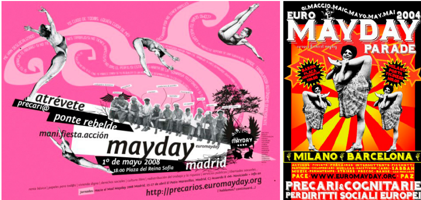
Posters for EuroMayDay demonstrations in Madrid, Milan and Barcelona.

at the beginning of the twenty-first century, traditional 1 May demonstrations stood for the nostalgia of a unionist past that had little to do with the present and that did not represent the situation of young people who had just entered the labour market. To some extent, the historically strong Spanish unions had lost legitimacy and support during the 1990s (partly because they were perceived as having allowed unemployment benefits cuts and the legalisation of temporary work agencies) and younger people, also wary of the unions' ties to political power, tended not to unionise (Casas-Cortés 2014, 207–209). According to Casas-Cortés, the EuroMayDay phenomenon introduced an element of ambiguity to the discourse on precariousness, criticising its negative consequences, but also showing some of its potential: “A series of emerging actors, texts, and interventions linked to EuroMayDay networks continued a resignification of precarity based on the logic of and, and, and ... (in the sense of Deleuze’s call for complex multiplicity rather than reductionist exclusion), clustering multiple and at times contradictory meanings” (2014, 210; emphasis in original). Indeed, until the last demonstration in 2011, EuroMayDay increased its ambitions: the poster for the demonstration in Madrid in 2008 mentions basic income, papers for everyone, decent housing, social rights, free culture, redistribution of work and wealth, public services and sexual freedoms as its demands.