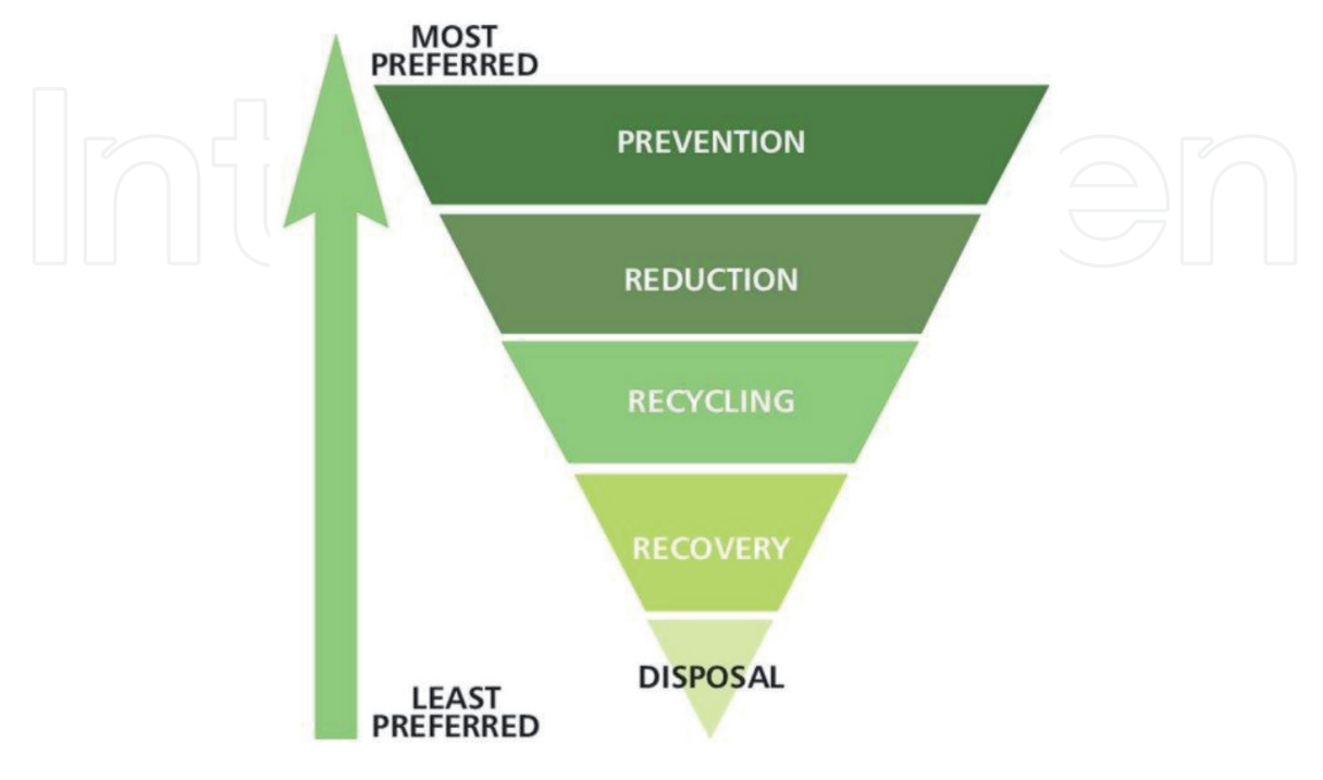
Figure 1. The waste management hierarchy.

The regulatory environment may differ significantly in each country, but it is important to mention the example of the European Union: the Water Framework