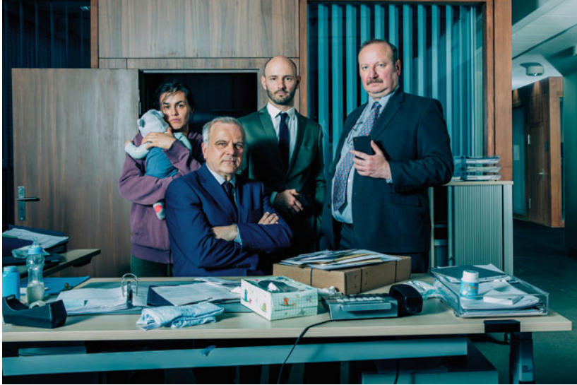
Fig. 4.1 Eichwald, MdB , a TV series from ZDF's Das kleine Fernsehspiel

the Norwegian tween series Lik meg/Like Me (NRK Super, 2018–) and follows the real-time approach of SKAM (NRK, 2015–2017) (see Sundet 2020) and its German adaptation DRUCK/SKAM Germany (Funk/ZDF, 2018–) (see Krauß and Stock 2021). The scenes and sequences that make up the full episodes first appear online as clips. However, as it is a children's programme, ECHT cannot integrate social media into its distribution in the same way SKAM and DRUCK can, and thus still relies on linear distribution on KiKA (see Krauß 2023d).