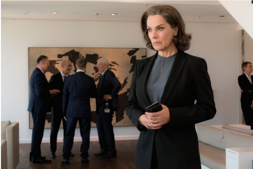
Fig. 5.1 Bad Banks, a German-Luxembourg financial thriller from ZDF and Arte

(2018), at the time of the interview head of fiction at the commercial channel Vox, spoke of certain “parameters” for co-produced procedurals such as Gone (Vox et al. 2017): “It should be very catchy [...], it has to be ‘case of the week’ structure, it can’t be too top-heavy in terms of premise, so it shouldn’t have three or more hooks”.