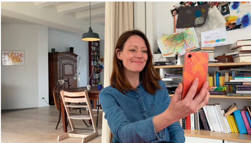
Fig. 3.2 An “instant” drama during the Covid-19 pandemic: Drinnen—Im Internet sind alle gleich .

Shows such as Drinnen point to a new flexibility in the commissioning editor’s work. However, the idea that editorial supervision could disappear completely, especially with the new transnational streaming platforms, public programme providers and smaller commercial stations with leaner structures, and that creative freedom automatically leads to more quality—a notion that has been circulating in the industry for a while—is increasingly turning out to be a pipe dream. On the one hand, my surveys found dismissive voices in the industry regarding critical failures such as the Amazon production You Are Wanted , which reportedly was made without editor input but nevertheless—or perhaps precisely because of this—developed an extremely complicated project network. On the other hand, Netflix and Amazon Prime Video are increasingly bringing experts in German-language fiction development in-house, including staff from public-service broadcasting, as evidenced by an editor for Das kleine Fernsehspiel (The Little Television Play) moving from ZDF to Netflix in 2018. Although long-time ZDF editor Lucas Schmidt left Netflix after just under a year (presumably due to a different corporate culture and