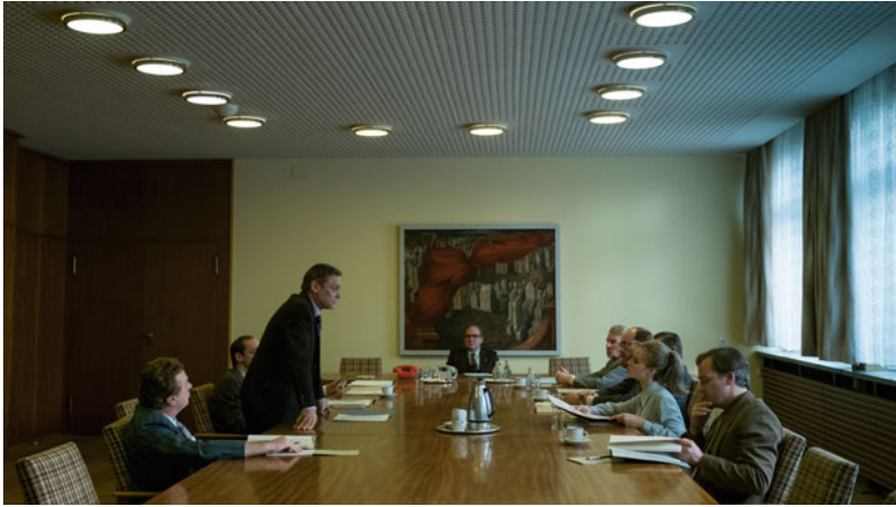
Fig. 6.2 Series export in a changing TV landscape—a still from the second-season Deutschland 86

Regardless of the actual licence payments made, the production of Deutschland 83 represented an innovation for TV drama exports in the German context—on the one hand because it reached the US market, which until then had been closed to German television fiction, and, on the other, because the US broadcast took place before the German one. The long-standing rule that a series must first succeed in the German market before being exported to other countries no longer seems compelling.