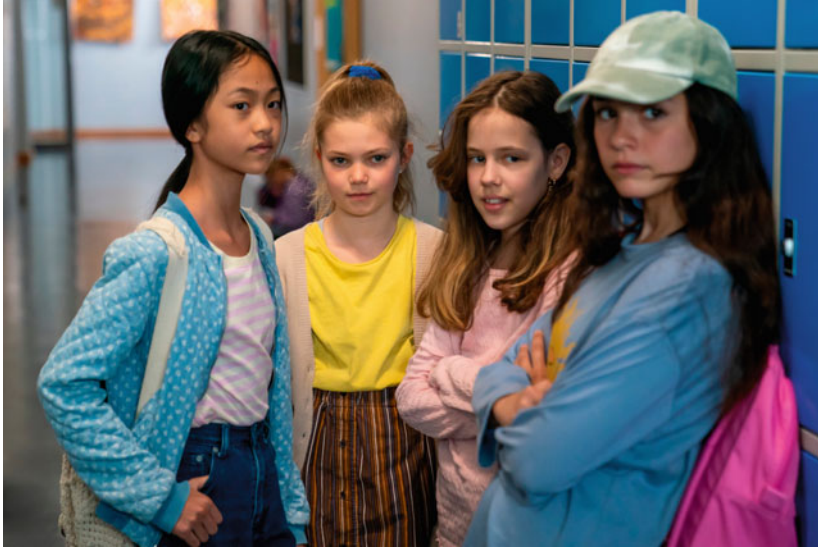
Fig. 4.2 ECHT , a preteen “real-time” drama

circulating on these external platforms. Instead of public-service principles, the few “GAFAM” corporations (Google, Apple, Facebook, Amazon and Microsoft) and TikTok shape its distribution.