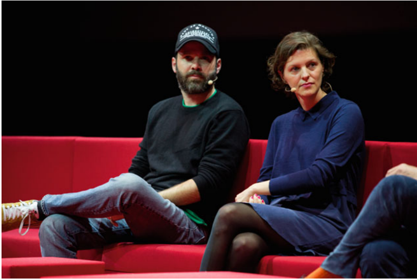
Fig. 5.2 Jantje Friese and Baran bo Odar, the creators of Dark and 1899 , at a Netflix panel in Paris, 2016

When I then asked Friese what role the production company behind Dark , Wiedemann and Berg, played under the “overall deal” conditions, she answered with a laugh that “time was up”, as if it were a sensitive issue, and then immediately followed up with: