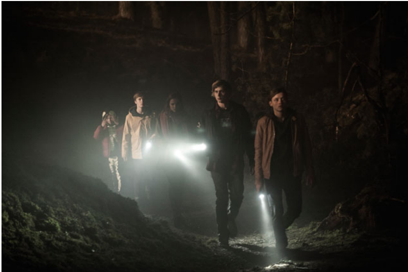
Fig. 4.4 Dark, the first German Netflix drama.

Internet-based television, especially in the area of subscription video-on-demand (SVoD), continues to unfurl. In November 2019, Apple TV+ became available in Germany, then in March 2020, Disney+, and in December 2022, Paramount+. They all have commissioned “local” German dramas: Apple TV+ announced the dark comedy Where’s Wanda? (2024) with the well-known actor Heike Makatsch. The first German