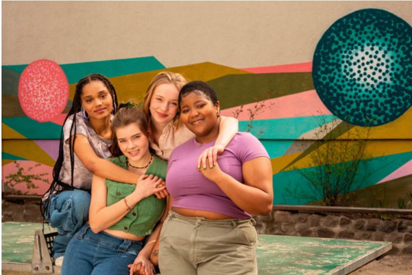
Fig. 4.6 A transmedia youth drama with “real-time” distribution—the German SKAM adaptation DRUCK .

of imported series, and of the demands of its media-savvy younger viewers”, attest Eva Pjajčiková and Petr Szczepanik (2016, 118), specifically regarding public broadcasters (see also Eichner and Esser 2020, 191).