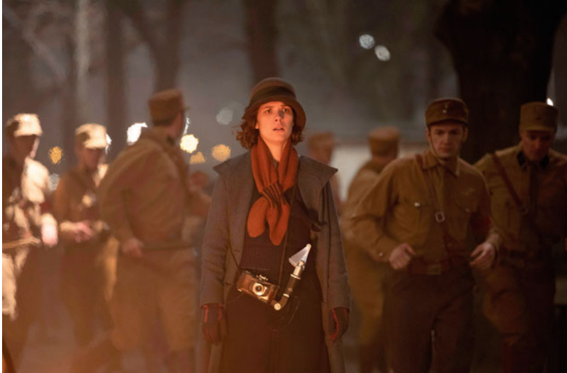
Fig. 4.3 Babylon Berlin , a cooperation between pay TV and public television

Outside the Sky and WarnerTV channels, less prominent and significantly more cheaply produced pay TV dramas from Germany include Spides (2020), so far the singular series production of Syfy, which specialises in science fiction, as well as Post Mortem (2019), a chamber-play-like miniseries on 13th Street, which focuses on thrillers and crime. Both Syfy and 13th Street are niche channels belonging to the US company NBCUniversal and—similar to the TNT/WarnerTV channels—have been distributed via pay TV programme bouquets, especially on Sky. However, further productions from these marginal pay TV providers are currently not to be expected.