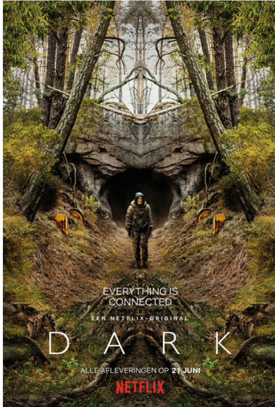
Fig. 6.3 Release in different territories—posters for season two of Dark

and, when it was, only “off the record”. Probably, the practitioners were careful not to discredit Netflix as a potential or actual partner. Given the time of most interviews (2018–2019), it is also likely that many of the practitioners had not yet cooperated with this or other similar transnational SVoD platforms and still looked at them optimistically.