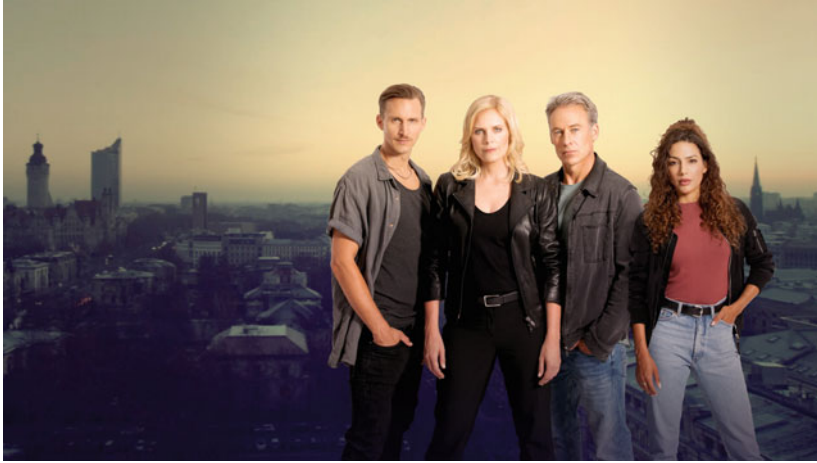
Fig. 4.5 The crime procedural SOKO Leipzig/Leipzig Homicide

are procedural, with a self-contained plot in each episode, while other weekly series, such as the now discontinued Lindenstraße/Linden Street (ARD/WDR, 1985–2020)—a kind of German Coronation Street (ITV, UK 1960–)—skew more towards a soap opera format, with cross-episode storylines. The dramaturgical tendency towards self-contained episodes implies a certain style of script work, where writers develop scripts separately for individual episodes featuring individual cases. 6 In production, the weekly also differs from the industrial daily soap opera in that the producer has more influence on the individual books, according to an industry workshop lecture by Kosack and Barbara Thielen (2015), the managing director of the production company Ziegler Film Köln and former head of fiction at RTL.