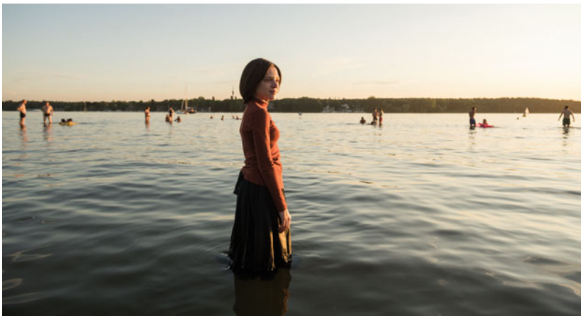
Fig. 6.4 English, Yiddish, German—the multilingual Netflix series Unorthodox

The mystery drama Dark represented an innovation in dealing with the language question, as its commissioner Netflix also made a dubbed version available in the English-speaking market, where foreign films and television programmes (excepting children's and animated formats) are usually only subtitled. But some practitioners regarded Dark 's dubbed version in English as a mere "test balloon" (Jastfelder 2018a) and a clever marketing tactic with which Netflix continued to make a name for itself.