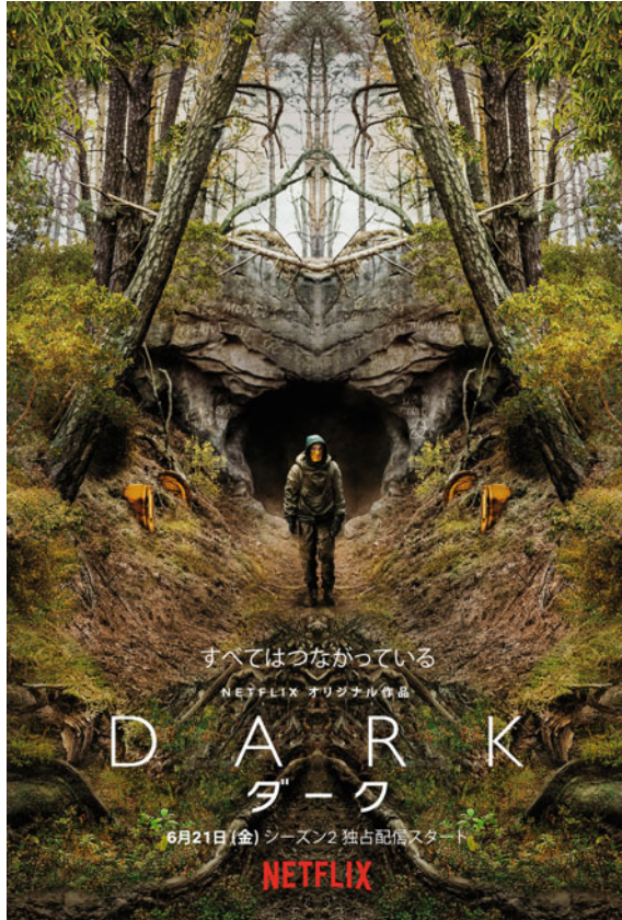
Fig. 6.3 (continued)

consume content in different languages (including with various subtitles)? The interviewed television professionals regularly expressed this hope. Such faith stems from the relative success of some Danish series in the UK in the 2010s (see e.g. Eichner and Esser 2020). “All non-English is completely exotic, still”, however, emphasised Frank Jastfelder (2018a), director of original drama productions at Sky Deutschland. For the period drama Das Boot/The Boat (Sky Deutschland, 2018–), which had not yet