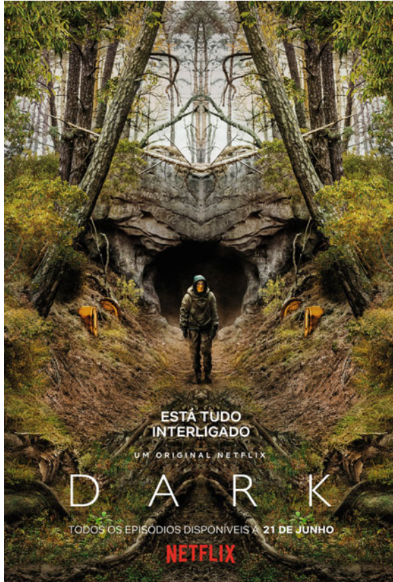
Fig. 6.3 (continued)

productions. However, in this respect, the television landscape in and beyond Germany also appears to be in a process of transformation, as conveyed through the practitioners' self-reflections.