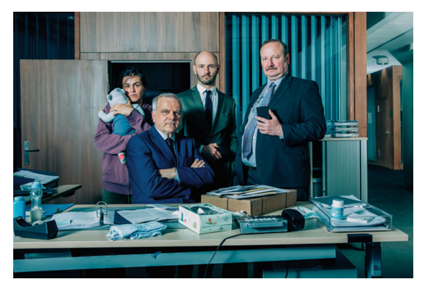
Fig. 4.1 Eichwald , MdB , a TV series from ZDF's Das kleine Fernsehspiel

the Norwegian tween series Lik meg/Like Me (NRK Super, 2018–) and follows the real-time approach of SKAM (NRK, 2015–2017) (see Sundet 2020) and its German adaptation DRUCK/SKAM Germany (Funk/ZDF, 2018–) (see Krauß and Stock 2021). The scenes and sequences that make up the full episodes first appear online as clips. However, as it is a children's programme, ECHT cannot integrate social media into its distribution in the same way SKAM and DRUCK can, and thus still relies on linear distribution on KiKA (see Krauß 2023d).