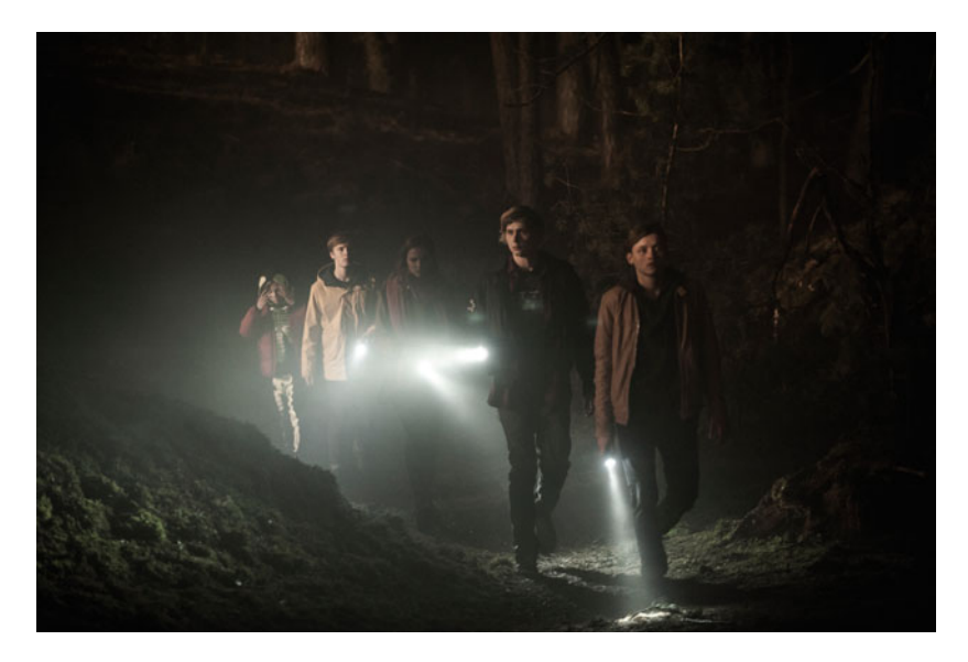
Fig. 4.4 Dark, the first German Netflix drama.

Internet-based television, especially in the area of subscription videoon-demand (SVoD), continues to unfurl. In November 2019, Apple TV+ became available in Germany, then in March 2020, Disney+, and in December 2022, Paramount+. They all have commissioned "local" German dramas: Apple TV+ announced the dark comedy Where's Wanda? (2024) with the well-known actor Heike Makatsch. The first German