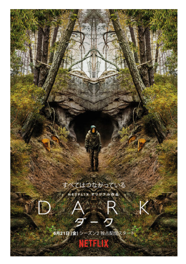
Fig. 6.3 (continued)

consume content in different languages (including with various subtitles)? The interviewed television professionals regularly expressed this hope. Such faith stems from the relative success of some Danish series in the UK in the 2010s (see e.g. Eichner and Esser 2020). "All non-English is completely exotic, still", however, emphasised Frank Jastfelder (2018a), director of original drama productions at Sky Deutschland. For the period drama Das Boot/The Boat (Sky Deutschland, 2018–), which had not yet