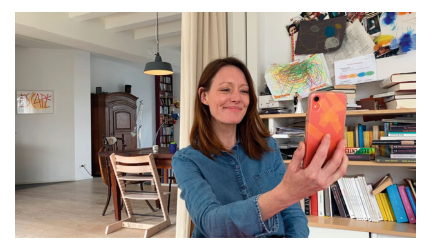
Fig. 3.2 An "instant" drama during the Covid-19 pandemic: Drinnen—Im Internet sind alle gleich.

Shows such as Drinnen point to a new flexibility in the commissioning editor's work. However, the idea that editorial supervision could disappear completely, especially with the new transnational streaming platforms, public programme providers and smaller commercial stations with leaner structures, and that creative freedom automatically leads to more quality-a notion that has been circulating in the industry for a whileis increasingly turning out to be a pipe dream. On the one hand, my surveys found dismissive voices in the industry regarding critical failures such as the Amazon production You Are Wanted, which reportedly was made without editor input but nevertheless-or perhaps precisely because of this-developed an extremely complicated project network. On the other hand, Netflix and Amazon Prime Video are increasingly bringing experts in German-language fiction development in-house, including staff from public-service broadcasting, as evidenced by an editor for Das kleine Fernsehspiel (The Little Television Play) moving from ZDF to Netflix in 2018. Although long-time ZDF editor Lucas Schmidt left Netflix after just under a year (presumably due to a different corporate culture and