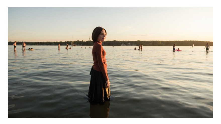
Fig. 6.4 English, Yiddish, German—the multilingual Netflix series Unorthodox

The mystery drama Dark represented an innovation in dealing with the language question, as its commissioner Netflix also made a dubbed version available in the English-speaking market, where foreign films and television programmes (excepting children's and animated formats) are usually only subtitled. But some practitioners regarded Dark 's dubbed version in English as a mere "test balloon" (Jastfelder 2018a) and a clever marketing tactic with which Netflix continued to make a name for itself.