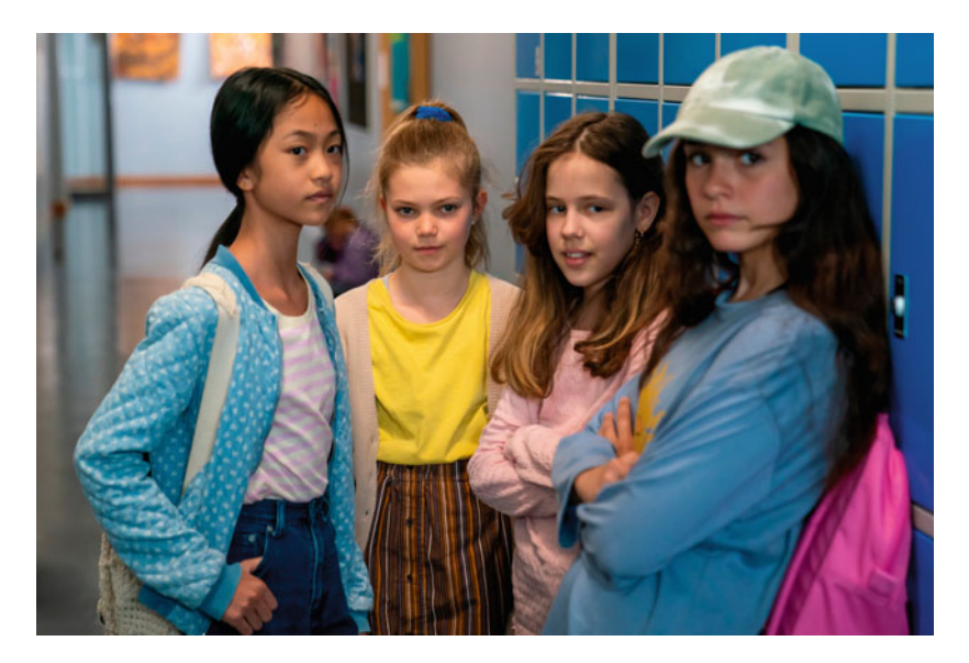
Fig. 4.2 ECHT, a preteen "real-time" drama

circulating on these external platforms. Instead of public-service principles, the few "GAFAM" corporations (Google, Apple, Facebook, Amazon and Microsoft) and TikTok shape its distribution.