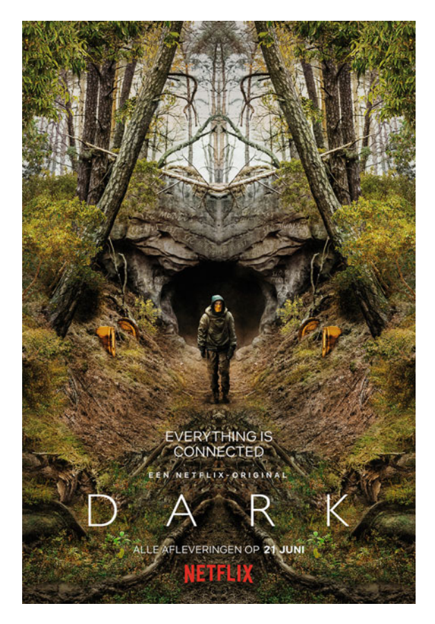
Fig. 6.3 Release in different territories—posters for season two of Dark

and, when it was, only "off the record". Probably, the practitioners were careful not to discredit Netflix as a potential or actual partner. Given the time of most interviews (2018–2019), it is also likely that many of the practitioners had not yet cooperated with this or other similar transnational SVoD platforms and still looked at them optimistically.