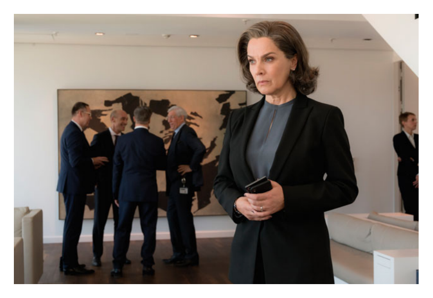
Fig. 5.1 Bad Banks, a German-Luxembourg financial thriller from ZDF and Arte

(2018), at the time of the interview head of fiction at the commercial channel Vox, spoke of certain "parameters" for co-produced procedurals such as Gone (Vox et al. 2017): "It should be very catchy [...], it has to be 'case of the week' structure, it can't be too top-heavy in terms of premise, so it shouldn't have three or more hooks".