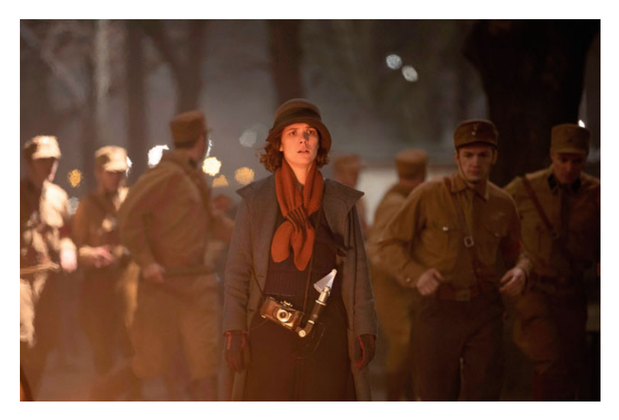
Fig. 4.3 Babylon Berlin , a cooperation between pay TV and public television

Outside the Sky and WarnerTV channels, less prominent and significantly more cheaply produced pay TV dramas from Germany include Spides (2020), so far the singular series production of Syfy, which specialises in science fiction, as well as Post Mortem (2019), a chamber-play-like miniseries on 13th Street, which focuses on thrillers and crime. Both Syfy and 13th Street are niche channels belonging to the US company NBCUniversal and—similar to the TNT/WarnerTV channels—have been distributed via pay TV programme bouquets, especially on Sky. However, further productions from these marginal pay TV providers are currently not to be expected.