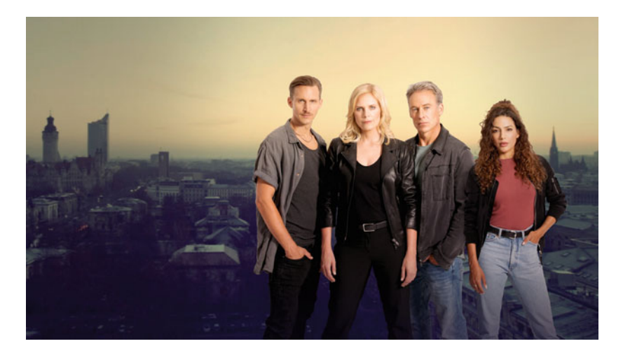
Fig. 4.5 The crime procedural SOKO Leipzig/Leipzig Homicide

are procedural, with a self-contained plot in each episode, while other weekly series, such as the now discontinued Lindenstraße/Linden Street (ARD/WDR, 1985–2020)—a kind of German Coronation Street (ITV, UK 1960–)—skew more towards a soap opera format, with cross-episode storylines. The dramaturgical tendency towards self-contained episodes implies a certain style of script work, where writers develop scripts separately for individual episodes featuring individual cases.<sup>6</sup> In production, the weekly also differs from the industrial daily soap opera in that the producer has more influence on the individual books, according to an industry workshop lecture by Kosack and Barbara Thielen (2015), the managing director of the production company Ziegler Film Köln and former head of fiction at RTL.