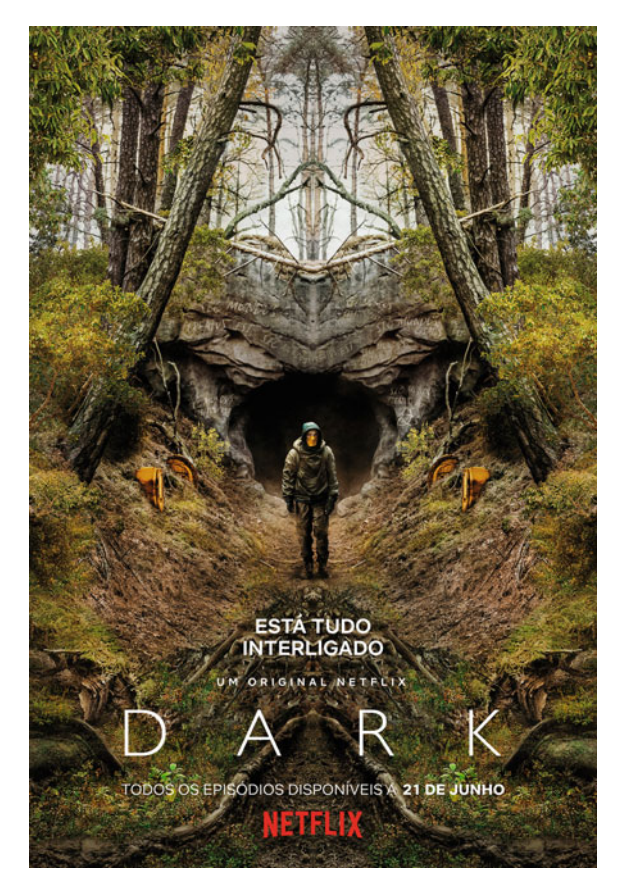
Fig. 6.3 (continued)

productions. However, in this respect, the television landscape in and beyond Germany also appears to be in a process of transformation, as conveyed through the practitioners' self-reflections.