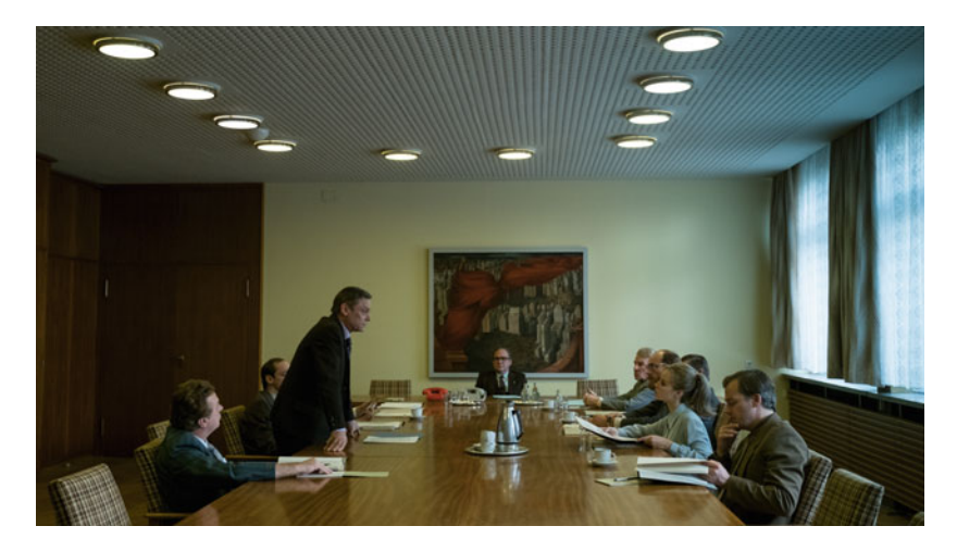
Fig. 6.2 Series export in a changing TV landscape—a still from the second-season Deutschland 86

Regardless of the actual licence payments made, the production of Deutschland 83 represented an innovation for TV drama exports in the German context—on the one hand because it reached the US market, which until then had been closed to German television fiction, and, on the other, because the US broadcast took place before the German one. The long-standing rule that a series must first succeed in the German market before being exported to other countries no longer seems compelling.