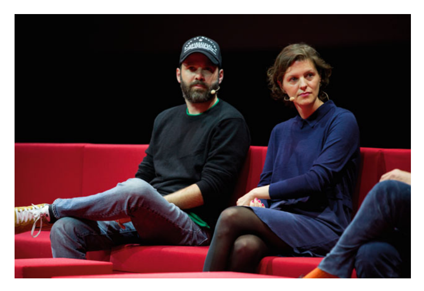
Fig. 5.2 Jantje Friese and Baran bo Odar, the creators of Dark and 1899 , at a Netflix panel in Paris, 2016

When I then asked Friese what role the production company behind Dark , Wiedemann and Berg, played under the "overall deal" conditions, she answered with a laugh that "time was up", as if it were a sensitive issue, and then immediately followed up with: