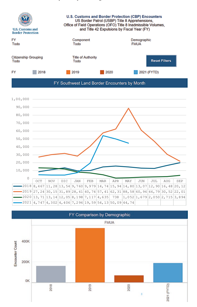
Fig. 4.1 U.S. Customs and Border Protection (CBP) Encounters. Source: USBP and OFO official year end reporting for FY18-FY20; USBP and OFO month end reporting for FY21 to date. Data is current as of 6/3/2021