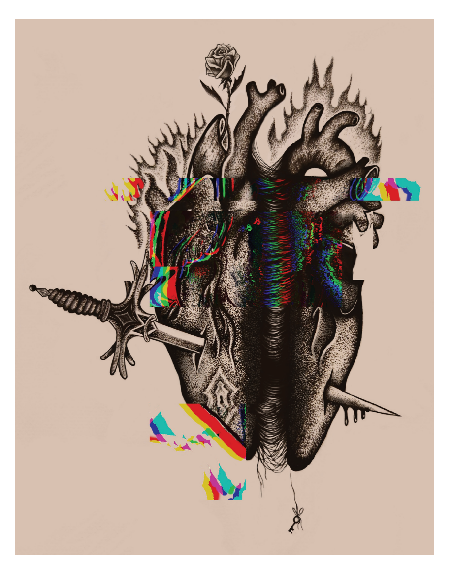
Figure 0.1 A Heart Divided. Artwork by Louise.