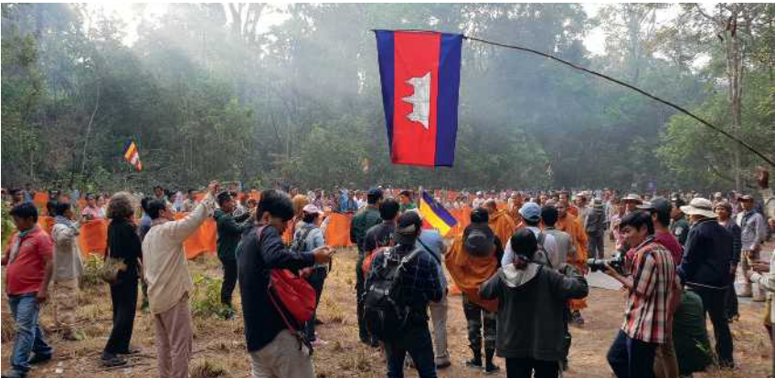
Figure 6.2 Tree ordination ceremony by the Prey Lang Community Network. Text, p. 124.