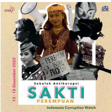
Figure 7.1 SAKTI Anti-Corruption School poster. Text, p. 150.