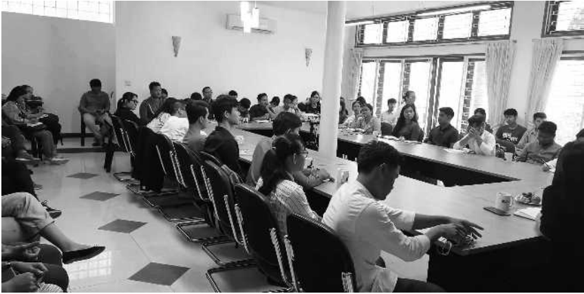
Figure 5.1 Politikoffee forum. Colour , p. 262.

and key members have come to be seen as speaking for their generation, and are consulted by international media, international organisations and the foreign diplomatic community.