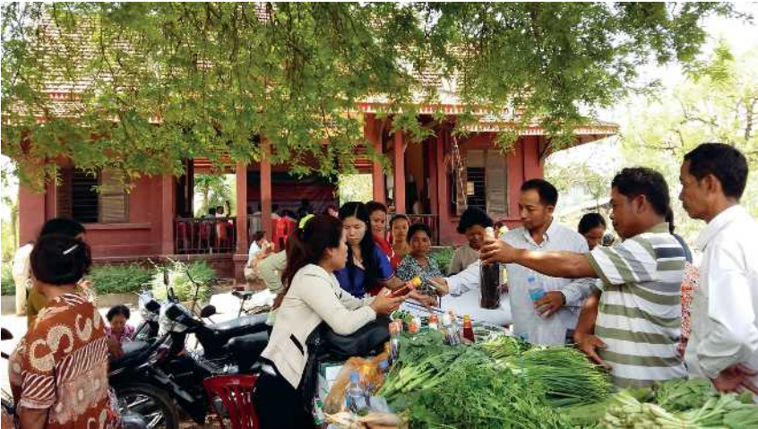
Figure 9.1 CEDAC -organised local fair. Text, p. 190.