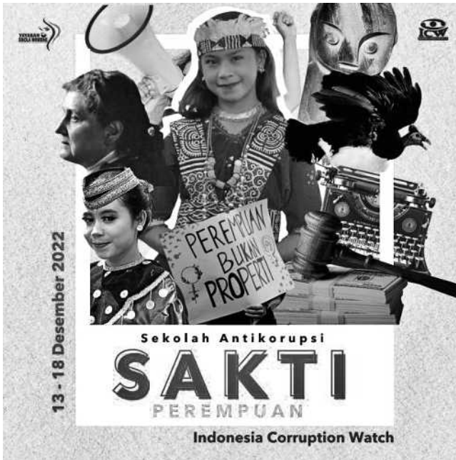
Figure 7.1 SAKTI Anti-Corruption School poster. Colour , p. 263.

government, teaching them about specific issues; for instance, oil companies are taught about issues in the extractive sector. In this manner, ICW has positioned itself as a pioneer in the anti-corruption field. It has also created new networks among anti-corruption actors in the bureaucratic, electoral and extractive sectors.