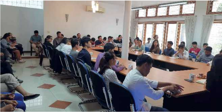
Figure 5.1 Politikoffee forum. Text, p. 93.