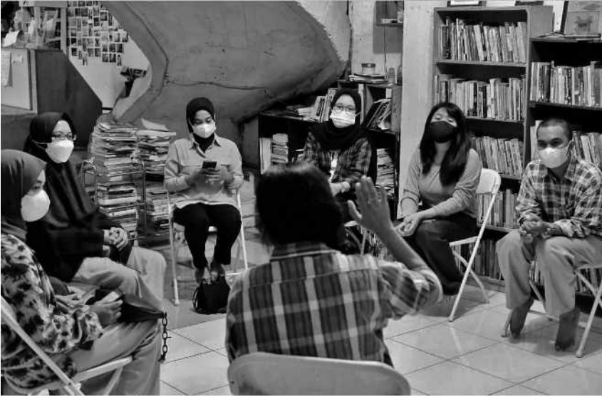
Figure 8.1 Katakkerja literacy movement, sub-organisation of Innawa (courtesy Collection of Innawa). Colour , p. 264.

dinates with) other units. The community is also part of INSIST (Indonesian Society for Social Transformation), a Yogyakarta-based consortium of CSOs founded by Mansour Fakhri, a respected CSO figure.