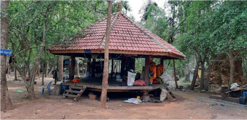
Figure 6.1 Forest headquarters of the Monks' Community Forest, where guests greet the Venerables. Text, p. 120.