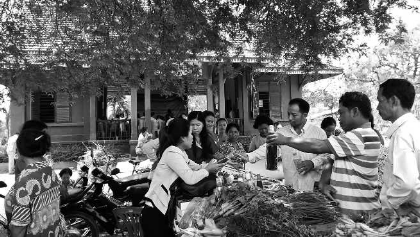
Figure 9.1 CEDAC-organised local fair. Colour , p. 264

The founder of CEDAC, Yang Saing Koma, became well-known to many key stakeholders and a respected civil society figure. Koma came to wield significant influence within the agriculture field, establishing himself as a member of the civil society elite in this field, according to the definition of the term ‘elite’ used in this book. Donor funding to support his ideas and projects was abundant, and was sourced from all the main donors working in the agriculture field at the time. The expansion of CEDAC’s work on the basis of this economic capital and in a context of urgent local demand significantly extended Koma’s and CEDAC’s influence through the farmer associations. By 2010, about 140,000 farming families were implementing SRI in 21 Cambodian provinces and were able to increase their productivity significantly. The support given by CEDAC covered important aspects of production, including (1) training in the SRI method; (2) lowering the cost of production by making organic chemical fertiliser available to farmers; (3) training on climate coping strategies and water storage; (4) support for community-level finance training and training in management for sustainability; and (5) community governance (interview with CEDAC staff member in Kampot province, August 2019). One community leader proudly described the support that his FA had received from CEDAC and emphasised the high level of credibility that CEDAC enjoyed through their work with farmers: