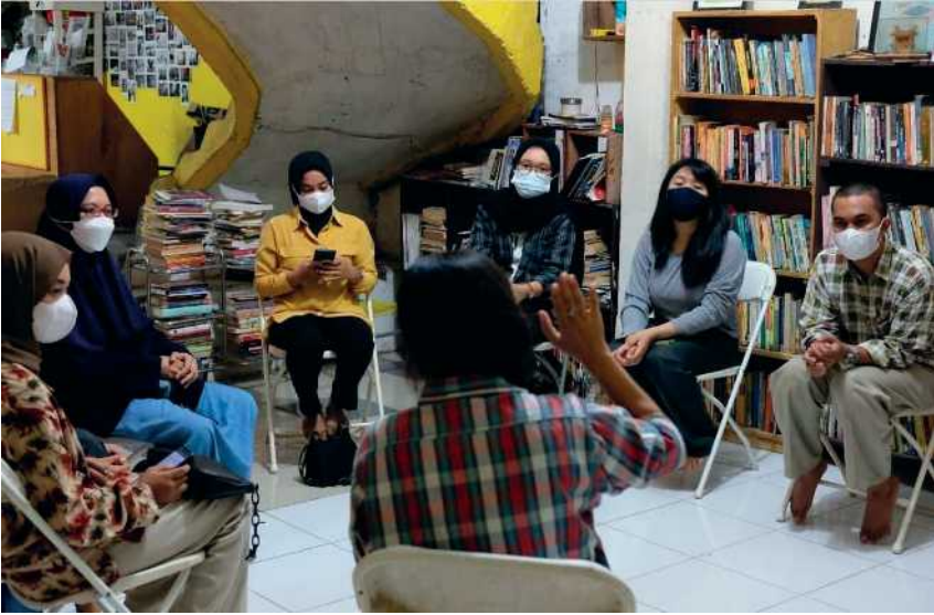
Figure 8.1 Katakerja literacy movement, sub-organisation of Inninawa. Text, p. 164.