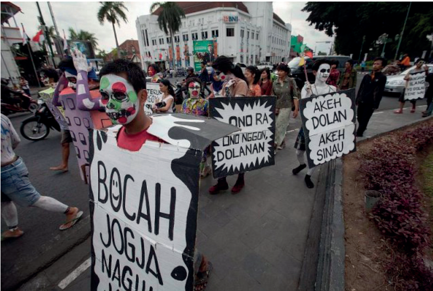
Figure 5.2 Ketjilbergerak members using art as a medium for activism. Text, p. 95.