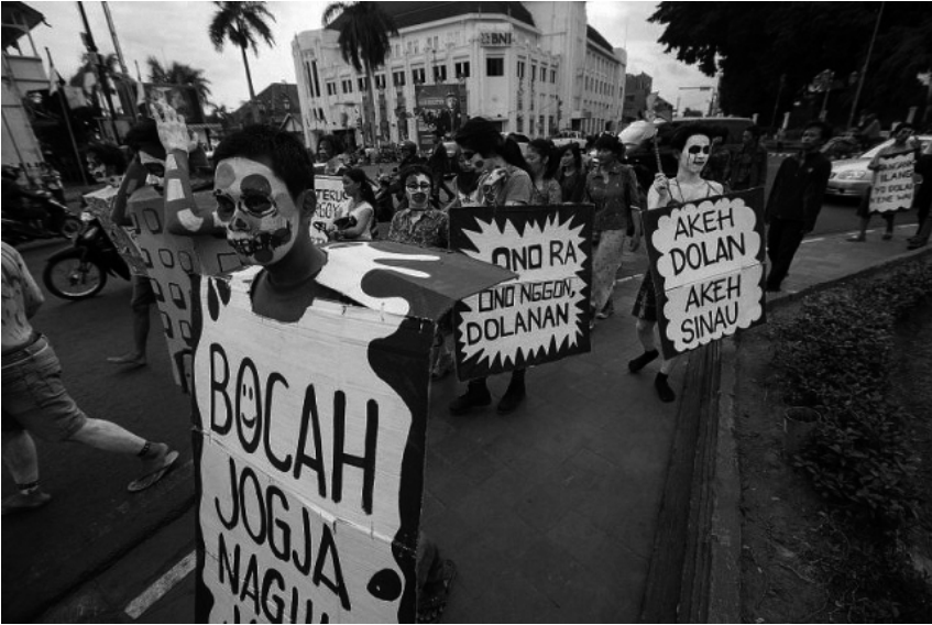
Figure 5.2 Ketjilbergerak members using art as a medium for activism. Colour , p. 262.

discussion, 21 November 2019). As a consequence of its community status, Ketjilbergerak may not collaborate with or receive funding from international donor organisations or other external parties. Any collaborative initiatives supported by external resources must use ad-hoc committees (event organisers), which are separate entities. For activities that are not supported by external sources, Ketjilbergerak raises funds by selling merchandise such as t-shirts that have been designed by members.