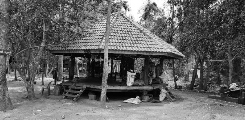
Figure 6.1 Forest headquarters of the Monks' Community Forest, where guests greet the Venerables. Colour, p. 263.