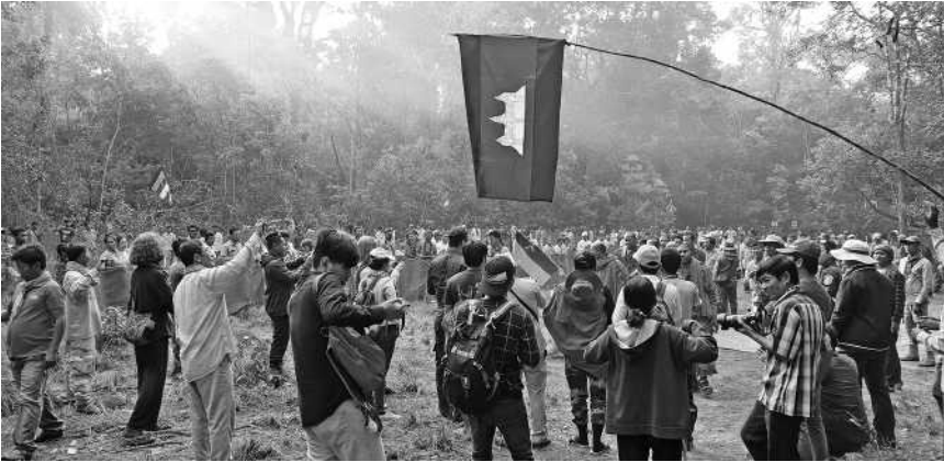
Figure 6.2 Tree ordination ceremony by the Prey Lang Community Network. Colour , p. 263.

authorities – despite the unclear legal status of their activities. There is effective cooperation between the community and the authorities, for example, in the way in which illegal logging is dealt with. PCLN community members have accepted that they must report this to the ministry’s forest rangers and to local authorities and that they are not able to make arrests or press legal charges, or to decide what to do after reporting and submitting confiscated wood, logging equipment or vehicles.