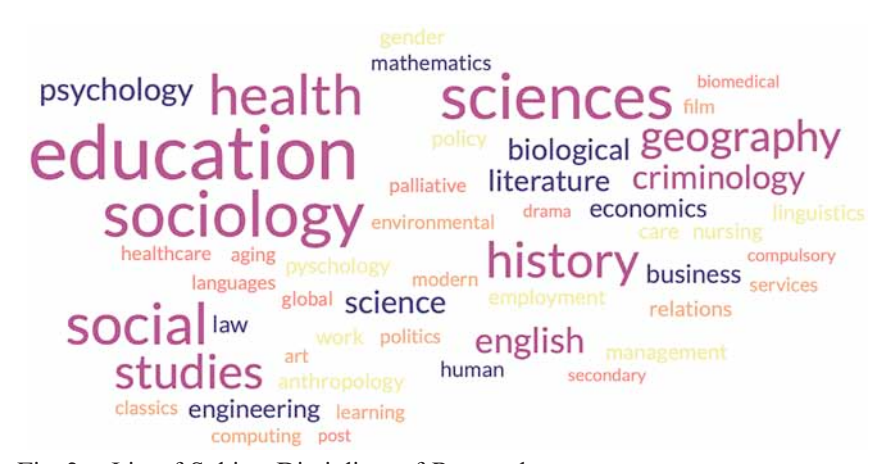
Fig. 2. List of Subject Disciplines of Respondents.

Across the three research phases, I interviewed WCAs from 34 different subject areas, representing a wide disciplinary spectrum (see Fig. 2).