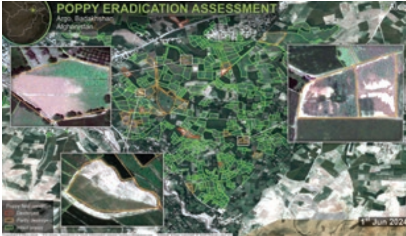
Figure 5. Images from 1 June 2024 showing low levels of eradication (less than 3%) around the district centre of Argo where crop destruction by the Taliban had been centred

claim that all the poppy crops had been destroyed, and large numbers of fields that were left untouched in the villages around the provincial centre of Faizabad (see Figure 5).