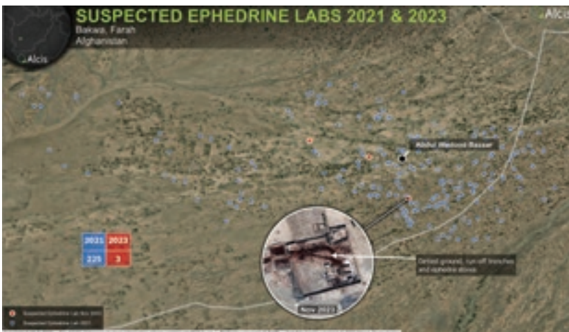
Figure 2. Image analysis showing the dramatic reduction in the number of ephedrine labs in the district of Bakwa in Farah following the Taliban clampdown in September 2021.

A similar iterative process of enforcement can be seen with the Taliban's efforts to ban the methamphetamine industry in the south-western provinces of Farah, where the trade in ephedra, as well as the production of ephedrine and methamphetamine, was concentrated during the former Republic. In December 2021, the Taliban gave traders in the village of Abdul Wadood – the largest entrepôt for ephedra in Afghanistan – one month to sell off the large volumes of ephedra they stored in the bazaar. Once this was achieved, the district governor of Bakwa targeted the ephedrine labs that dominated the district, issuing multiple warnings to owners and chemists, known locally as “cooks”, before eventually raiding and closing Abdul Wadood bazaar on 17 September 2022 – an act serving as a signal for any remaining ephedrine labs to cease operation. While many lab-owners and cooks established labs nearer to the source of the wild ephedra crop in the central highlands, imagery shows there continues to be very little ephedrine production in Bakwa (see Figure 2).