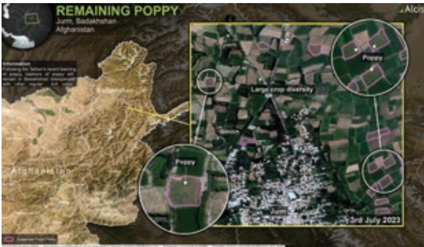
Figure 4: Image analysis showing poppy cultivation in the district of Jurm, Badakhshan Province, in July 2023 despite the imposition of the Taliban ban and an eradication campaign.

just such a task. However, as of January 2024 he had done little to either deter planting or engage in an early eradication campaign against the fall planted crop; he had, rather, spent some time replacing senior posts in the provincial administrations previously held by Tajik's with Pashtuns from other provinces (Hasht e Sabh, 2024)