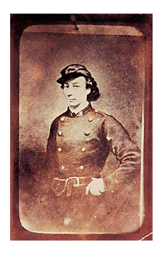
Fig. 6.3 Louise Michel, portant l'uniforme des féderés. 1871. (Public domain)

Subsequently, Michel's cross-dressing has been reinterpreted as a unique sign of her liberation. Galera (2016: 59) considers Michel's it as an expression of her personal freedom, placing Michel within a genealogy of various women who have dressed as men to take power or to move unobserved through spheres dominated by men: "This image of a woman bearing arms exaggerates a liberated figure that corresponds with her radical social project, consolidating the strength of her actions" (Cette image d'une femme manipulant des armes est l'hyperbole de la figure libertaire qui correspondait à la radicalité de leur projet de société et qui consacrait l'obstination de leurs geste). Reading Michel's cross-dressing as a forthright refusal to adhere to the gendered norms of the day reinterprets the representational tropes associated with her during her lifetime. Rather than being seen as an accident of various historical events, Galera's account