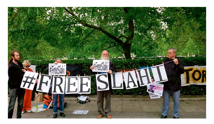
Fig. 2.3 © Aisha Maniar/London Guantánamo Campaign. [permission granted]

how memoir may seed a temporary cycle of activism with a specific, limited goal (Fig. 2.3).