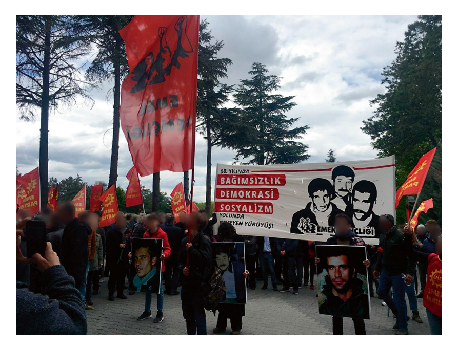
Fig. 5.1 Commemoration of the 50th anniversary of the execution of Deniz Gezmiş, Yusuf Aslan, and Hüseyin İnan in Karşıyaka Cemetery. The banner by the Labour Youth reads: "The endless march towards independence, democracy, socialism in its 50th year." Ankara, Turkey, 6 May 2022.

frontrunners in this endeavour, providing others with a language to remember the 'three saplings.'