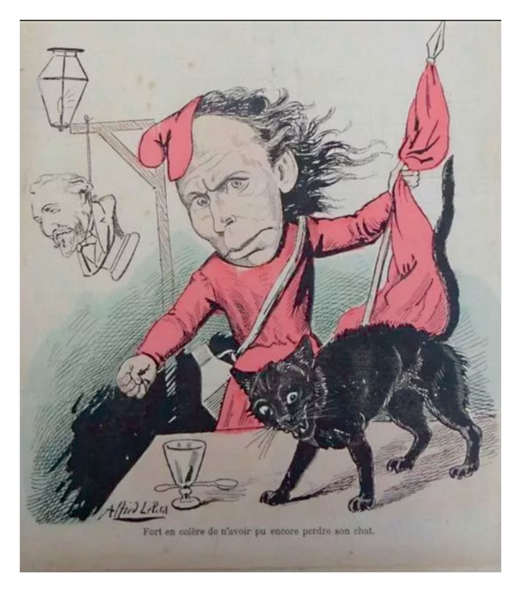
Fig. 6.1 La mère (Louise) Michel. 1881. Le Grelot. Illustration by Alfred Le Petit.

famous work by the painter Jules Girardet, who was vehemently pro-Commune. Girardet cited Michel and the Commune as his favourite subjects and produced a number of works that refer to central moments in Michel's life, using images that echo visual accounts of the lives of saints and showing the many trials and tribulations that Michel passed through on her path to greatness. His paintings, produced shortly after the Commune, chime with a version of Michel as a figure of intense morality, goodness and charity who would give up anything, even her life, for the people (Fig. 6.2). They have gone on to fuel ensuing and contemporary